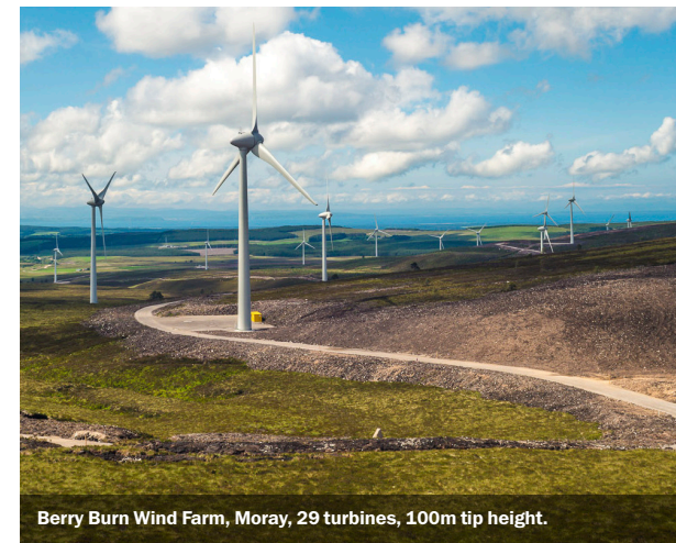
Berry Burn Wind Farm, Moray, 29 turbines, 100m tip height.

Our first exhibition was held in June and July 2021 to introduce ourselves and the An Càrr Dubh (1) Wind Farm proposal. Since then we have progressed our studies and refined the design. We invite you to review our current plans, online or in person, and provide your feedback. We expect to submit our final plans to the Scottish Government in 2022.