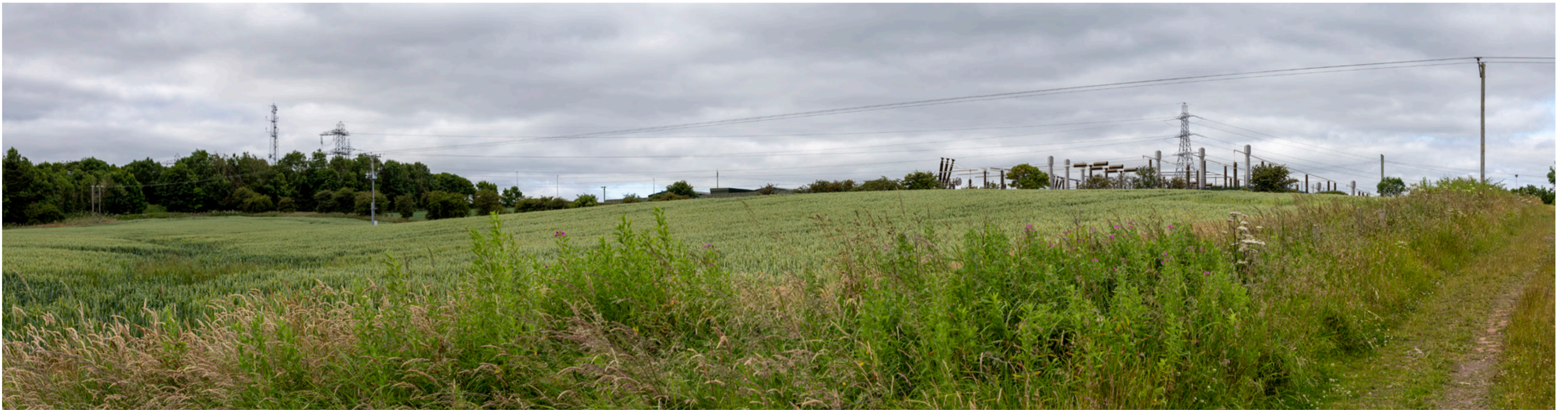
Year 1 after construction