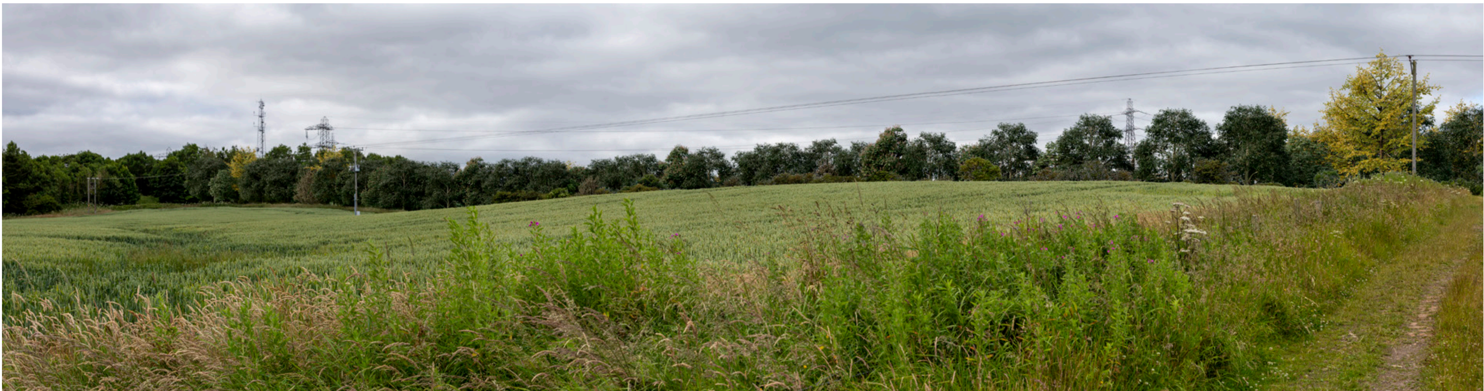
Year 15 after construction