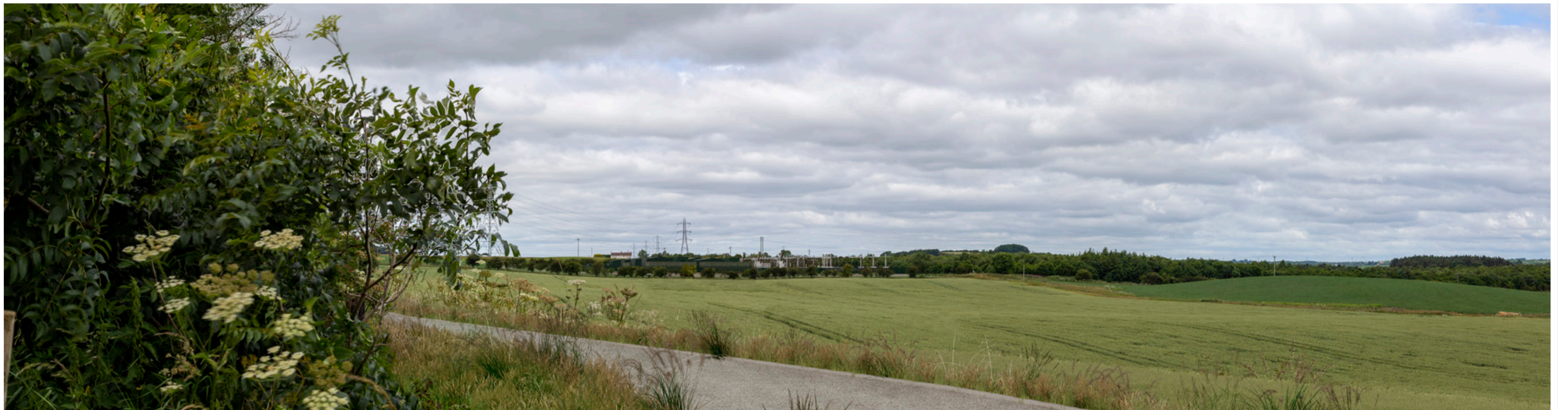
Year 1 after construction