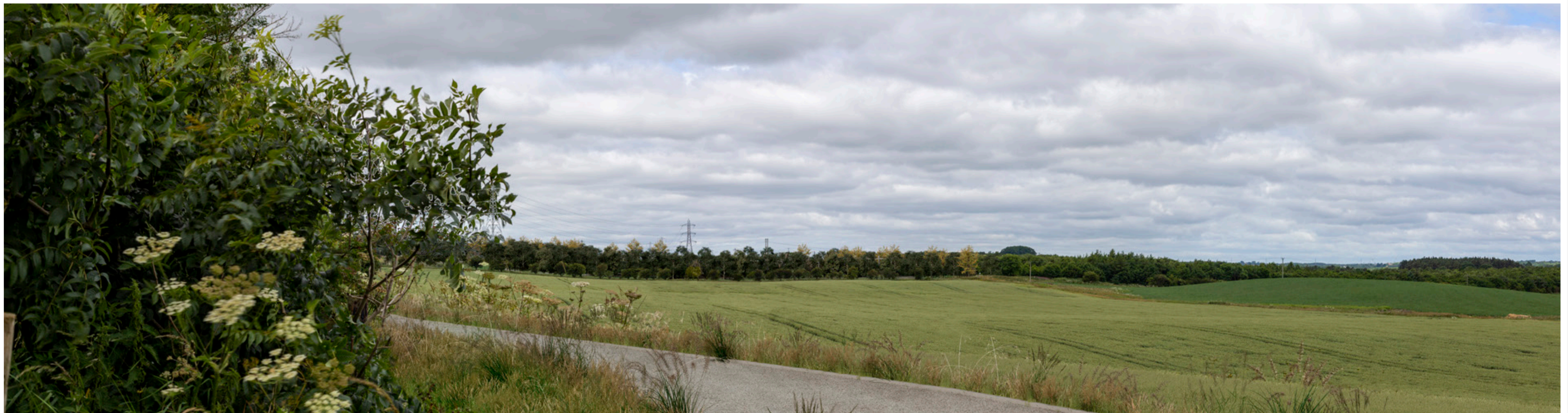
Year 15 after construction