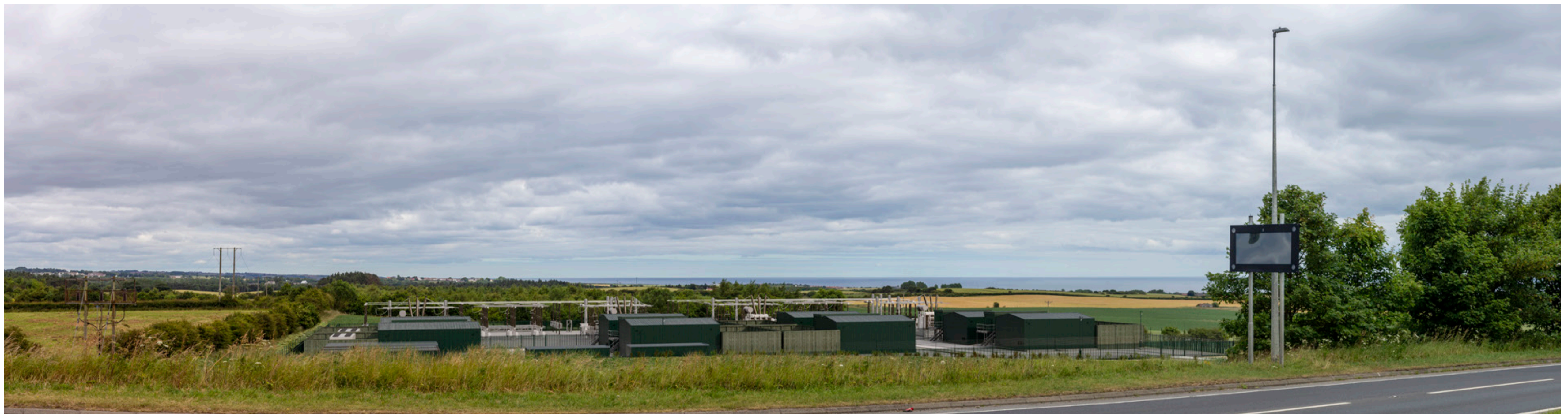
Year 1 after construction