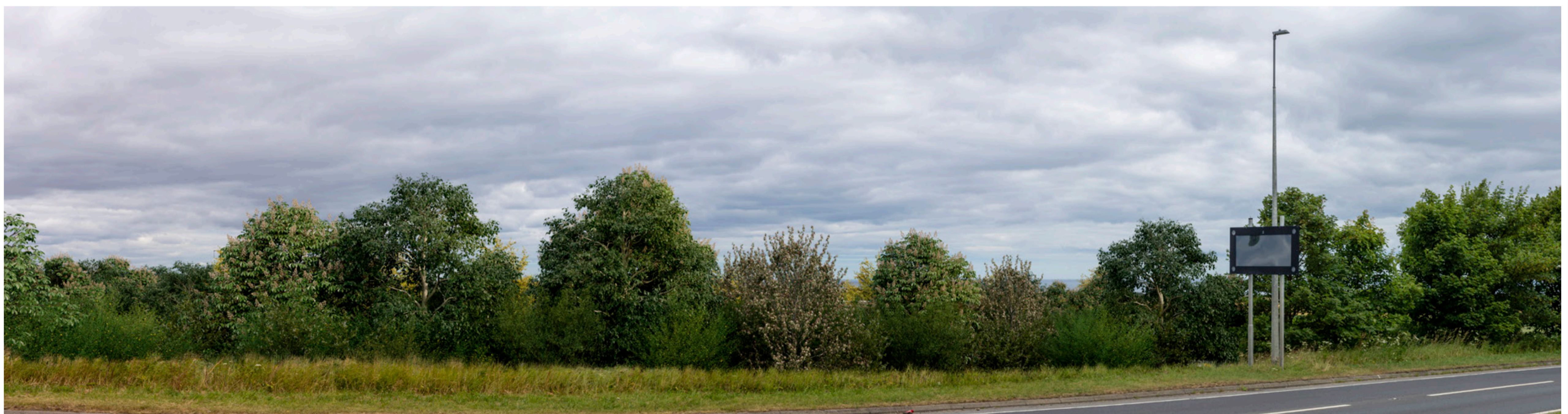
Year 15 after construction