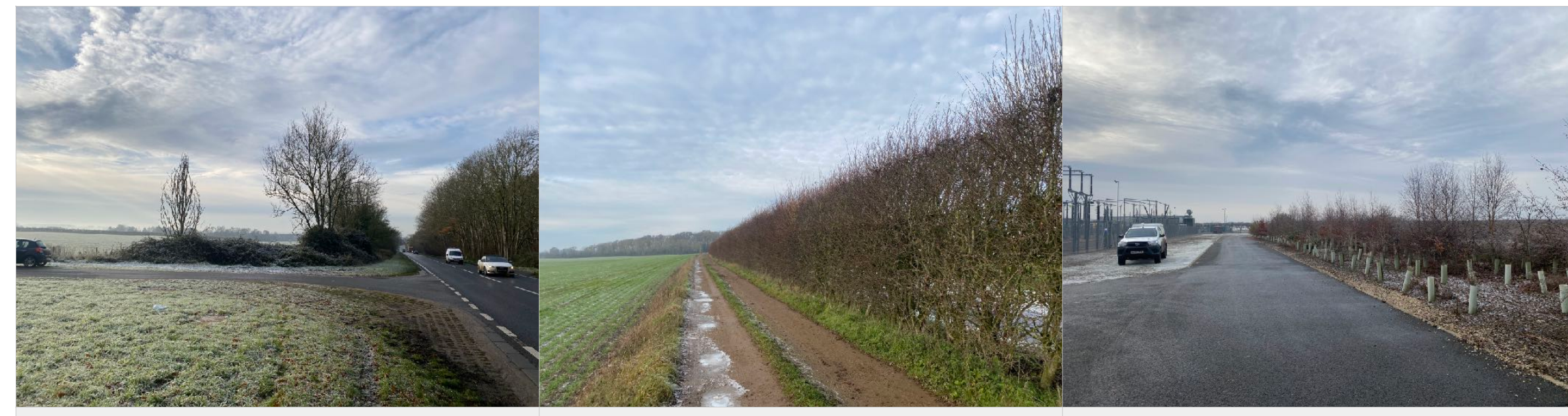
IMAGE 1: Looking south across the existing substation access onto the A47