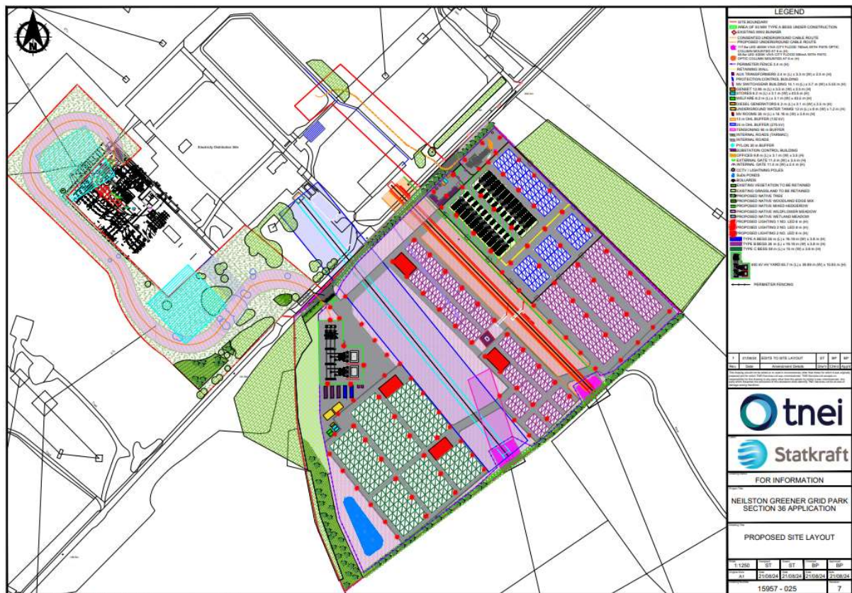
Figure 3.1 Section 36 Application Proposed Site Layout

The redline boundary is shown on the site layout plan in Figure 3.1 below.