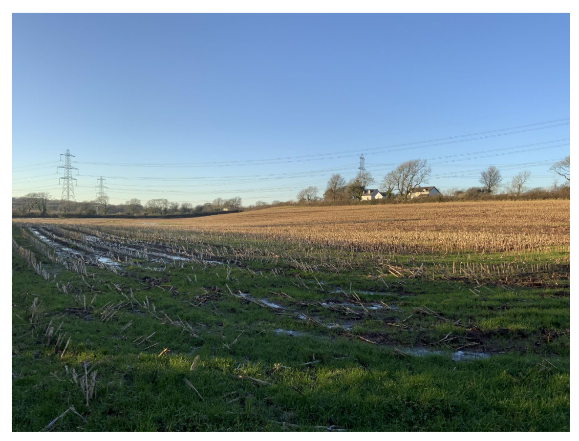
Illus 3 F4, looking west-northwest