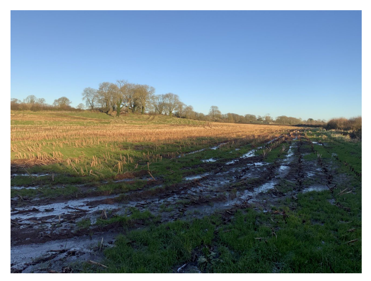
Illus 4 F3, looking east-northeast