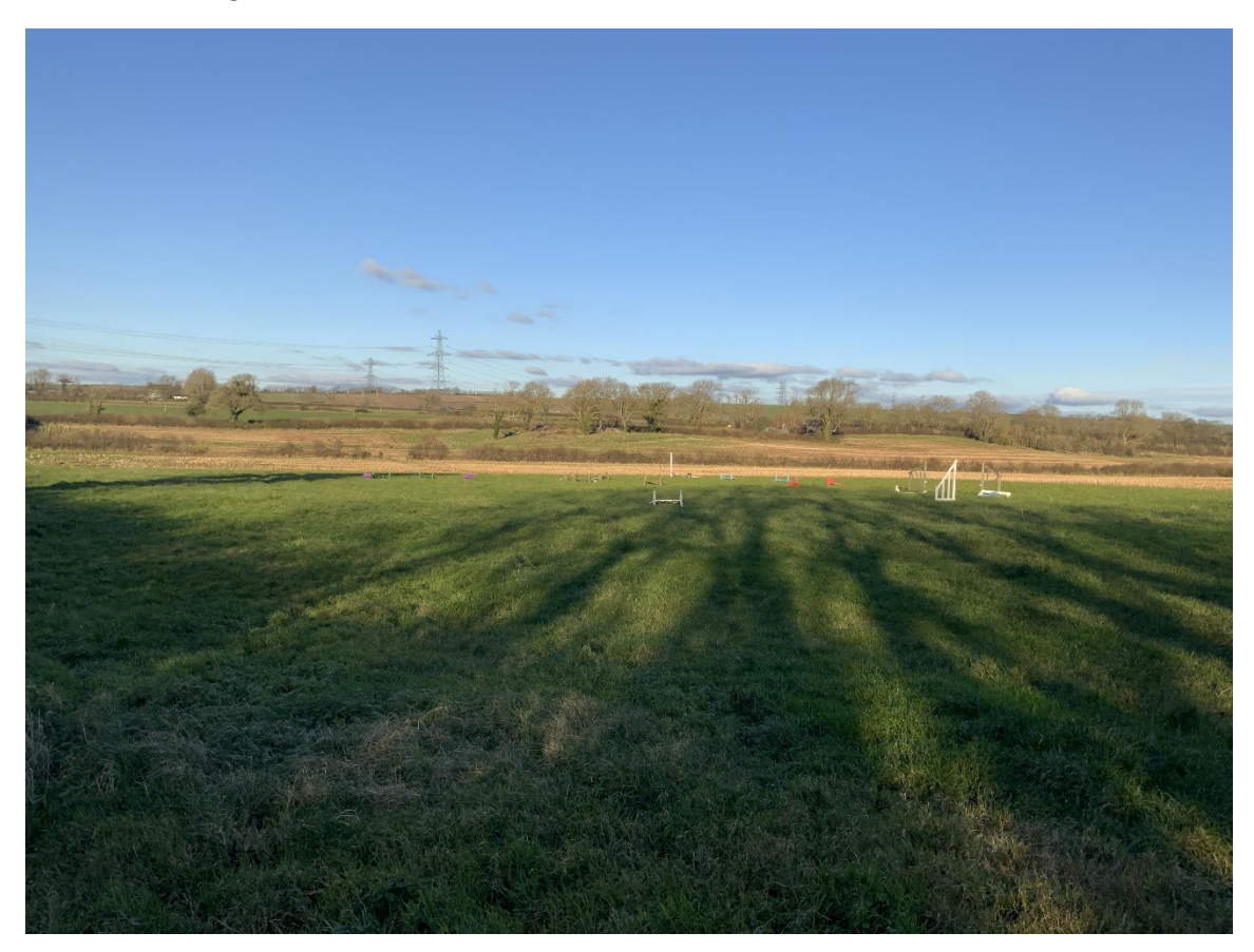
Illus 5 F7, looking northeast