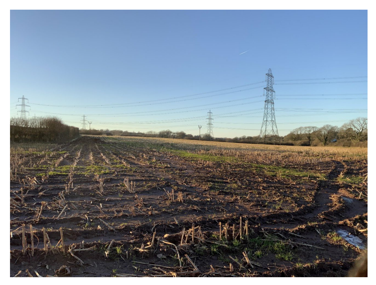
Illus 2 F2, looking west-northwest