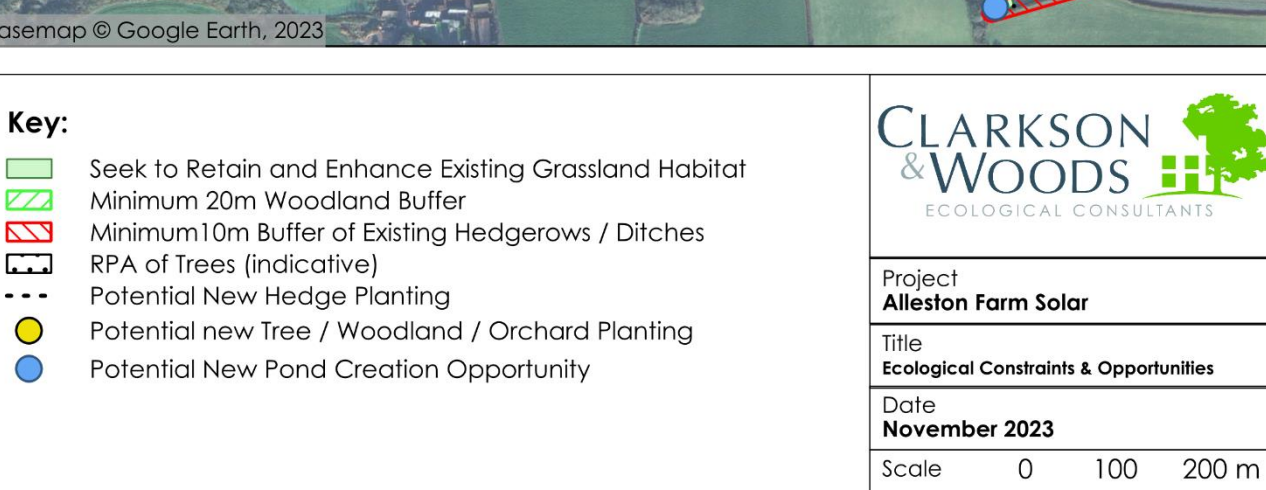
Figure 2: ECOP