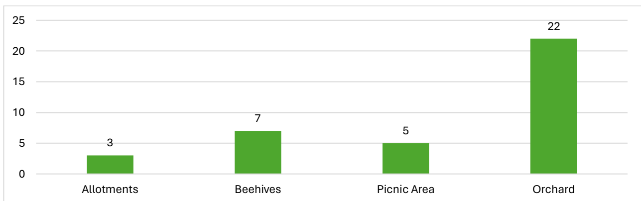
Table 1: Voting outcome for biodiversity and community use within Kitland Solar Farm site

As mentioned above, attendees were invited to vote, by placing marbles in jars, for their preference about how fields within the site could be used for biodiversity and community use.