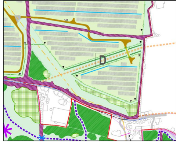
APPEAL SCHEME 9804_100 Rev A