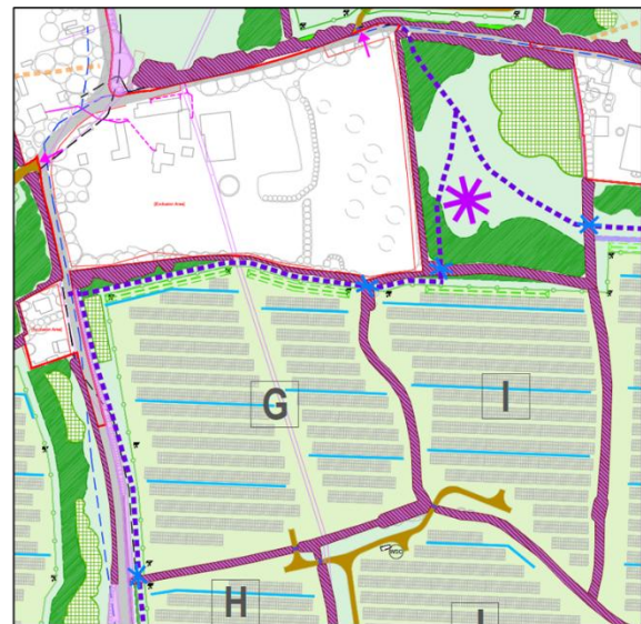
APPEAL SCHEME 9804_100 Rev A