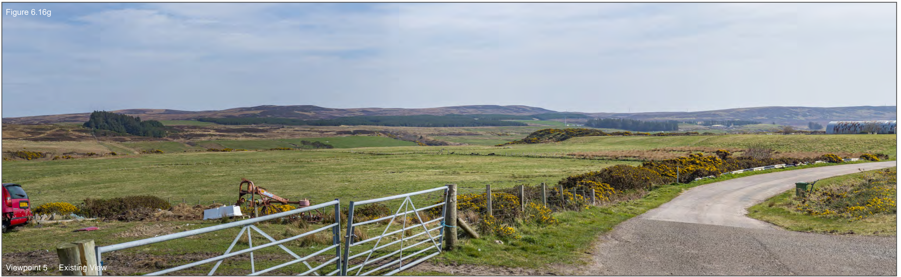
Viewpoint 5 Existing View