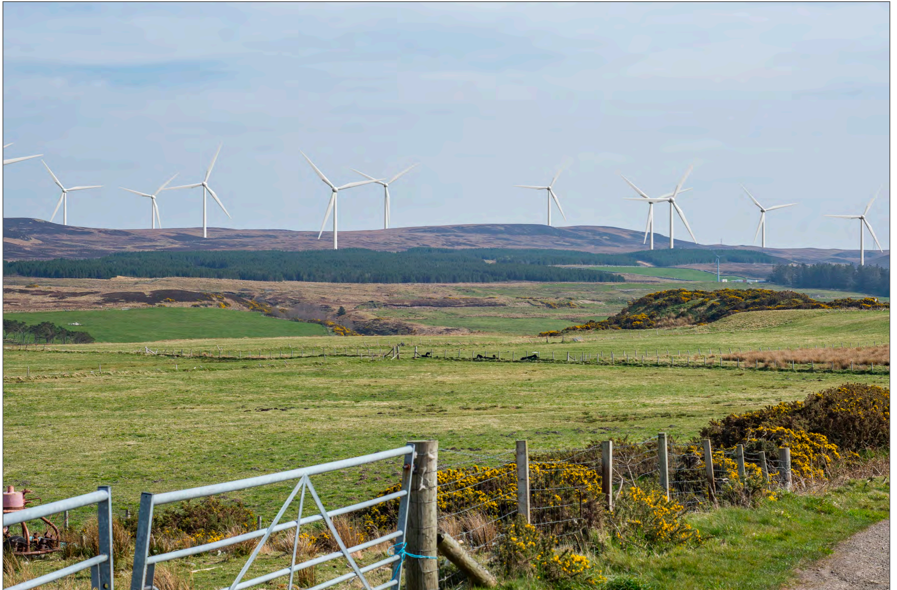
Viewpoint 5 (Figure 6.16i) A836 Melvich