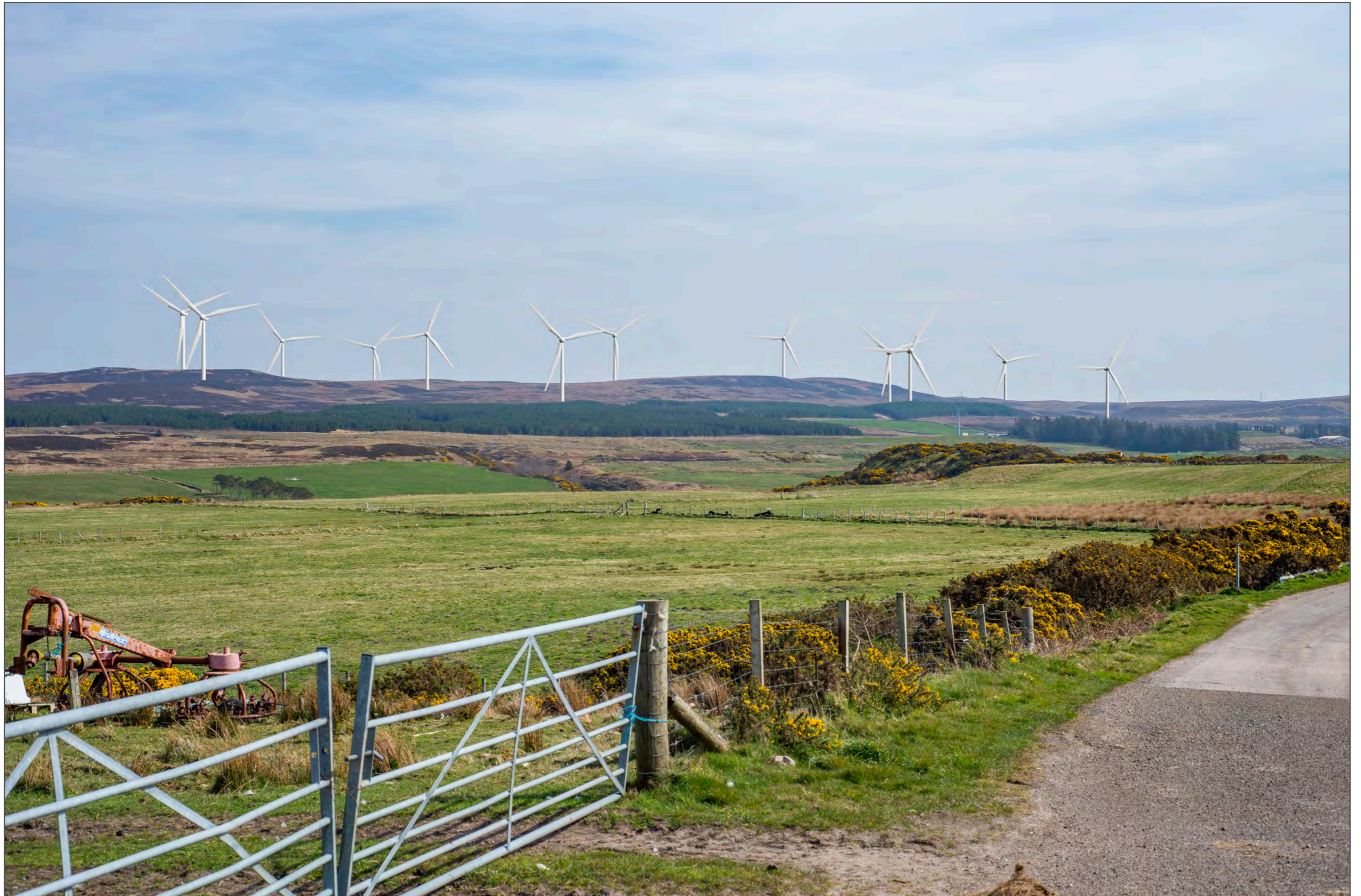
Viewpoint 5 (Figure 6.16h) A836 Melvich