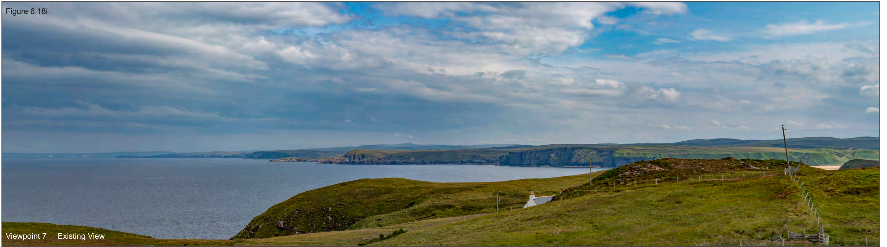
Viewpoint 7 Existing View