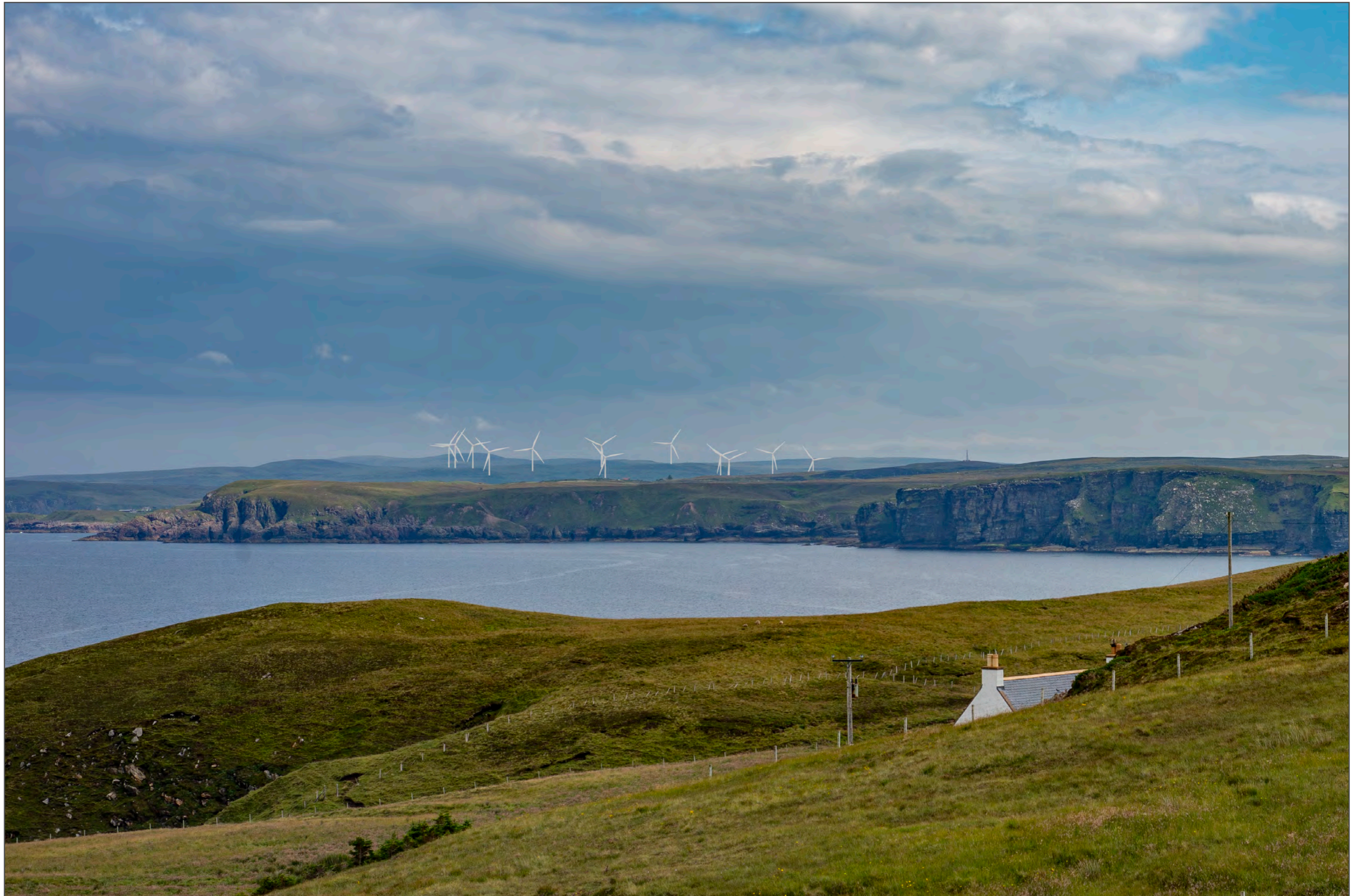
Viewpoint 7 (Figure 6.18k) A836 Strathy Point