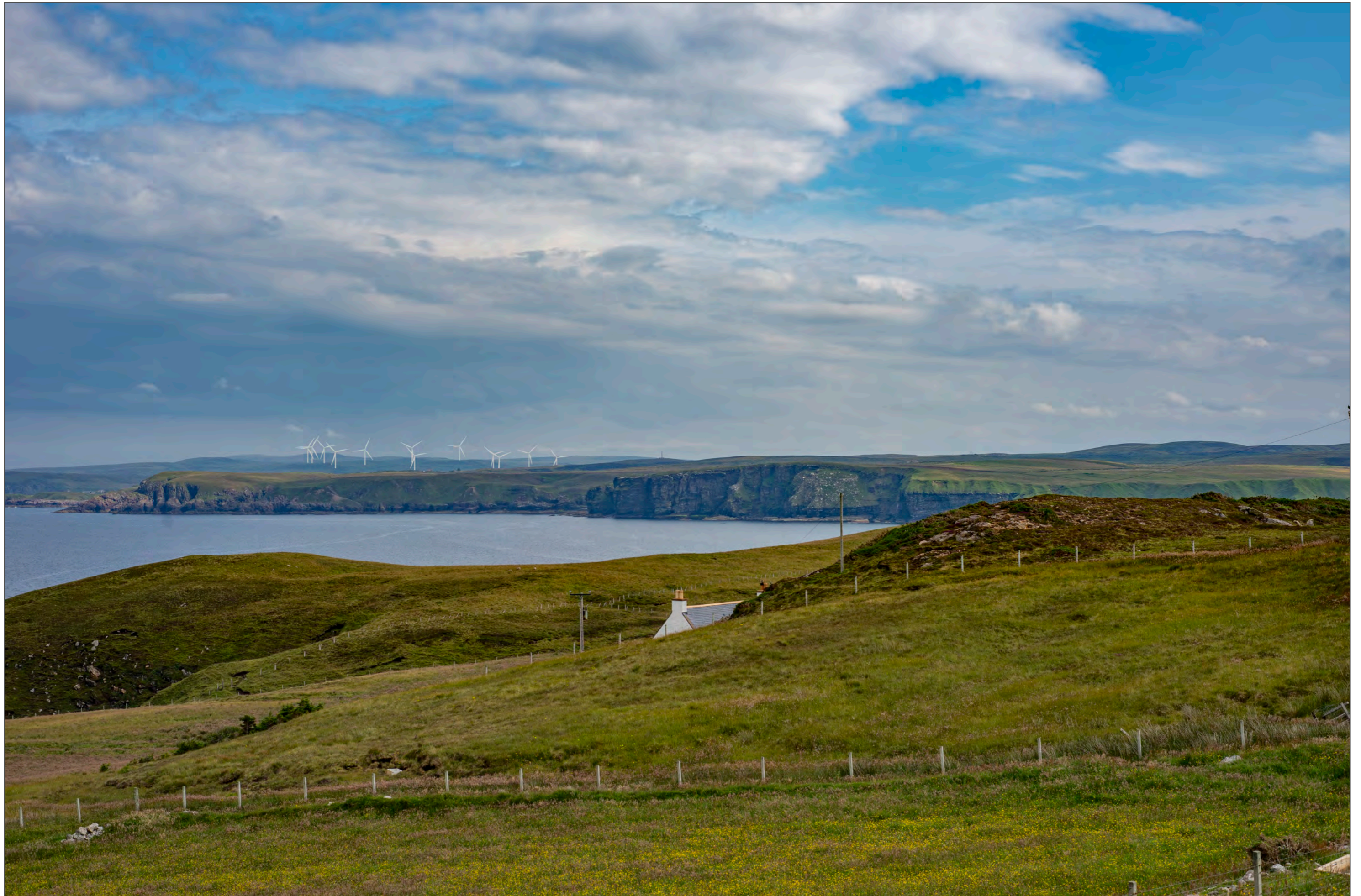
Viewpoint 7 (Figure 6.18j) A836 Strathy Point