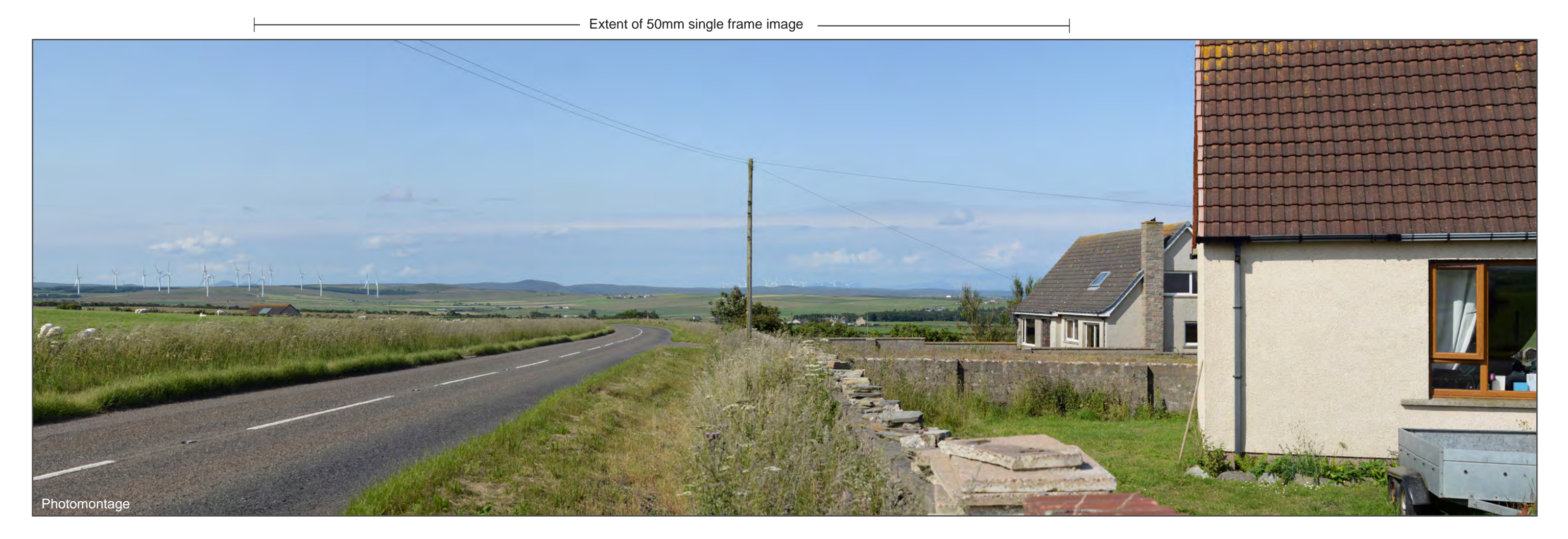
Figure 6.12f Viewpoint 1 A836 Forss

Camera: Nikon D610 Focal Length: 50mm vertical (27°) x 28mm horizontal (65.5°) Camera height: 1.5m Date: 16/07/2019 10:08 Distance to nearest turbine: 15082m