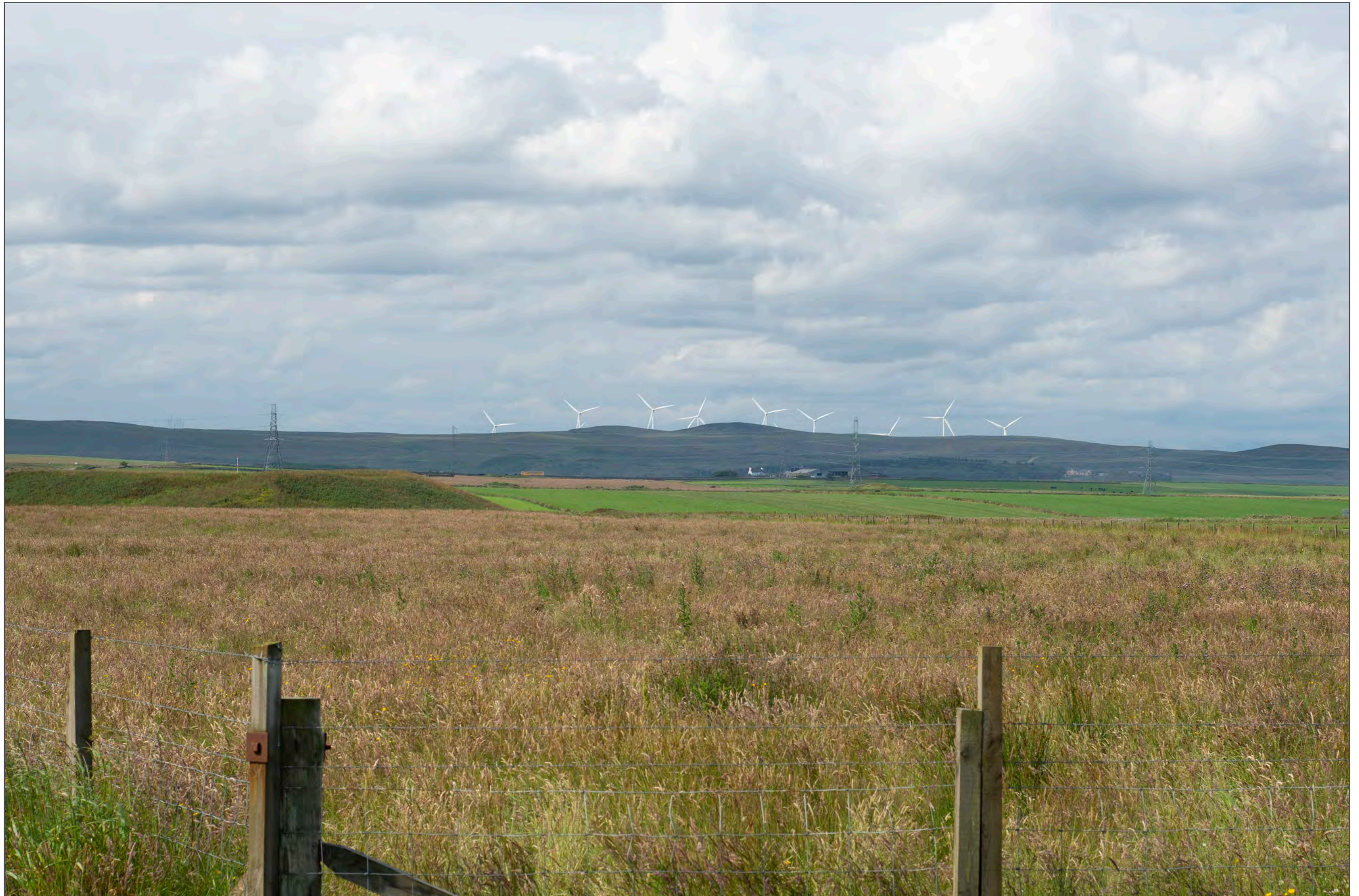
Viewpoint 2 (Figure 6.13k)