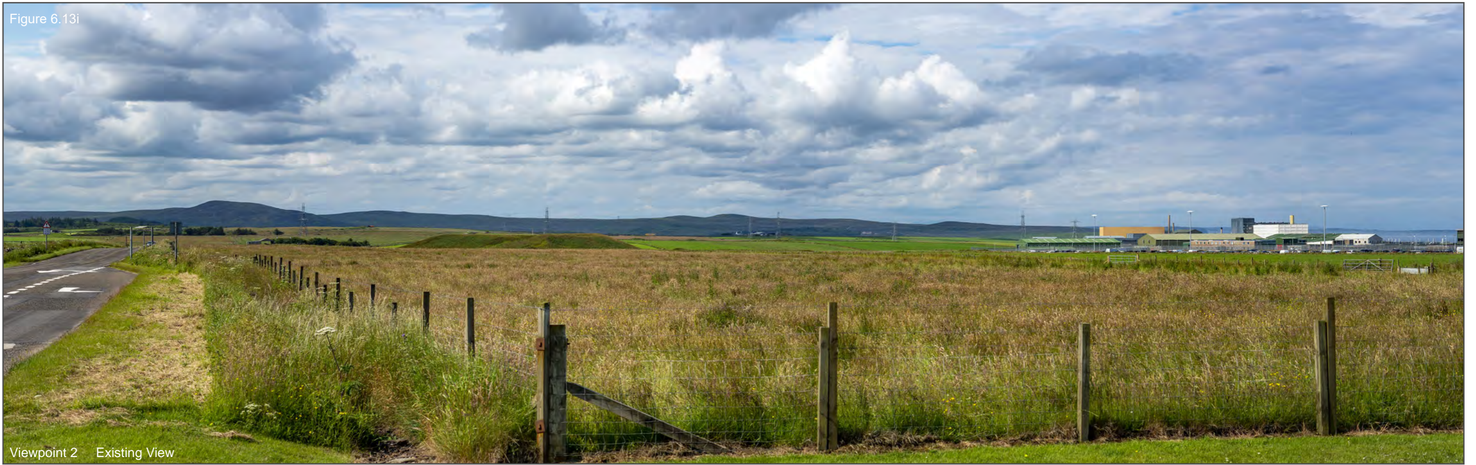
Viewpoint 2 Existing View