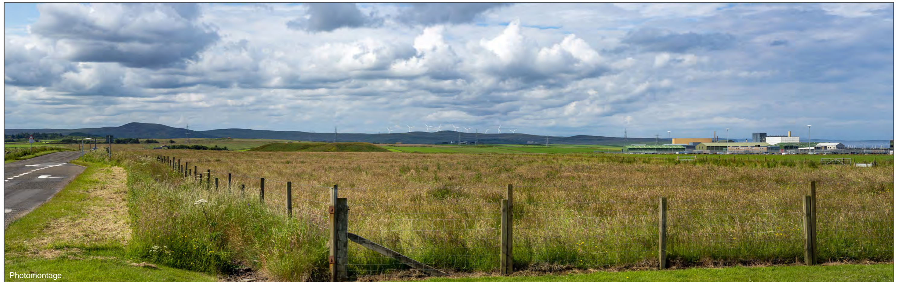
Figure 6.13h Viewpoint 2 A836 Dounreay

Distance to nearest turbine: 8564m Camera: Nikon D610 Focal Length: 50mm vertical (27°) x 28mm horizontal (65.5°) Camera height: 1.5m Date: 16/07/2019 11:01