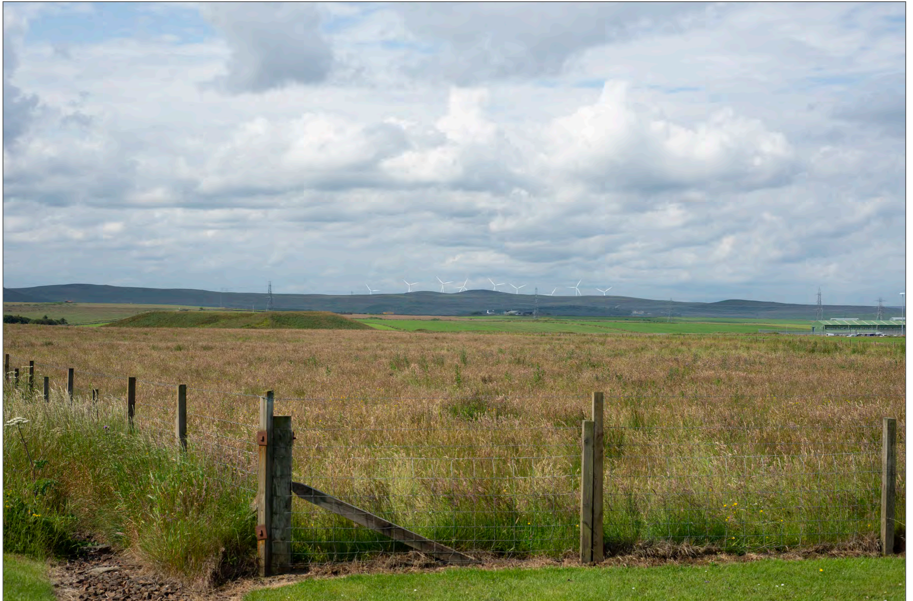
Viewpoint 2 (Figure 6.13j)