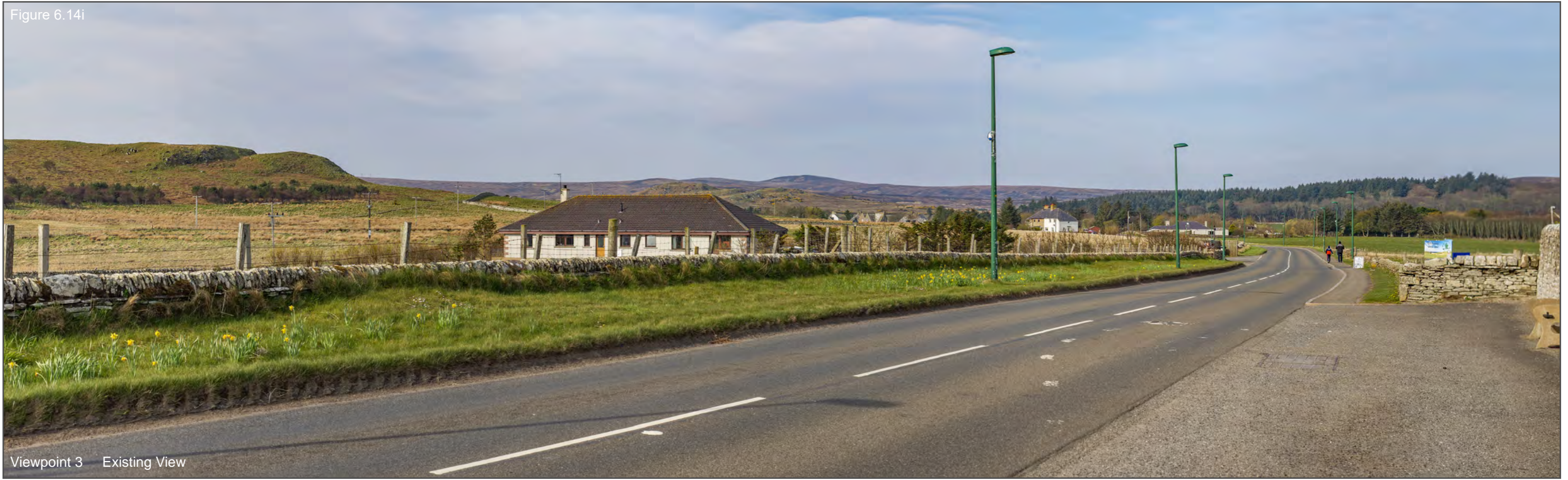
Viewpoint 3 Existing View