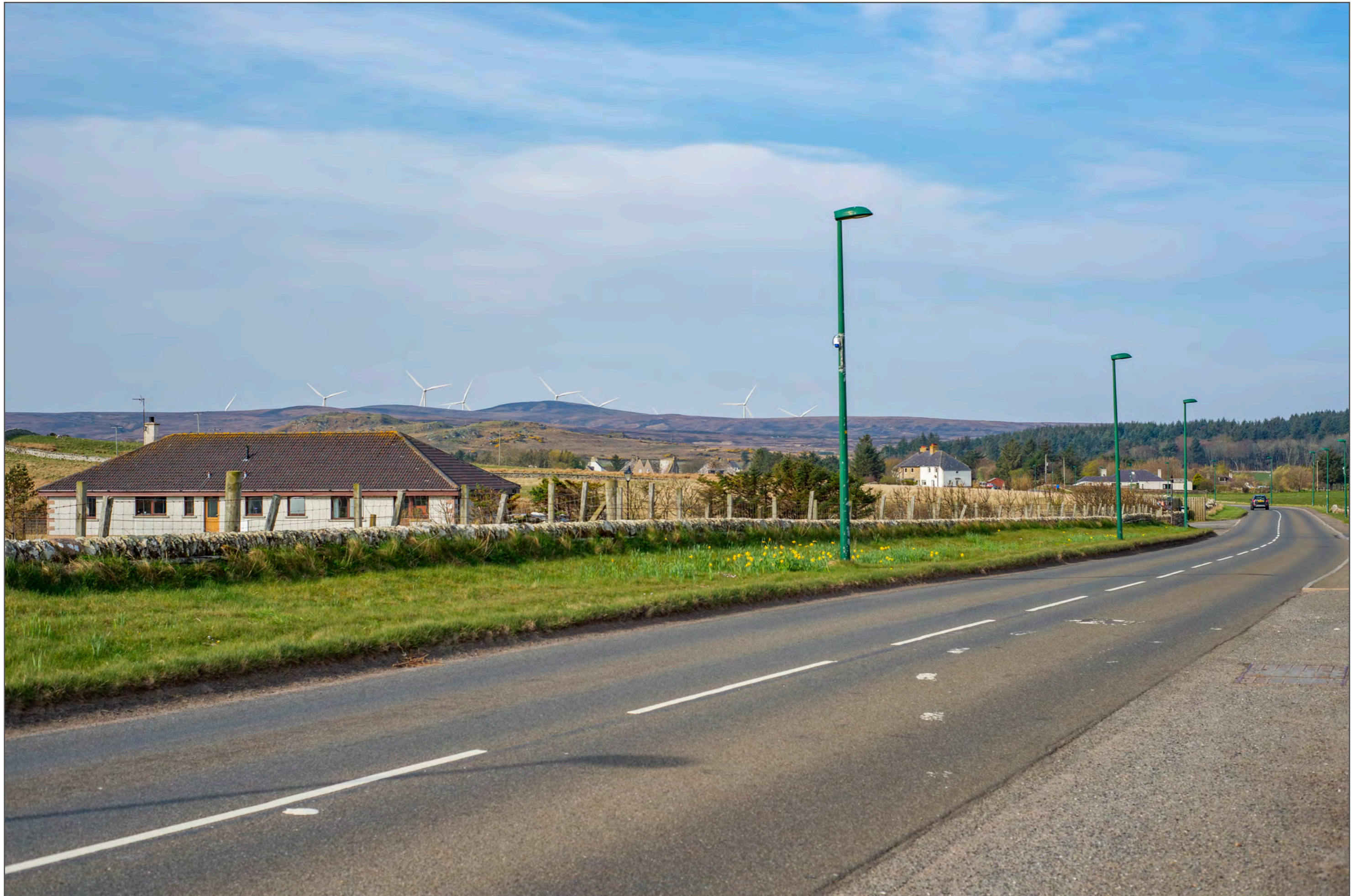
Viewpoint 3 (Figure 6.14j)