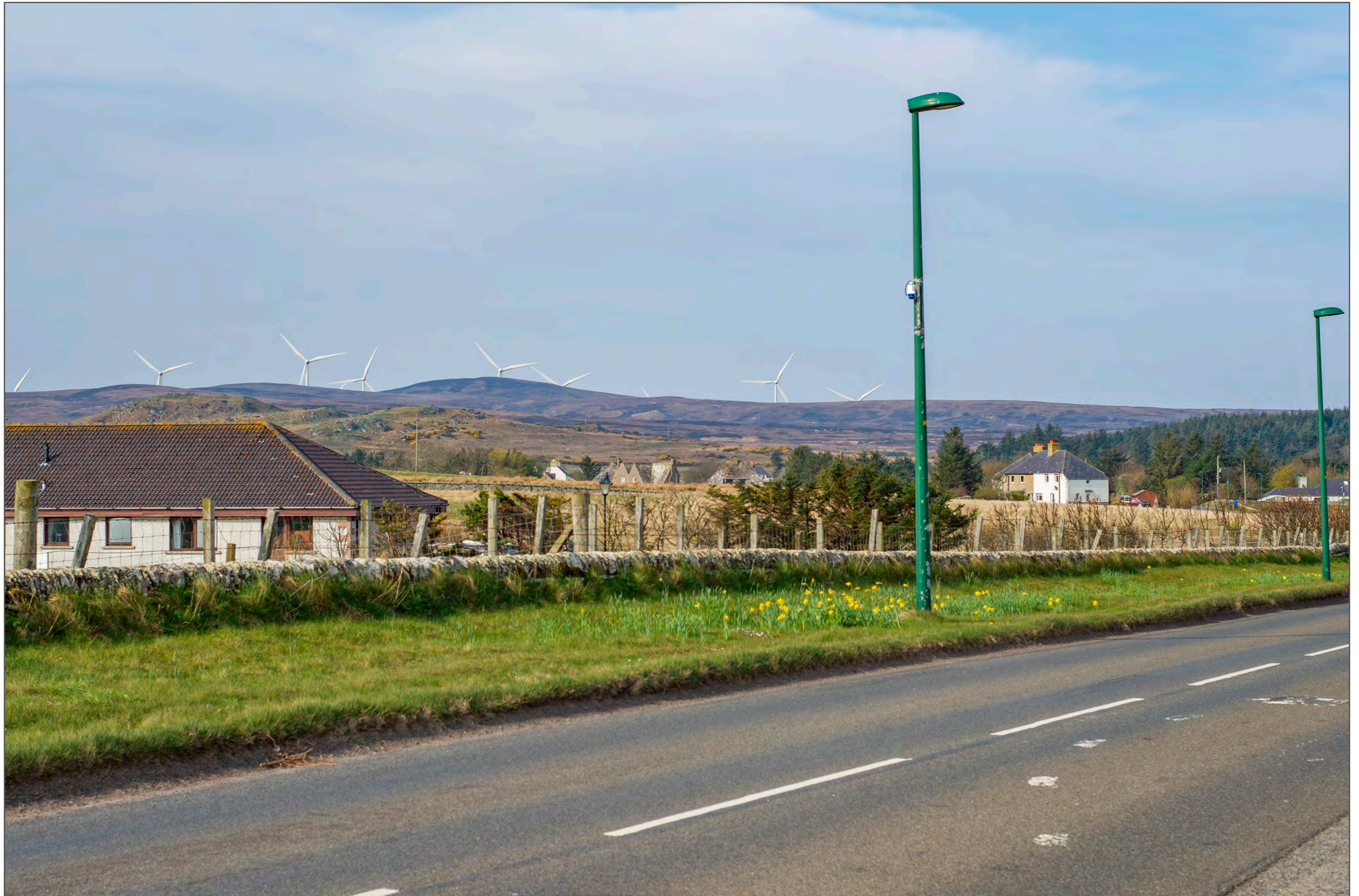
Viewpoint 3 (Figure 6.14k)