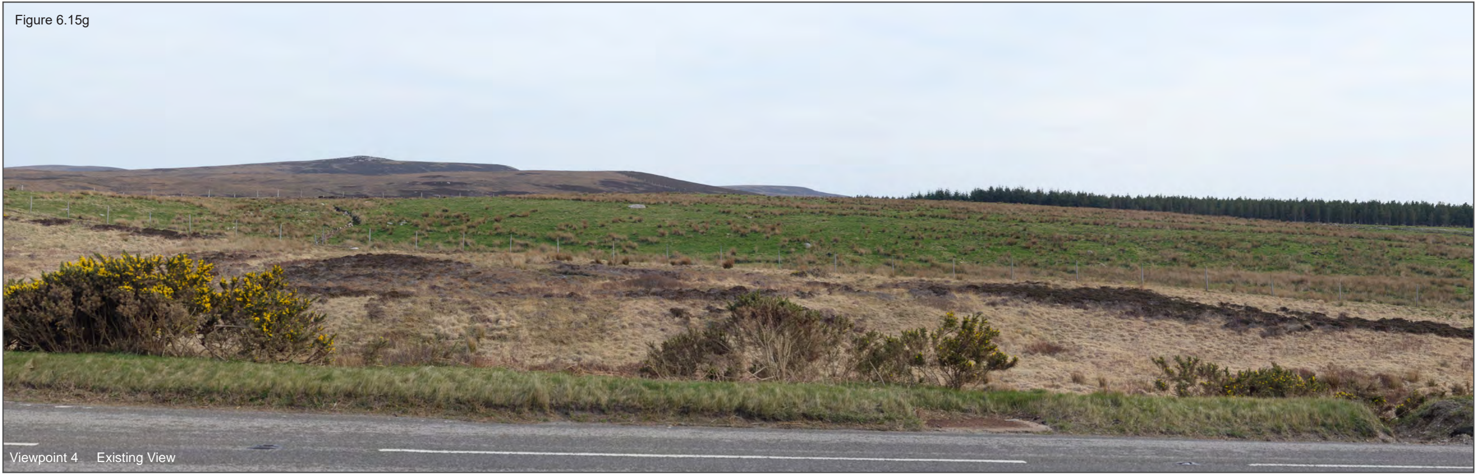
Viewpoint 4 Existing View