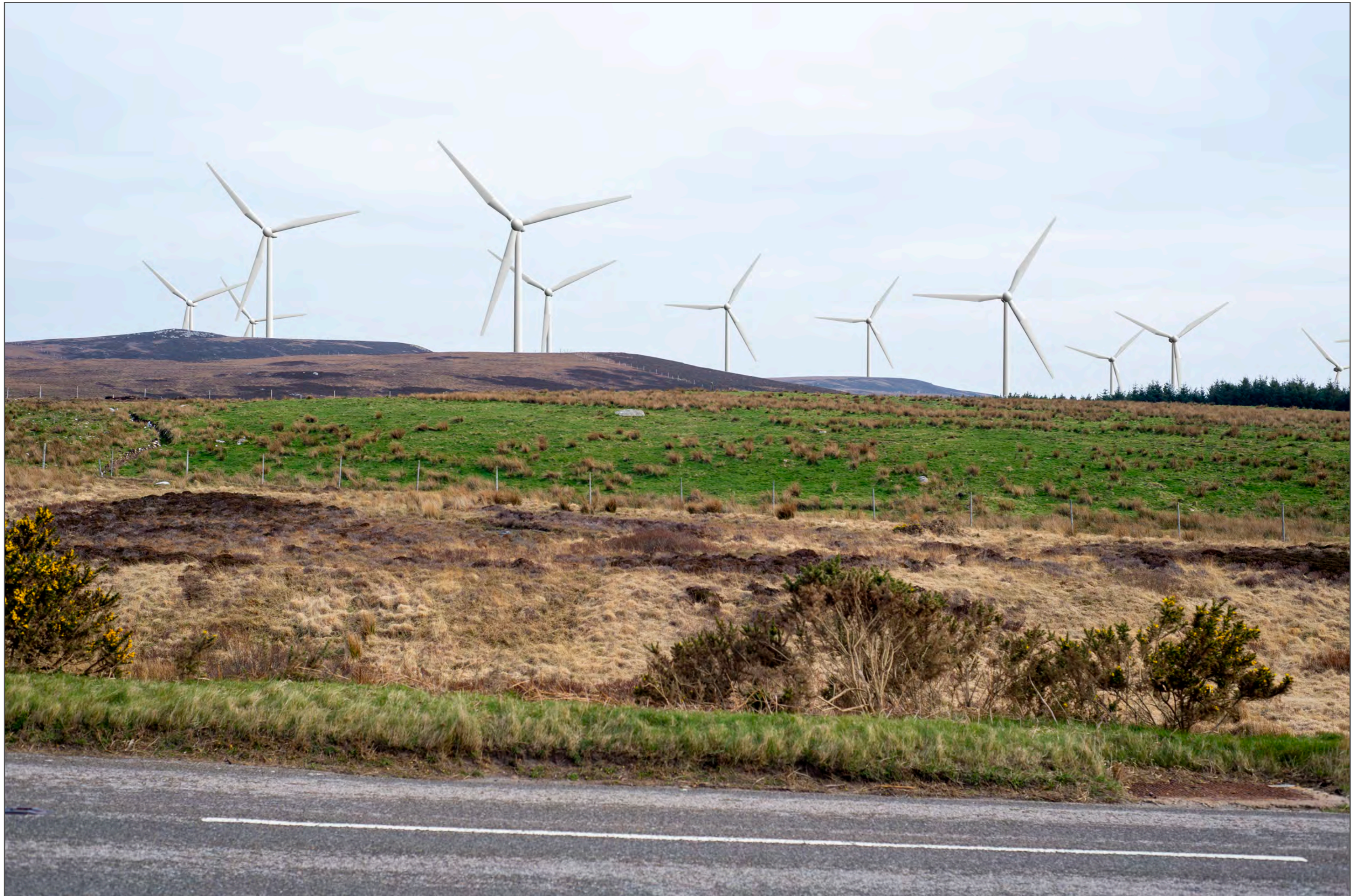
Viewpoint 4 (Figure 6.15h)