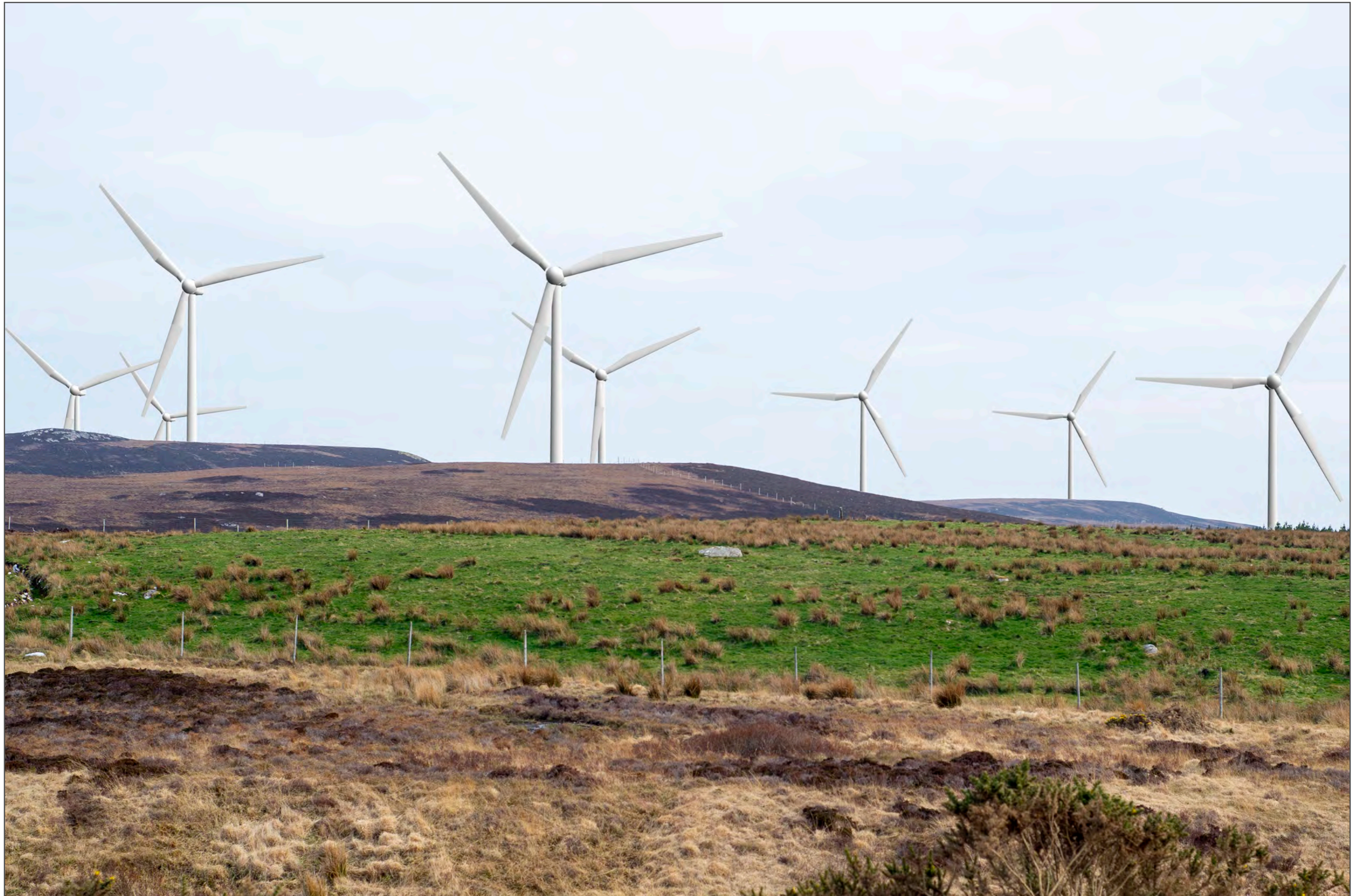
Viewpoint 4 (Figure 6.15i)