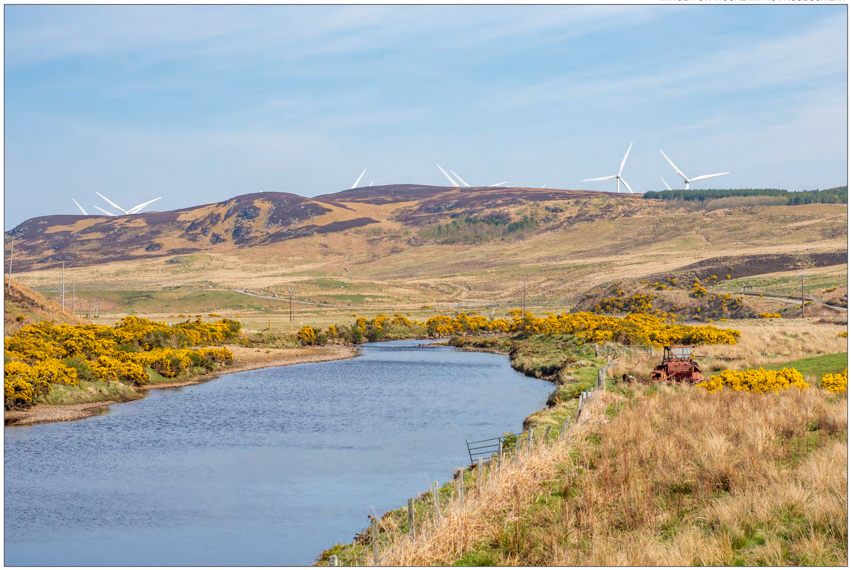
Viewpoint 8 (Figure 6.19\) Strath Halladale, Calgarry