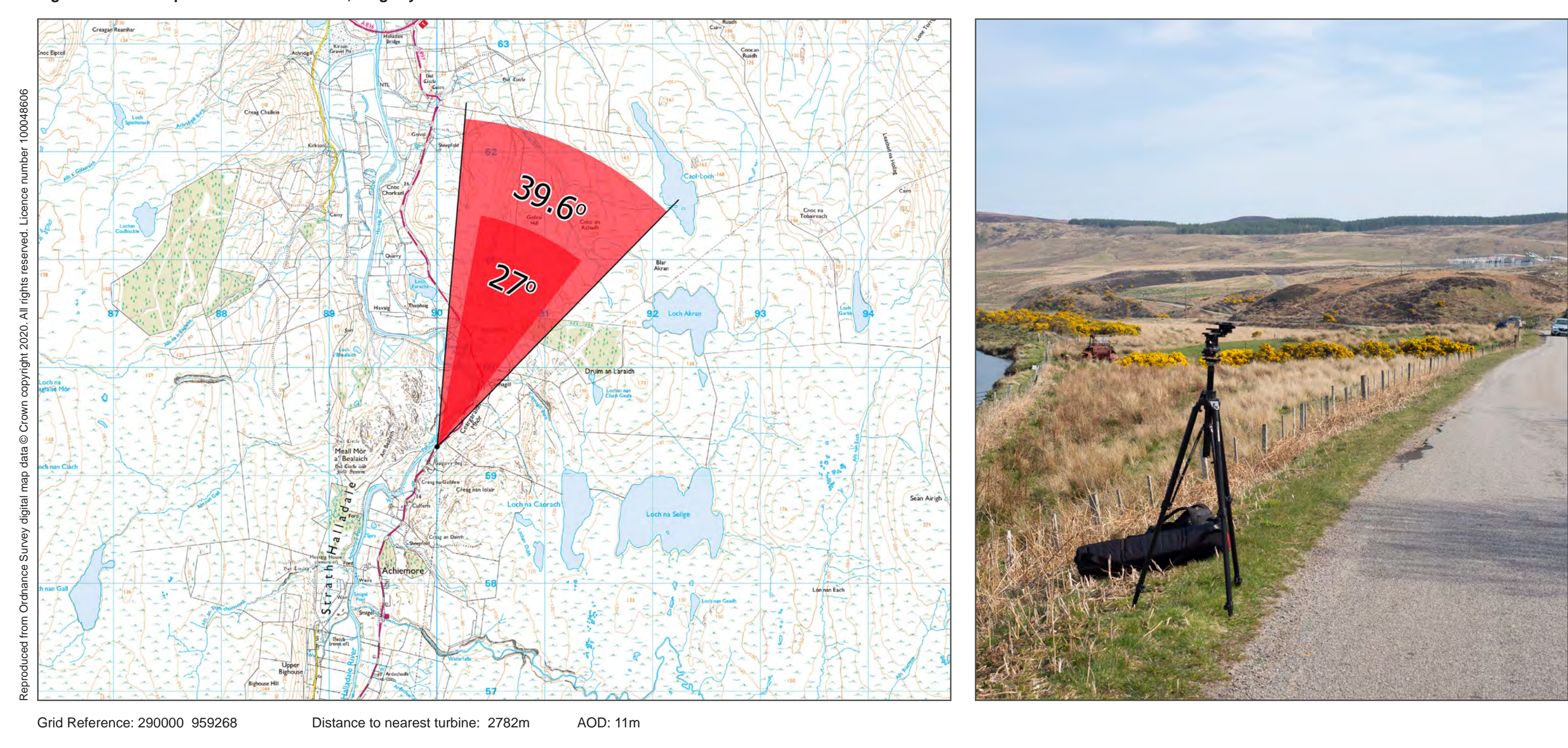
Figure 6.19X - Viewpoint 8: Strath Halladale, Calgarry.

This viewpoint is located on the A897 at Strath Halladale.