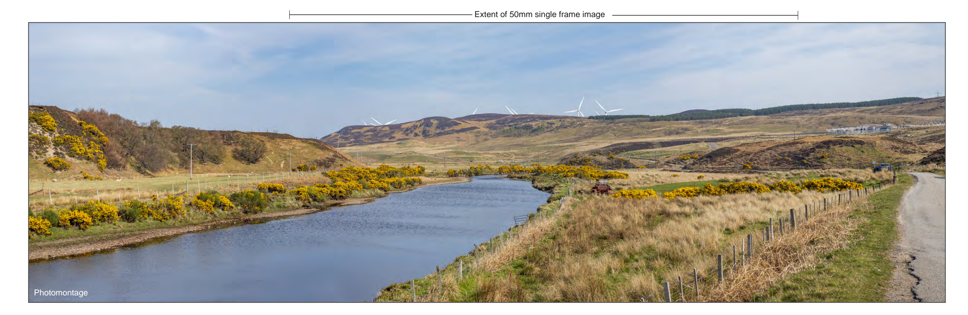
Figure 6.19Y Viewpoint 8 Strath Halladale, Calgarry