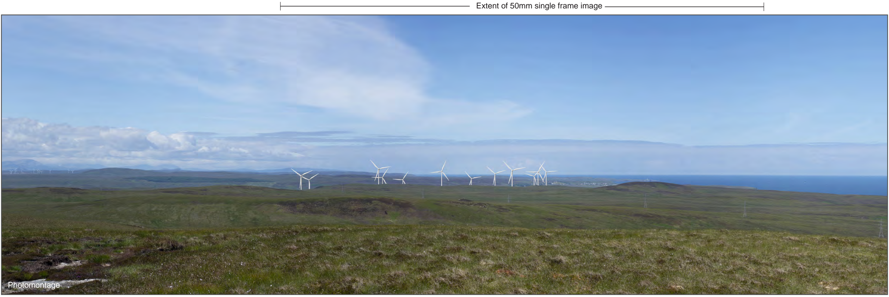
Figure 6.20h Viewpoint 9 Summit of Beinn Ratha