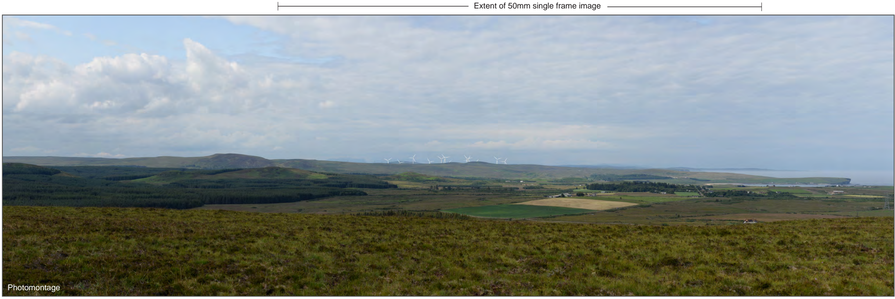
Figure 6.21h Viewpoint 10 Hill of Shebster

Distance to nearest turbine: 9179m Camera: Nikon D610