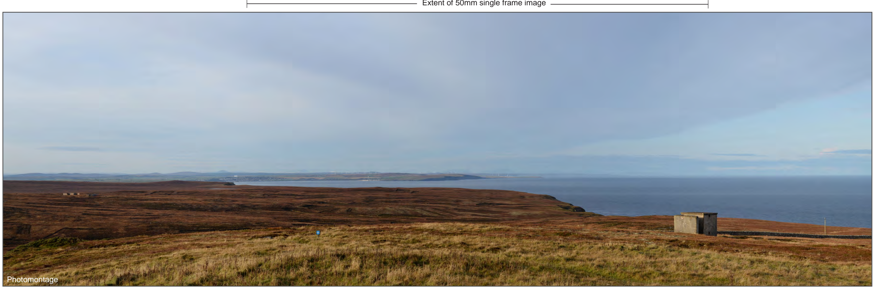
Figure 6.22h Viewpoint 11 Dunnet Head