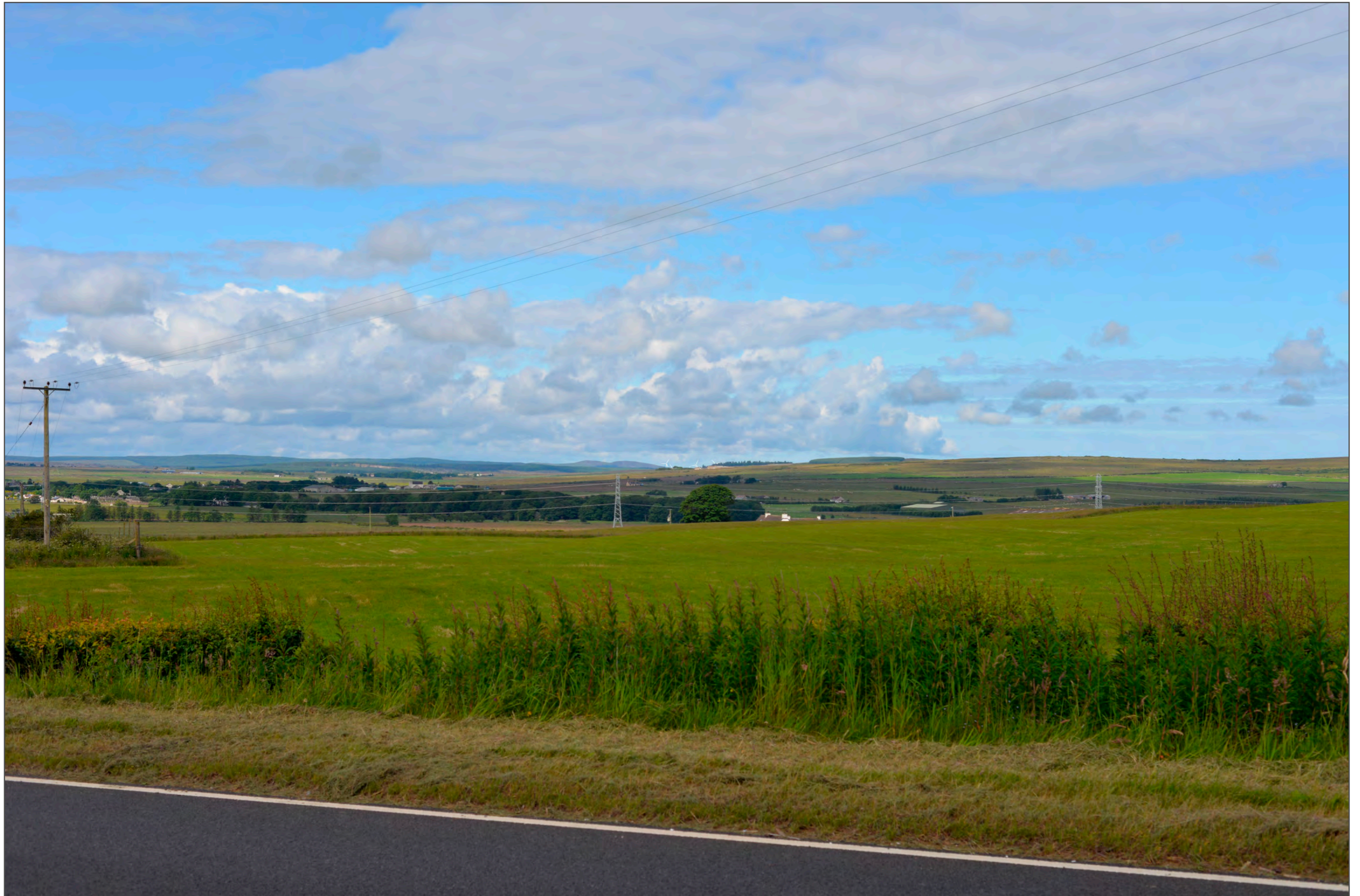
Viewpoint 12 (Figure 6.23j) A9 A822 Junction, Georgemas

This image should be viewed at a comfortable arms length (approx. 500mm)