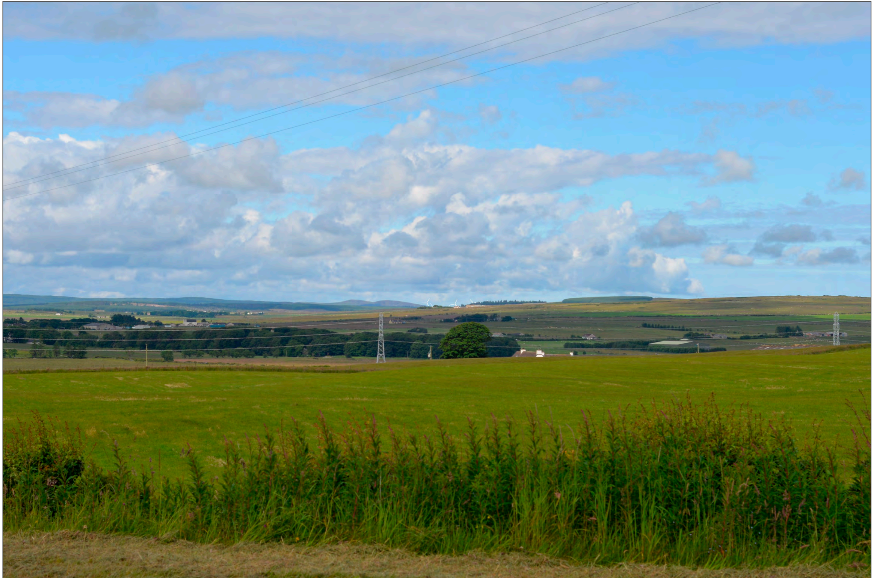
Viewpoint 12 (Figure 6.23k) A9 A822 Junction, Georgemas

This image should be viewed at a comfortable arms length (approx. 500mm)