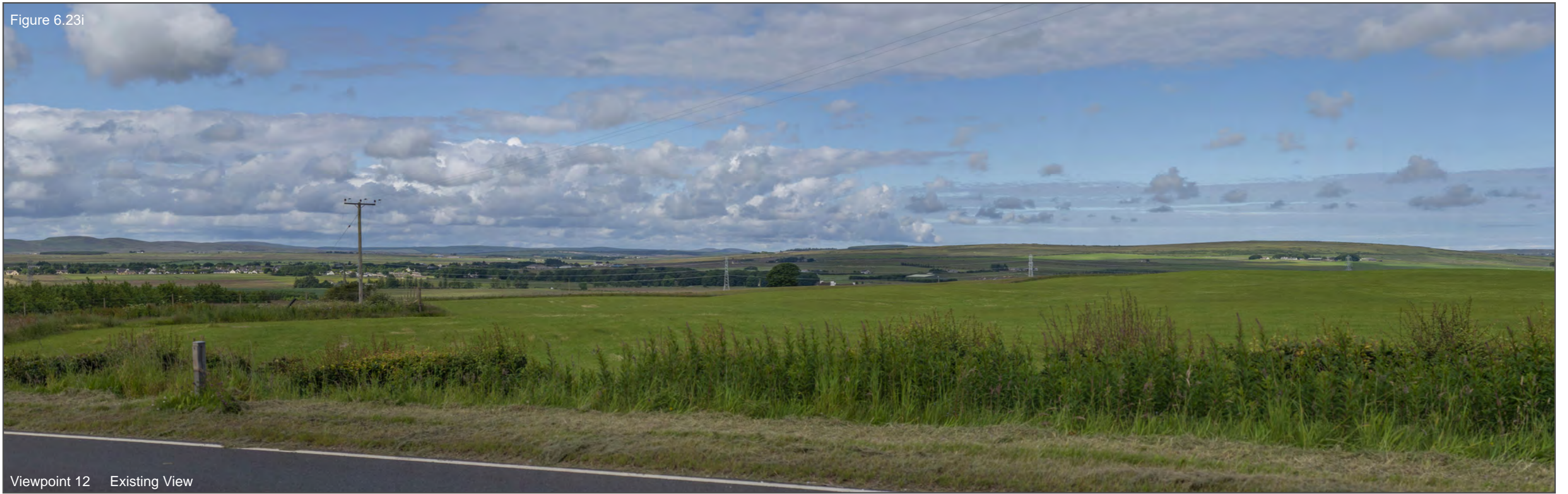
Viewpoint 12 Existing View