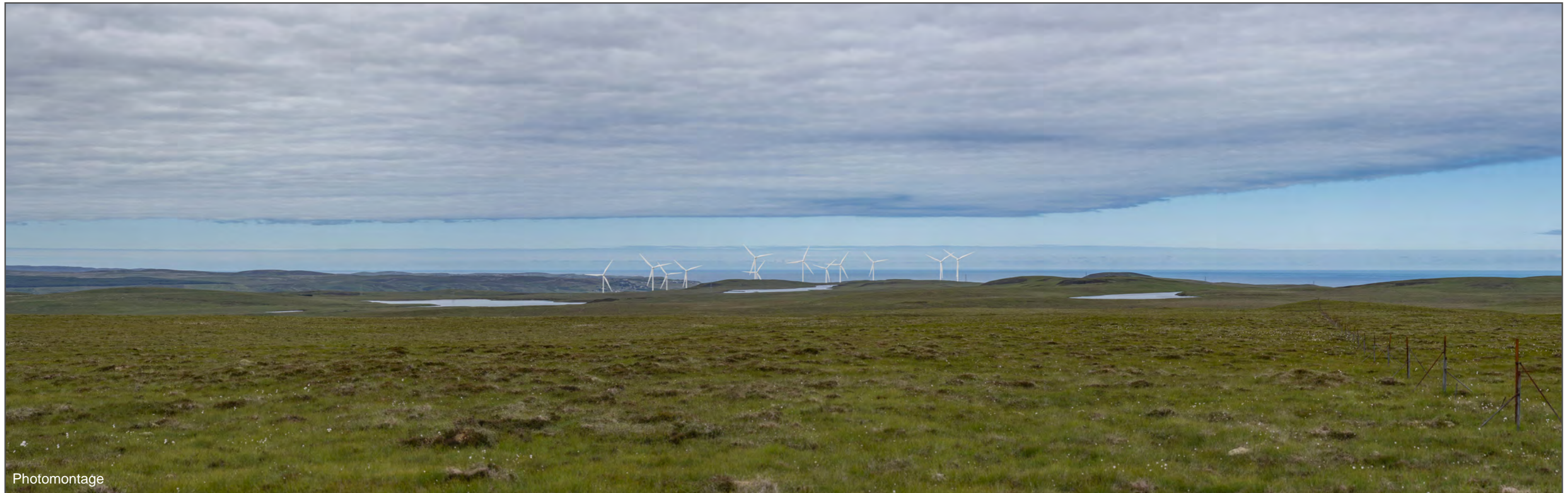
Figure 6.1 $h Viewpoint 5 Sean Airigh - Wild Land Area

Distance to nearest turbine: 4258m Camera: Nikon D610 Focal Length: 50mm vertical (27°) x 28mm horizontal (65.5°) Camera height: 1.5m Date: 08/07/2020 13:13