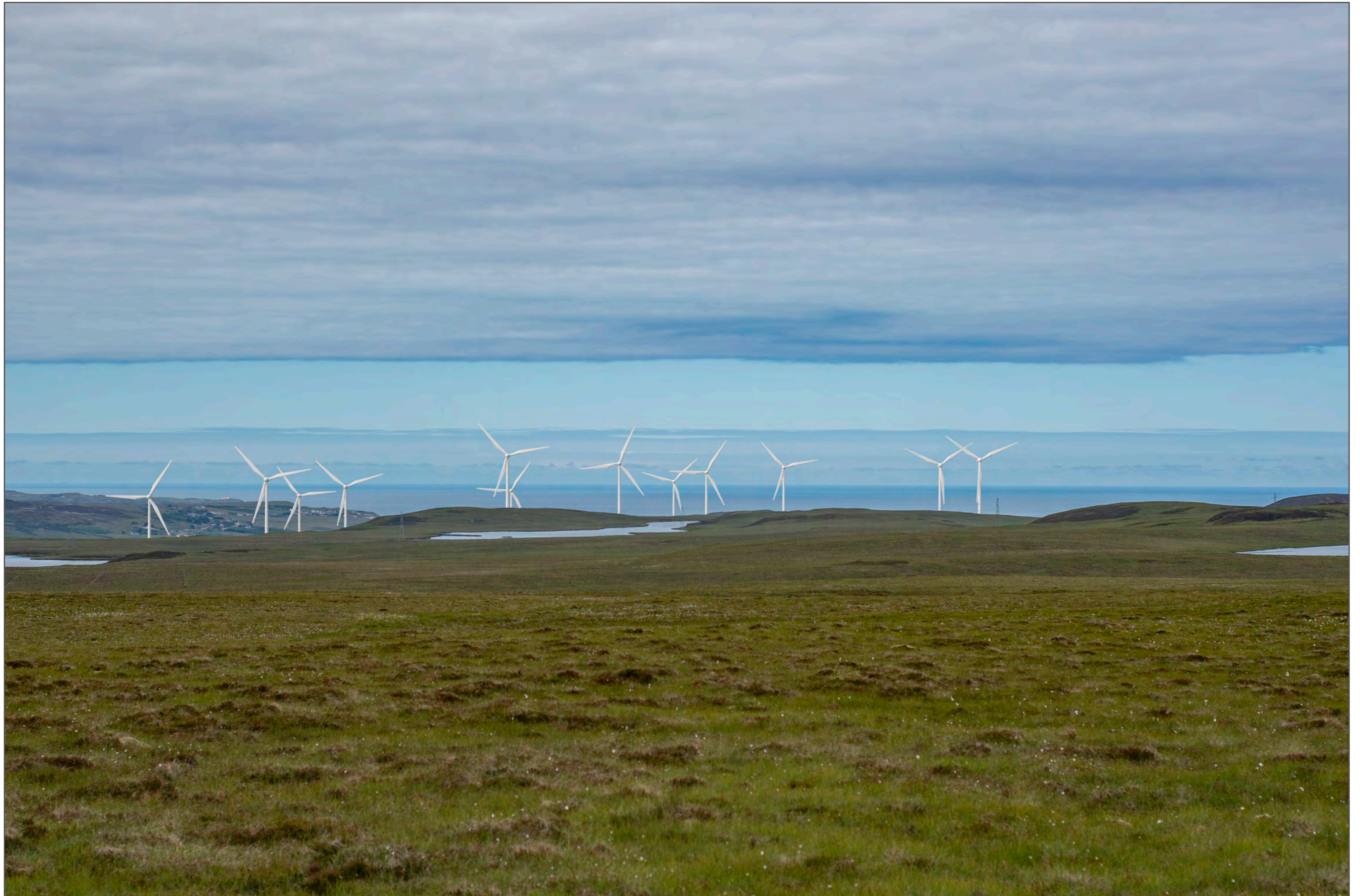
Viewpoint 5 (Figure 6.' $k) Sean Airigh - Wild Land Area