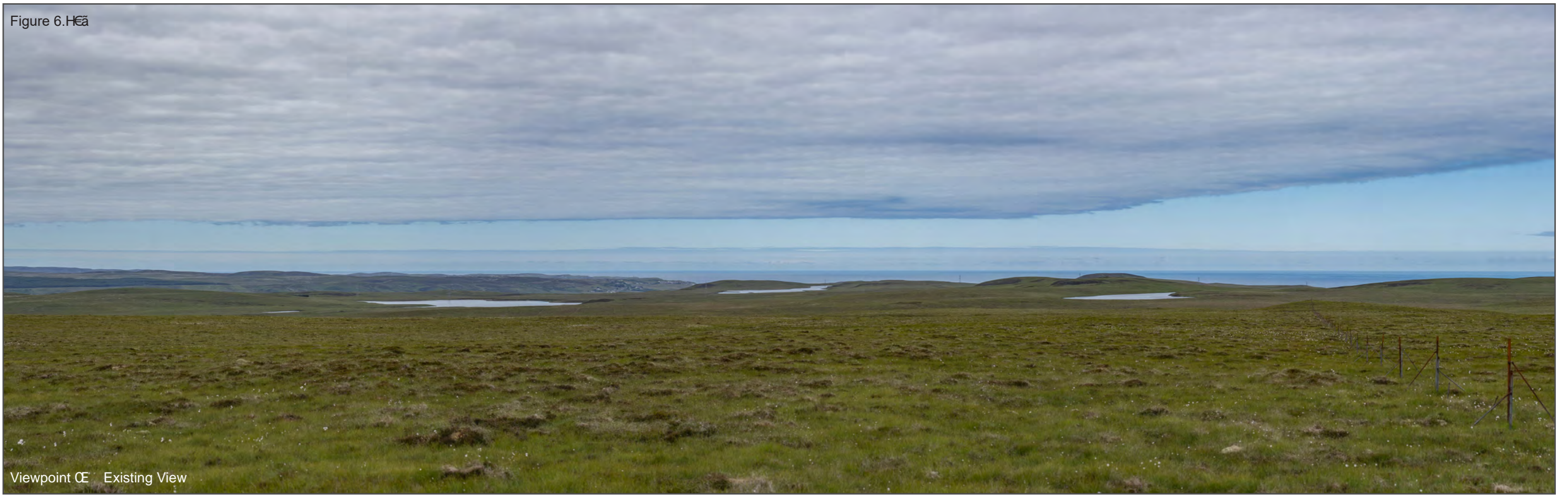
Viewpoint 0E Existing View