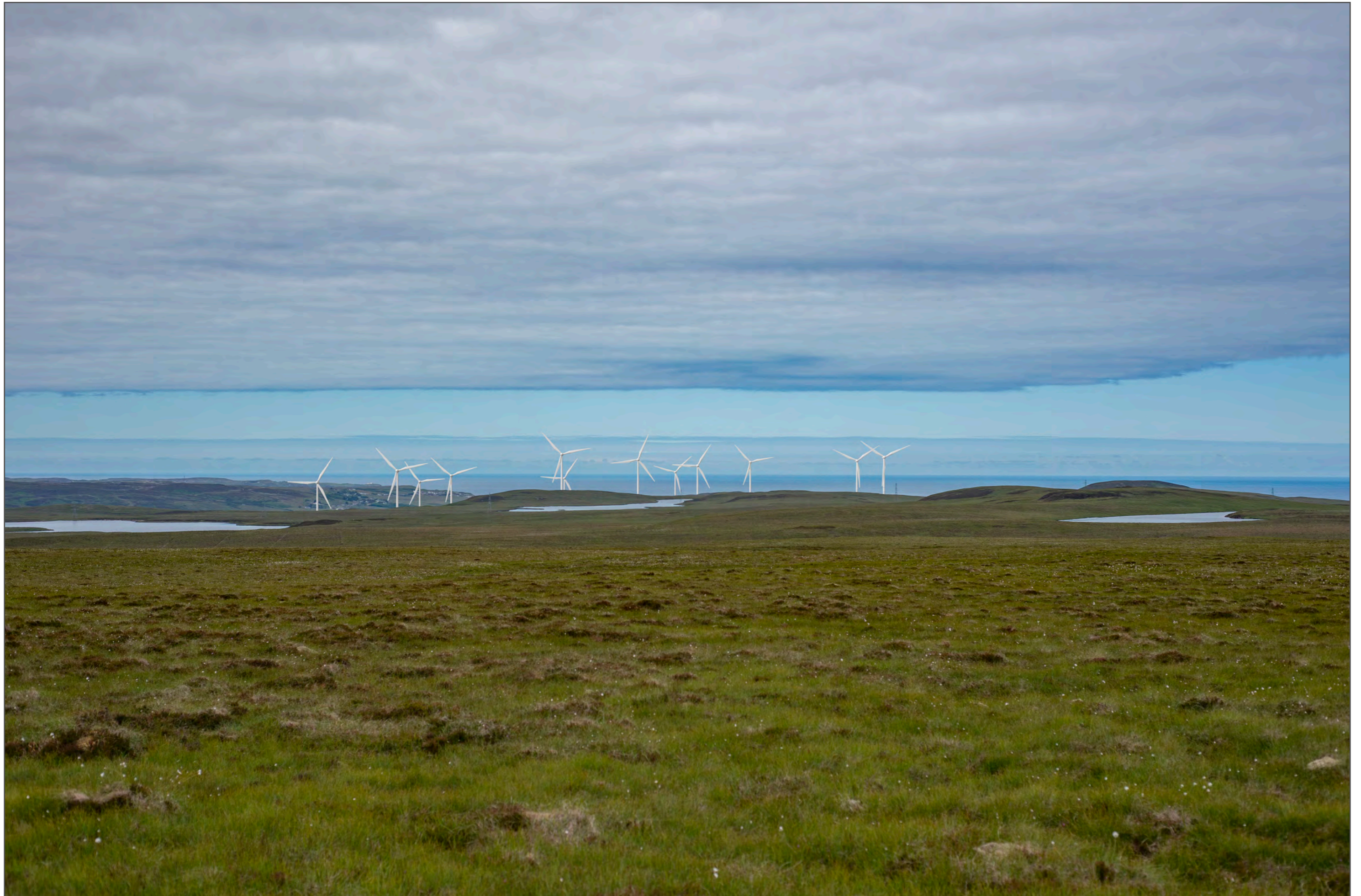
Viewpoint 5 (Figure 6. $j) Sean Airigh - Wild Land Area