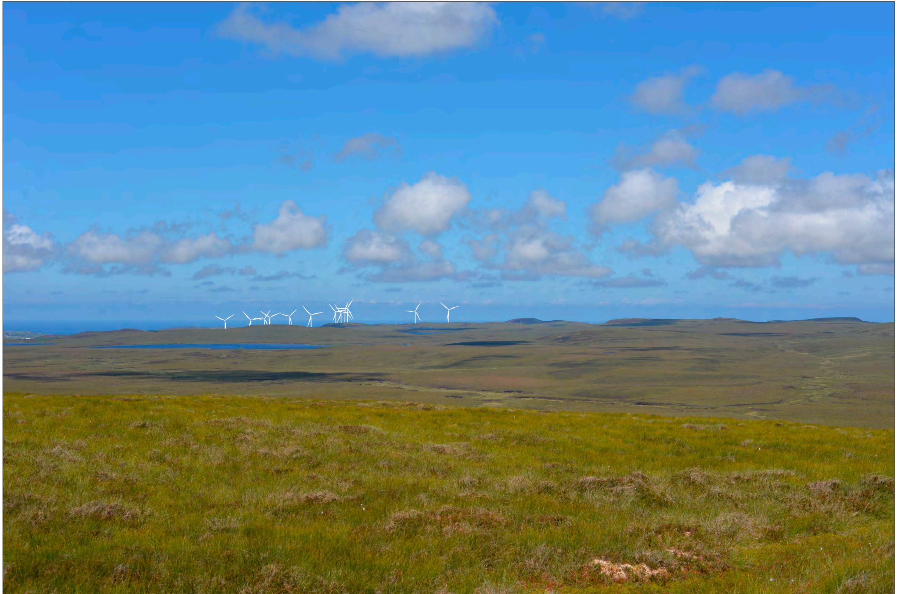
Viewpoint 6 (Figure 6.1) Cnoc Bad Mhairtein - Wild Land Area

Distance to nearest turbine: 6948m Camera: Nikon D610 Focal Length: 50mm Camera height: 1.5m Date: 11/07/2017 12:28