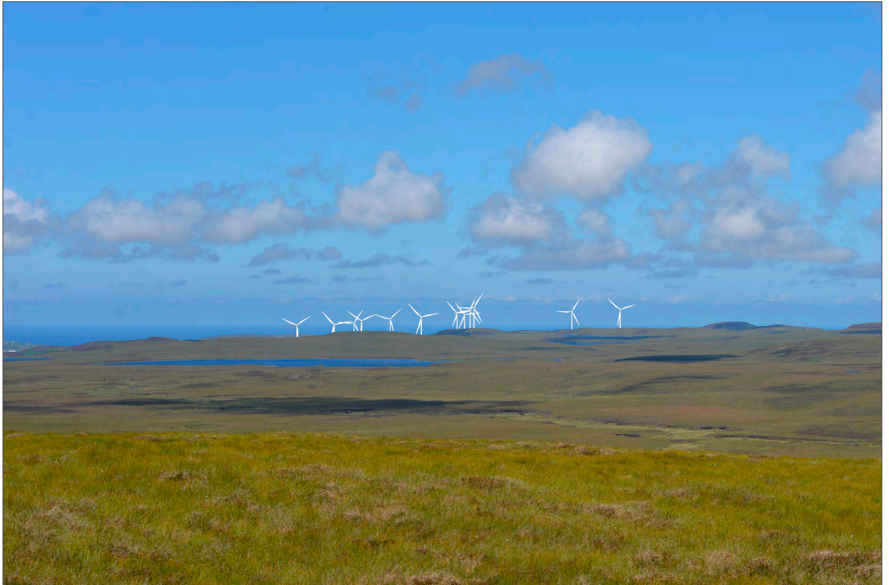
Viewpoint 6 (Figure 6.1) Cnoc Bad Mhairtein - Wild Land Area

Distance to nearest turbine: 6948m Camera: Nikon D610 Focal Length: 75mm Camera height: 1.5m Date: 11/07/2017 12:28