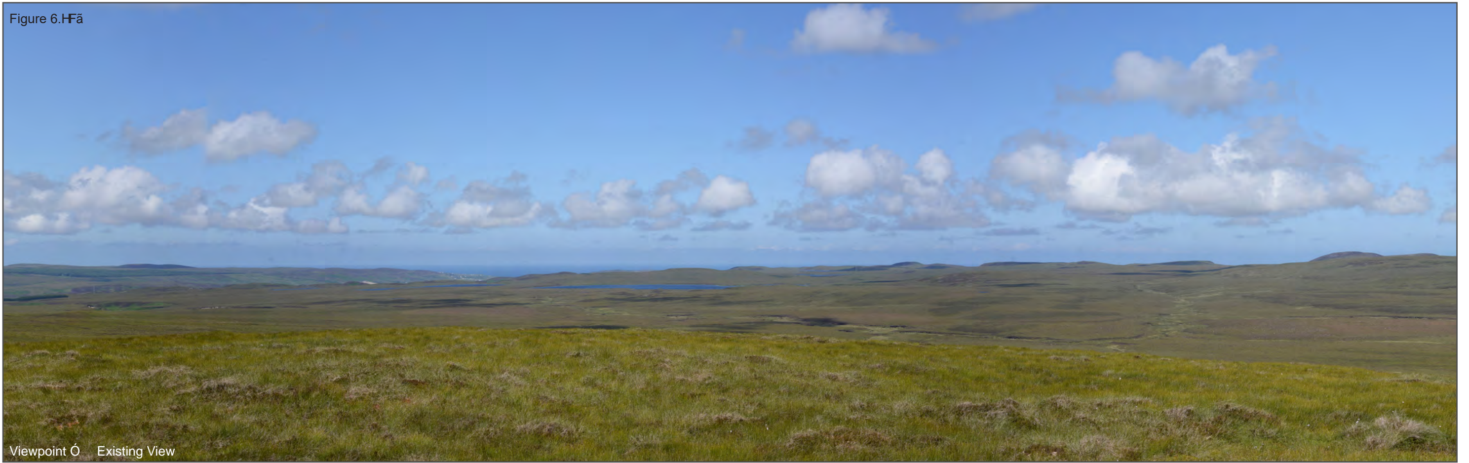
Viewpoint Ó Existing View