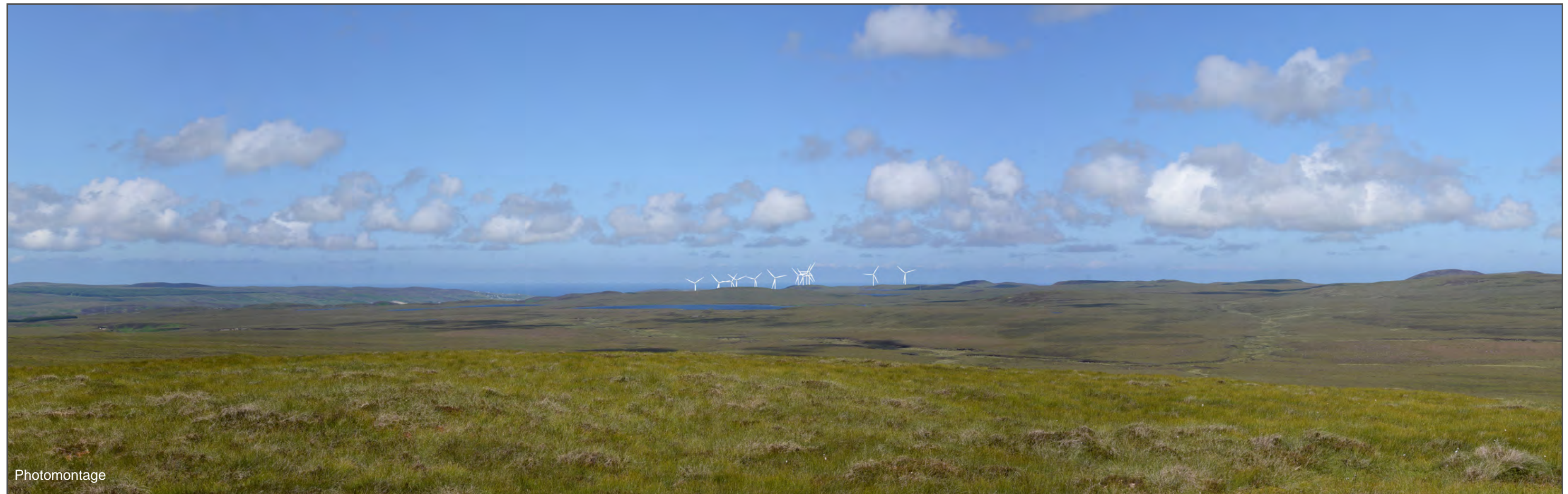
Figure 6.1 Viewpoint 6 Cnoc Bad Mhairtein - Wild Land Area

Distance to nearest turbine: 6948m Camera: Nikon D610 Focal Length: 50mm vertical (27°) x 28mm horizontal (65.5°) Camera height: 1.5m Date: 11/07/2017 12:28