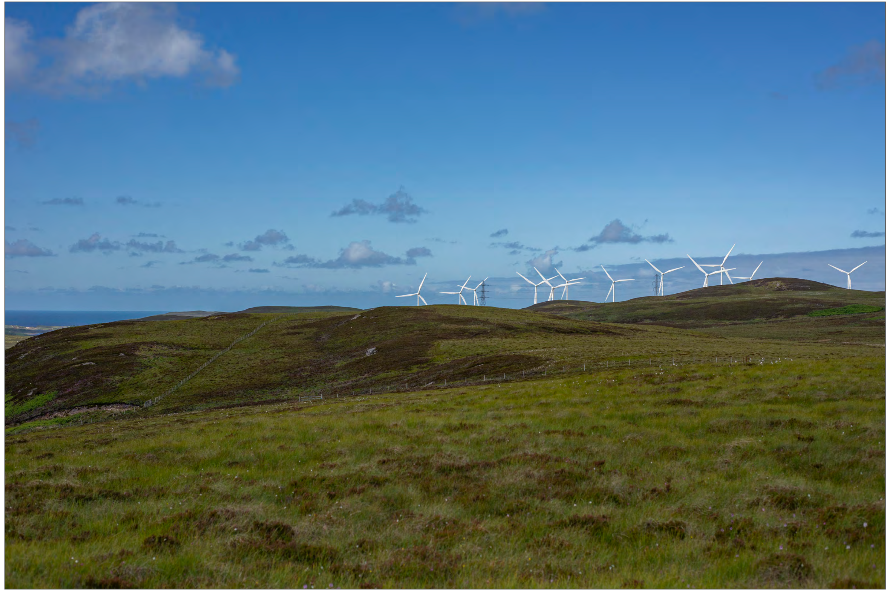
Viewpoint 7 (Figure 6.' &j) @cW'bU'7UcfUW - Wild Land Area