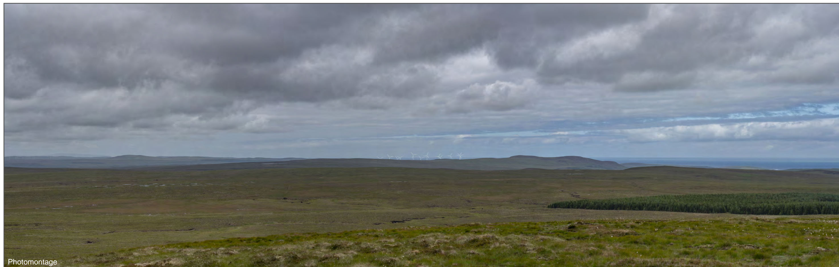
Figure 6.3' h Viewpoint 8 Beinn nam Bad Mor - Wild Land Area

Distance to nearest turbine: 10568m Camera: Nikon D610 Focal Length: 50mm vertical (27°) x 28mm horizontal (65.5°) Camera height: 1.5m Date: 07/07/2020 12:31