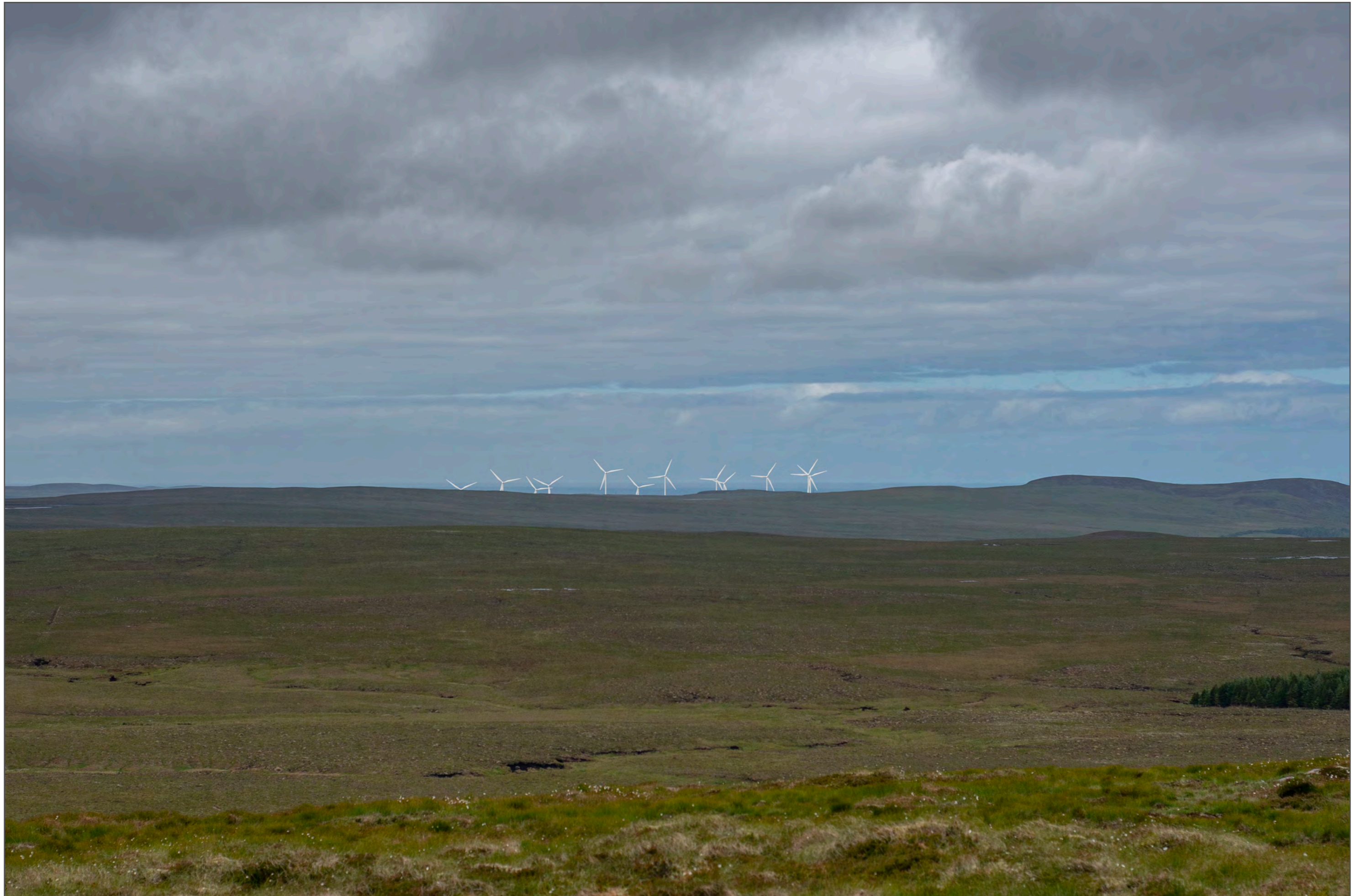
Viewpoint 8 (Figure 6.3' k) Beinn nam Bad Mor - Wild Land Area

Distance to nearest turbine: 10568m Camera: Nikon D610 Focal Length: 75mm Camera height: 1.5m Date: 07/07/2020 12:31