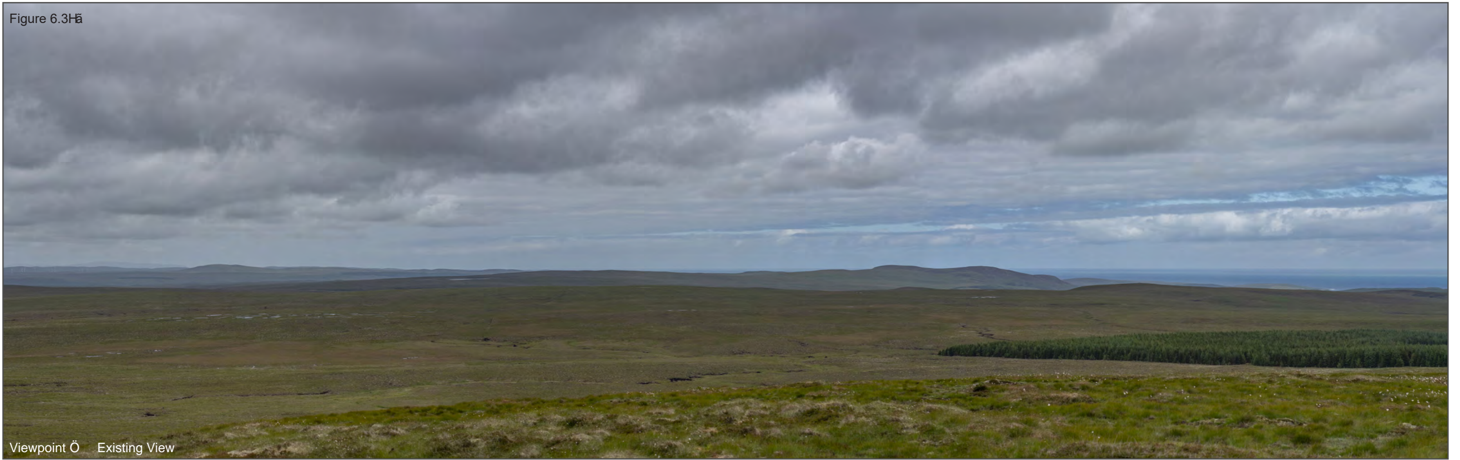
Viewpoint Ö Existing View