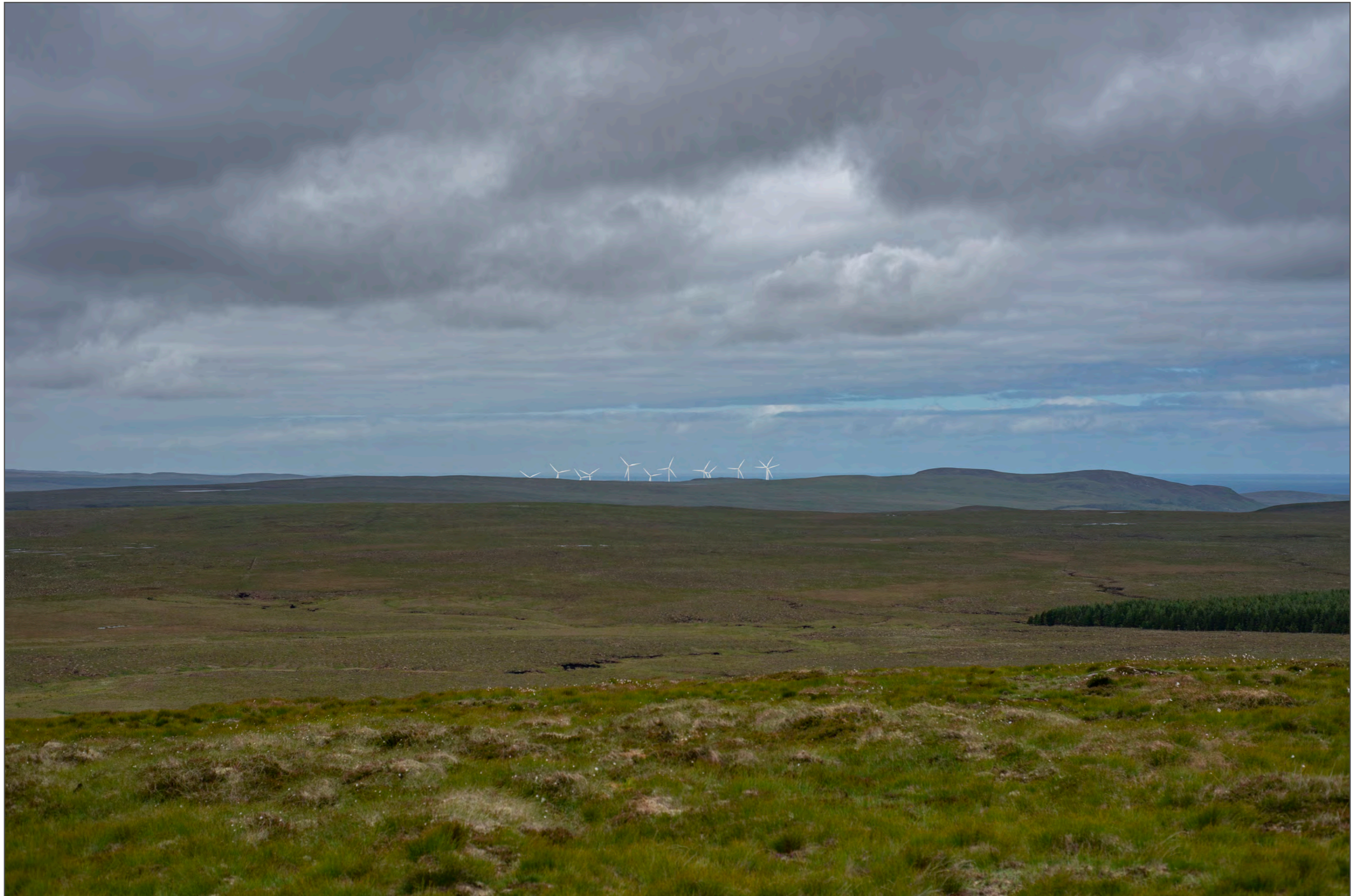
Viewpoint 8 (Figure 6.3' j) Beinn nam Bad Mor - Wild Land Area

Distance to nearest turbine: 10568m Camera: Nikon D610 Focal Length: 50mm Camera height: 1.5m Date: 07/07/2020 12:31