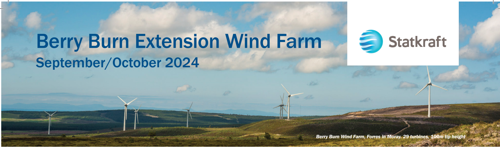
Berry Burn Wind Farm, Forres in Moray. 29 turbines, 100m tip height