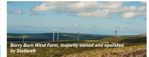
Berry Burn Wind Farm, majority owned and operated by Statkraft

Drop in between 11am – 12pm, Thursday 21 November, Edinkillie Community Hall