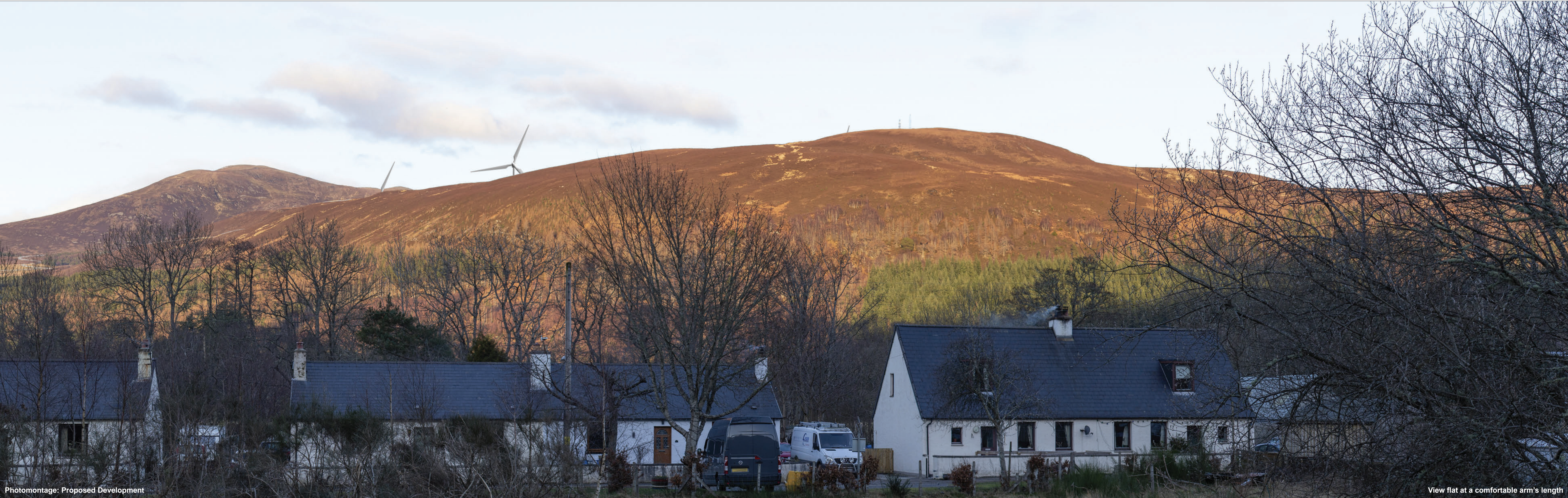
Photomontage: Proposed Development