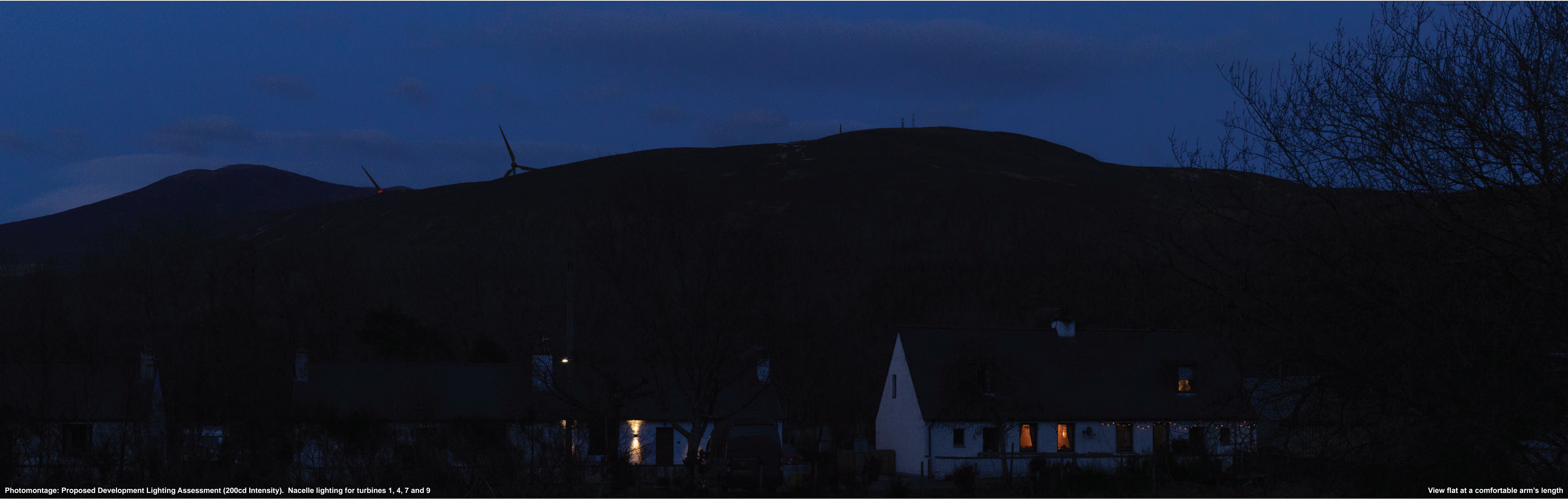
Photomontage: Proposed Development Lighting Assessment (200cd Intensity). Nacelle lighting for turbines 1, 4, 7 and 9