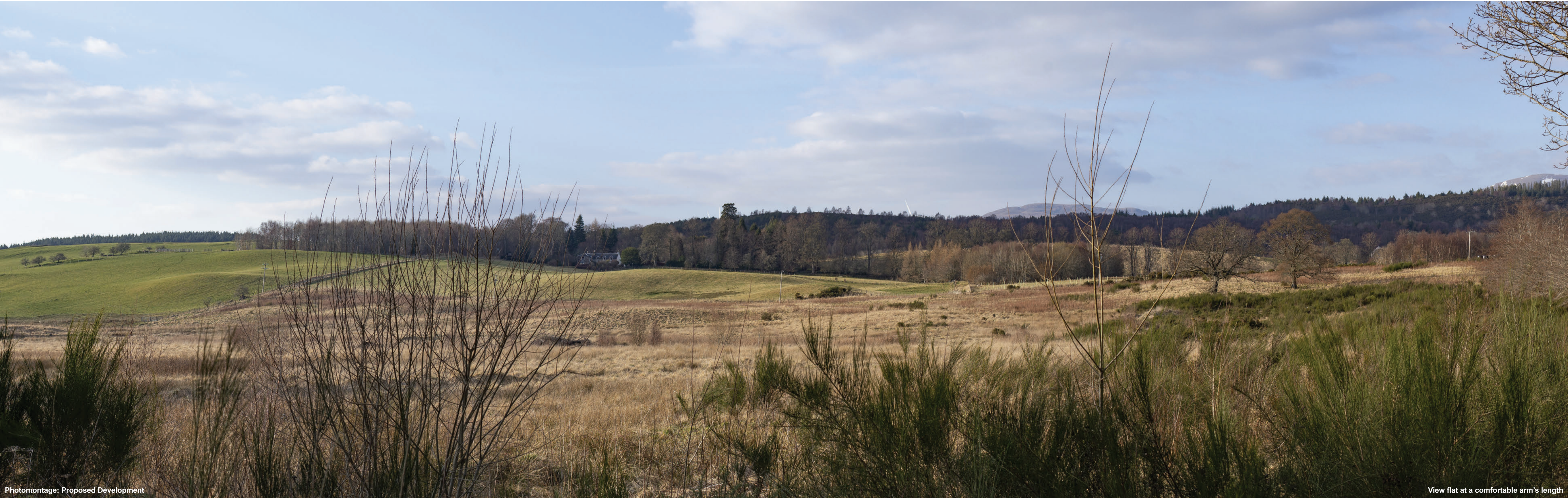
Photomontage: Proposed Development