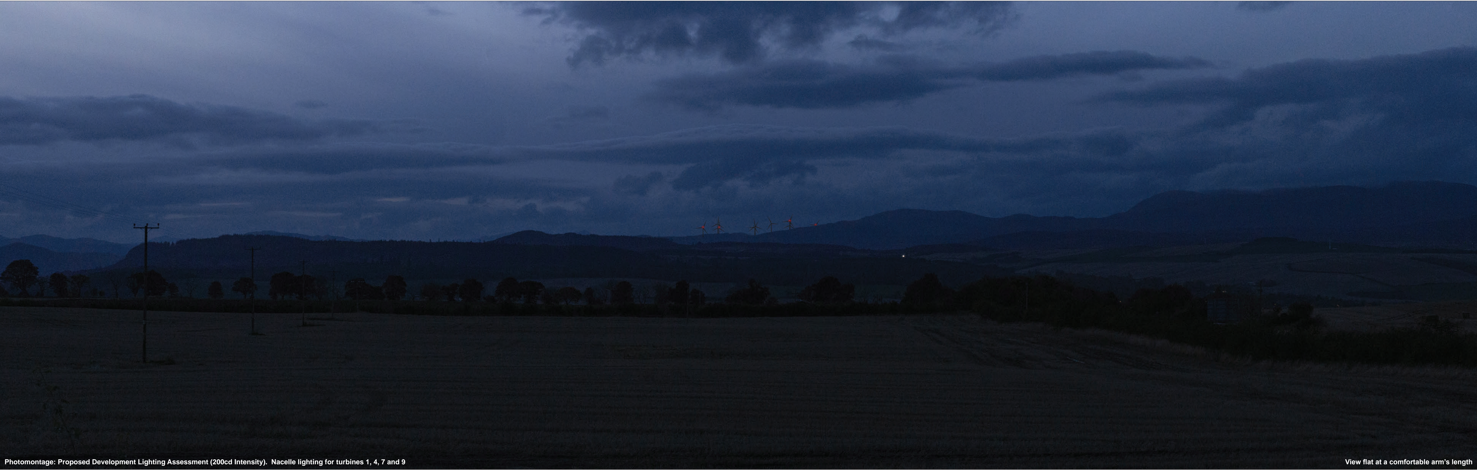
Photomontage: Proposed Development Lighting Assessment (200cd Intensity). Nacelle lighting for turbines 1, 4, 7 and 9