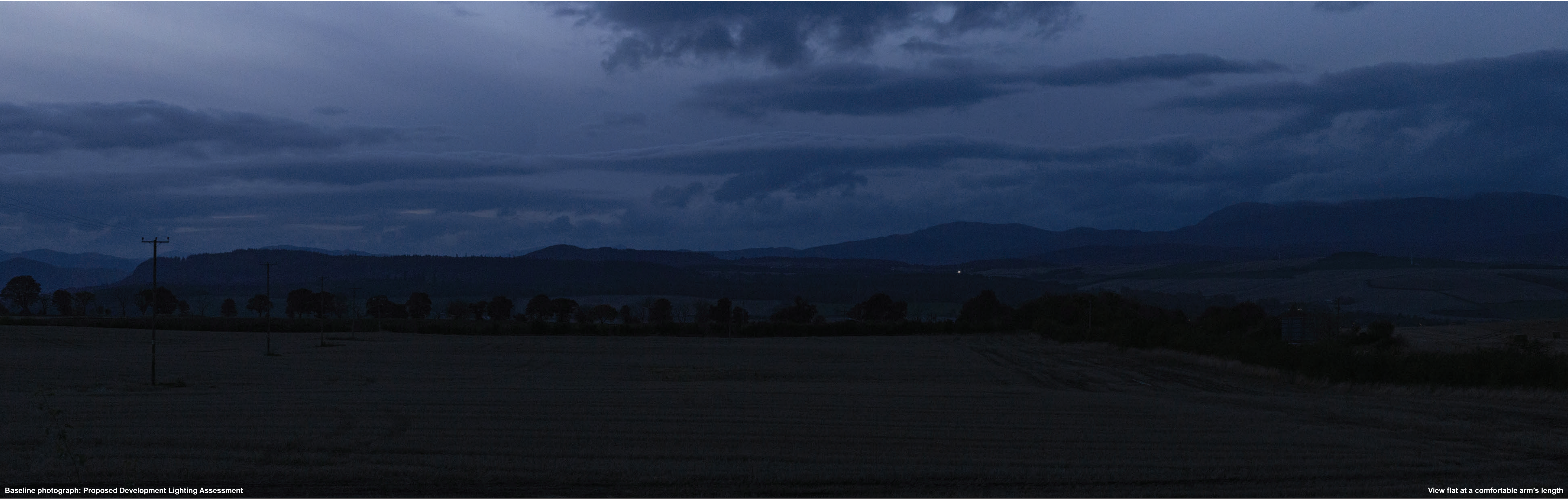
Baseline photograph: Proposed Development Lighting Assessment