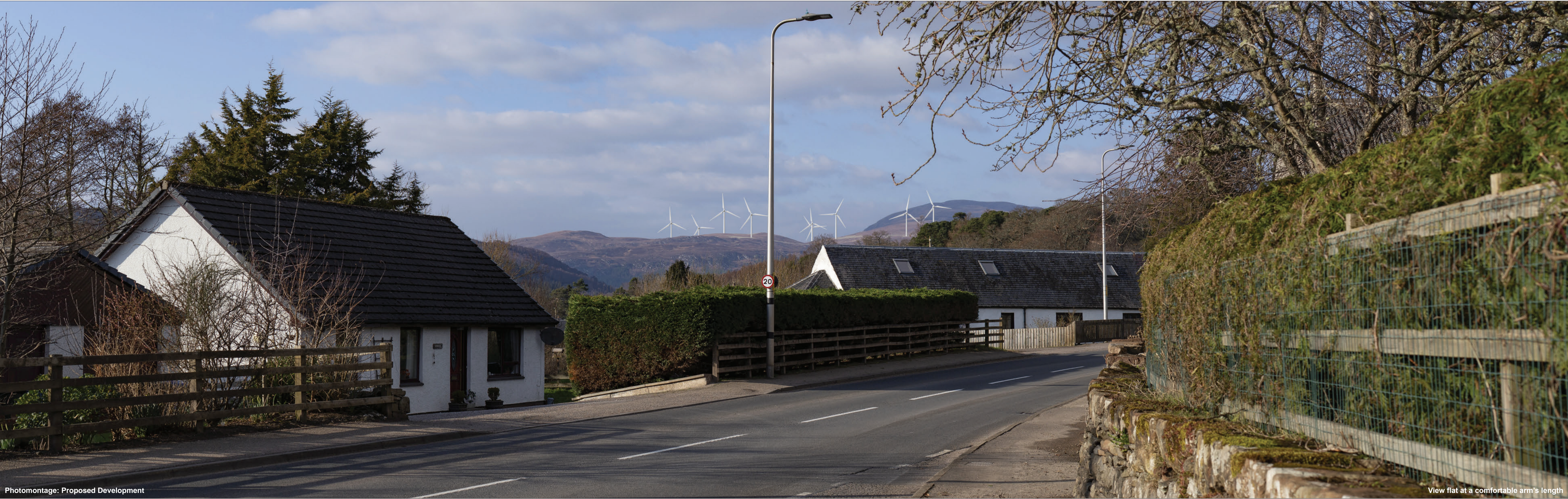
Photomontage: Proposed Development