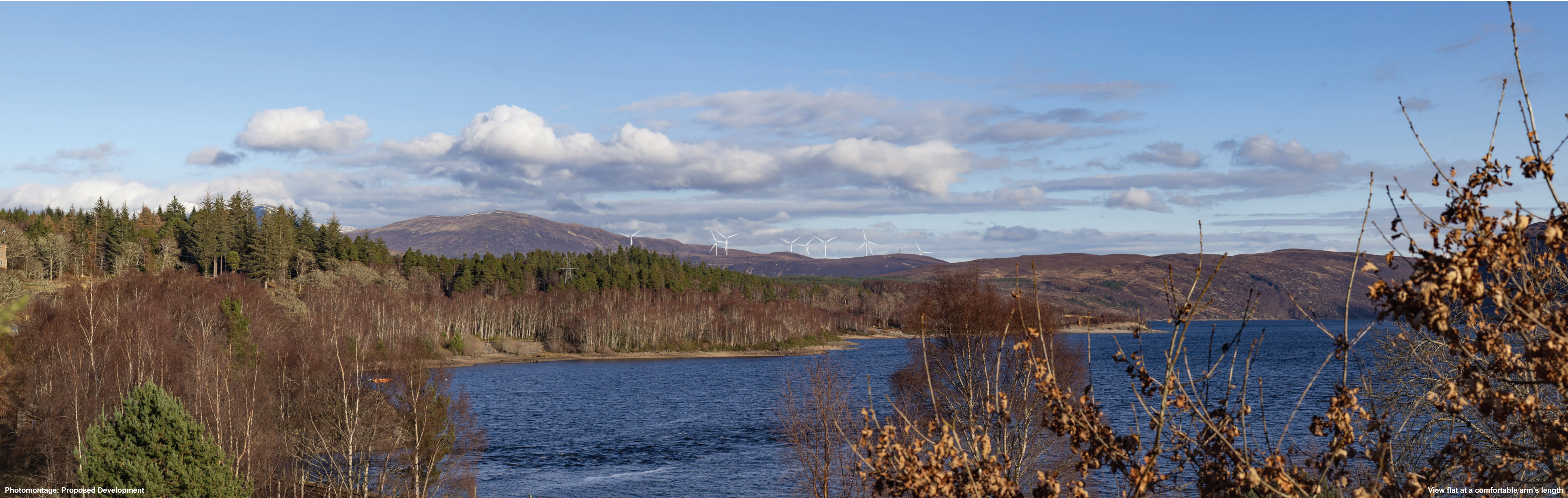
Photomontage: Proposed Development