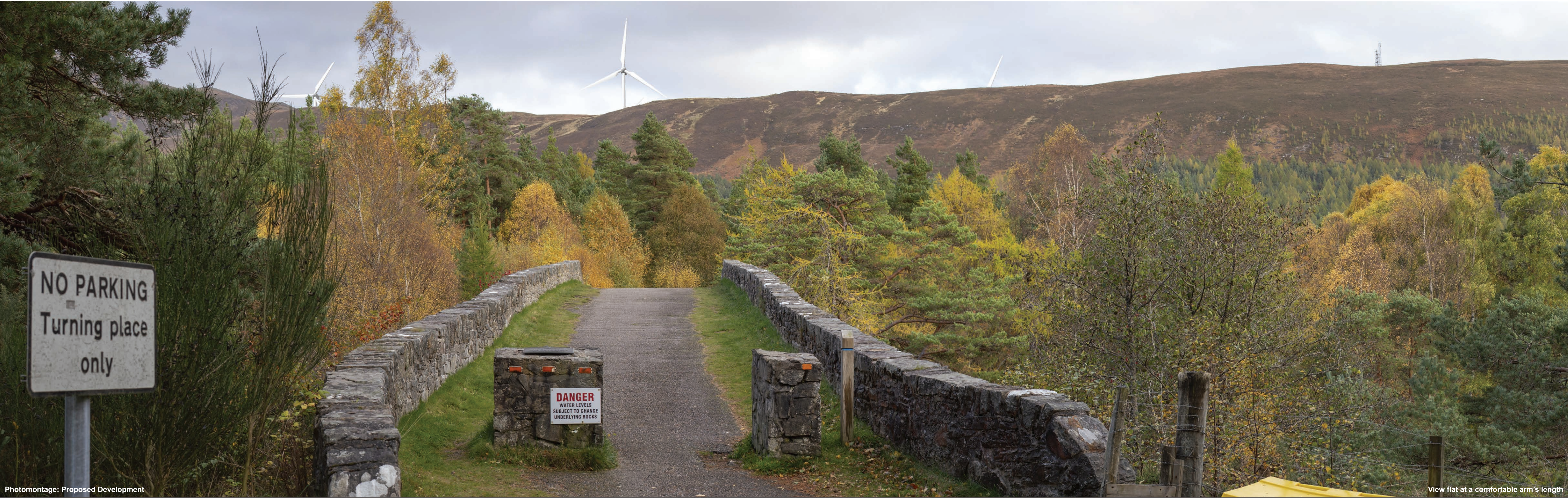
Photomontage: Proposed Development