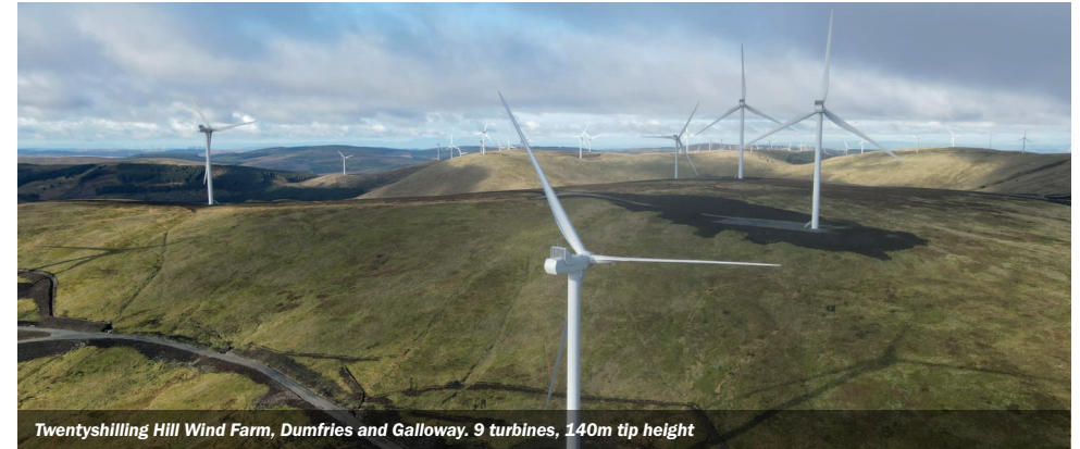
Twentyshilling Hill Wind Farm, Dumfries and Galloway. 9 turbines, 140m tip height

We are writing to you with an update on our proposal for Coille Beith Wind Farm.