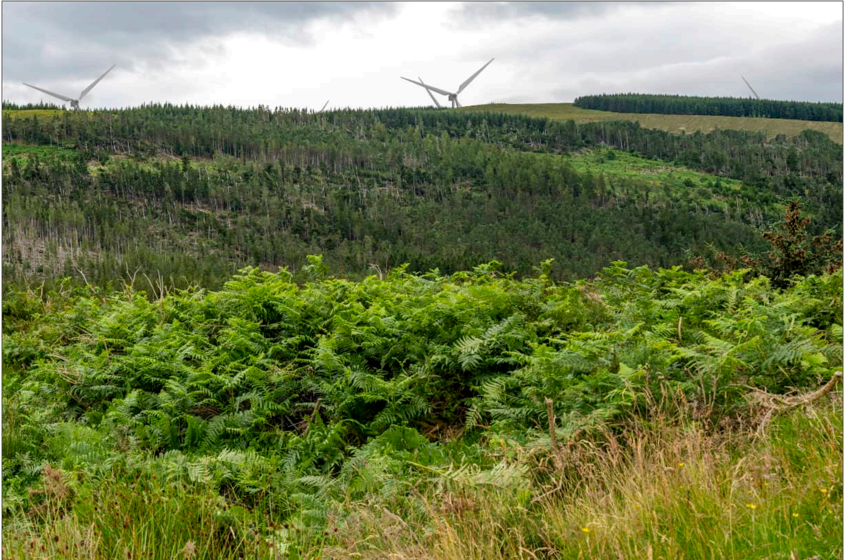
CH Viewpoint 1b (Figure 5.10j) Langwell Dun Scheduled Monument SM5302

This image should be viewed at a comfortable arms length (approx. 500mm)