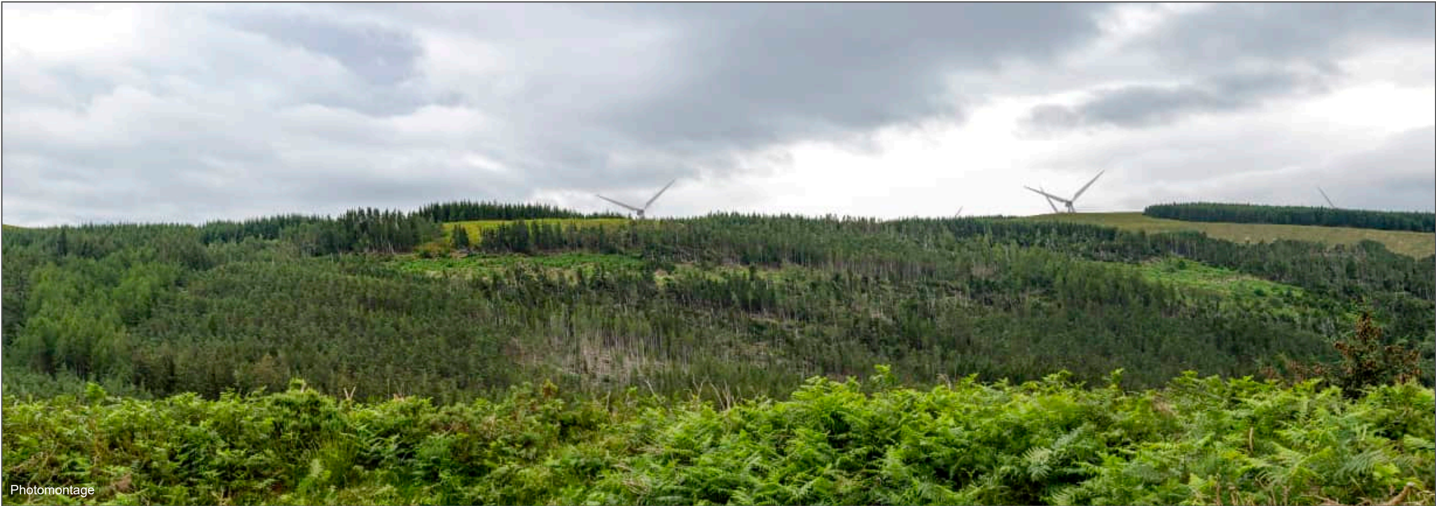
Figure 5.10h CH Viewpoint 1b Langwell Dun Scheduled Monument SM5302

Distance to nearest turbine: 2.17km Camera: Nikon Z6 Focal Length: 50mm vertical (27°) x 28mm horizontal (65.5°) Camera height: 1.5m Date: 17/07/2024 15:12