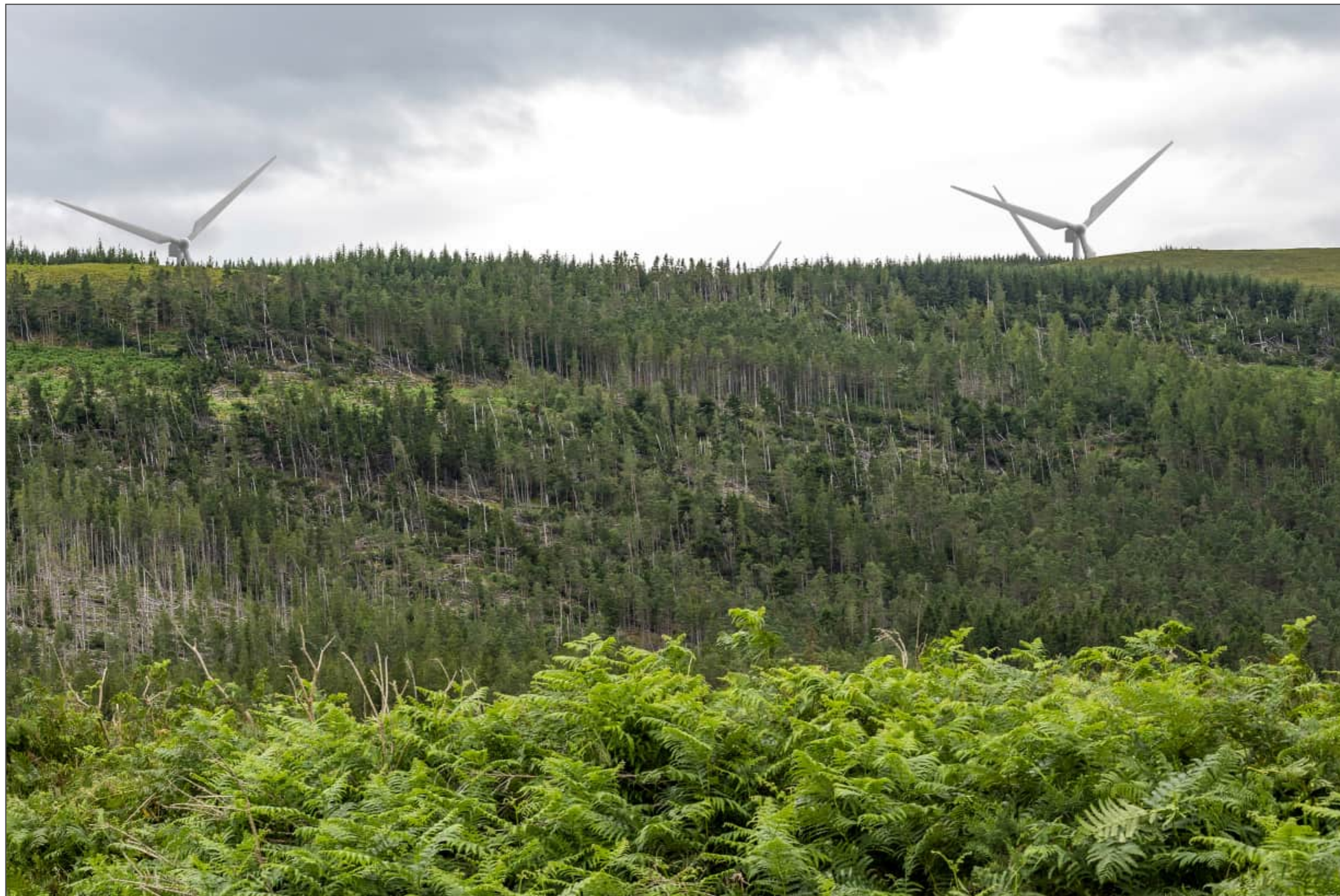
CH Viewpoint 1b (Figure 5.10k) Langwell Dun Scheduled Monument SM5302

This image should be viewed at a comfortable arms length (approx. 500mm)