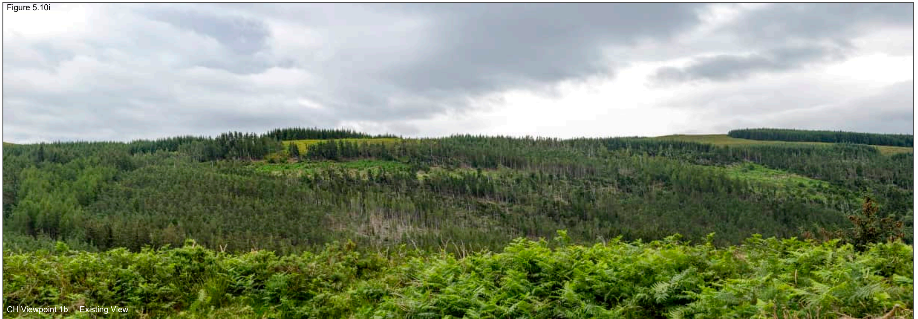
CH Viewpoint 1b Existing View