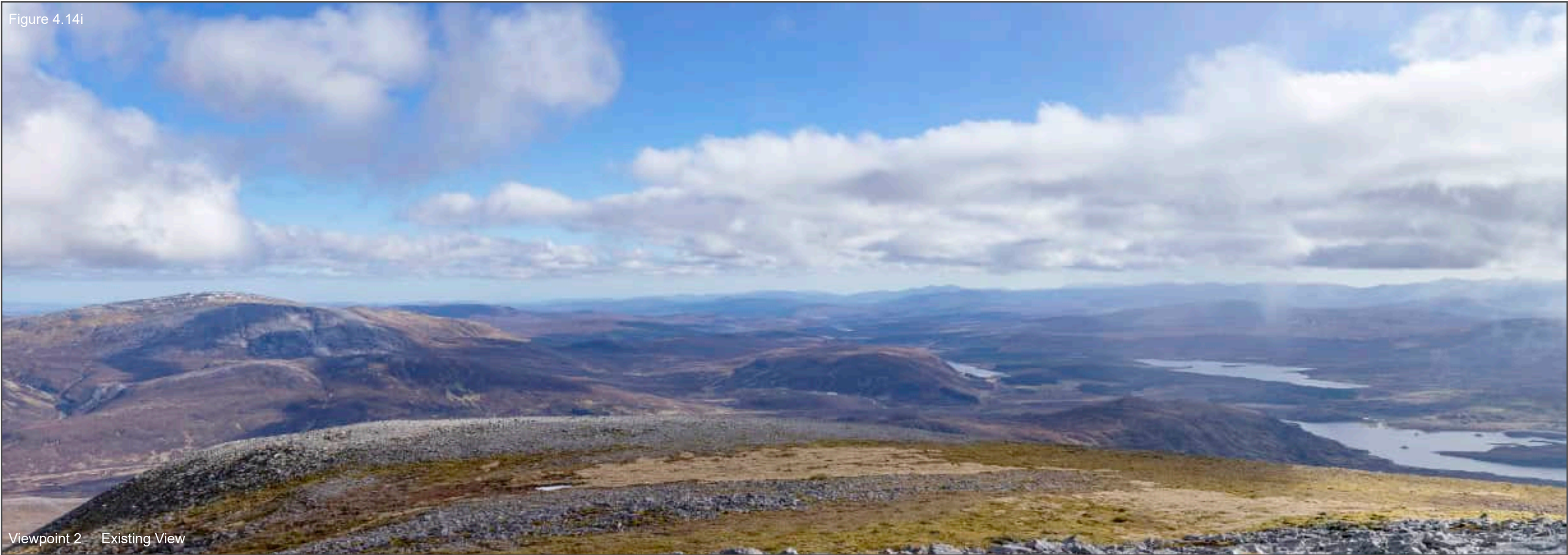
Viewpoint 2 Existing View