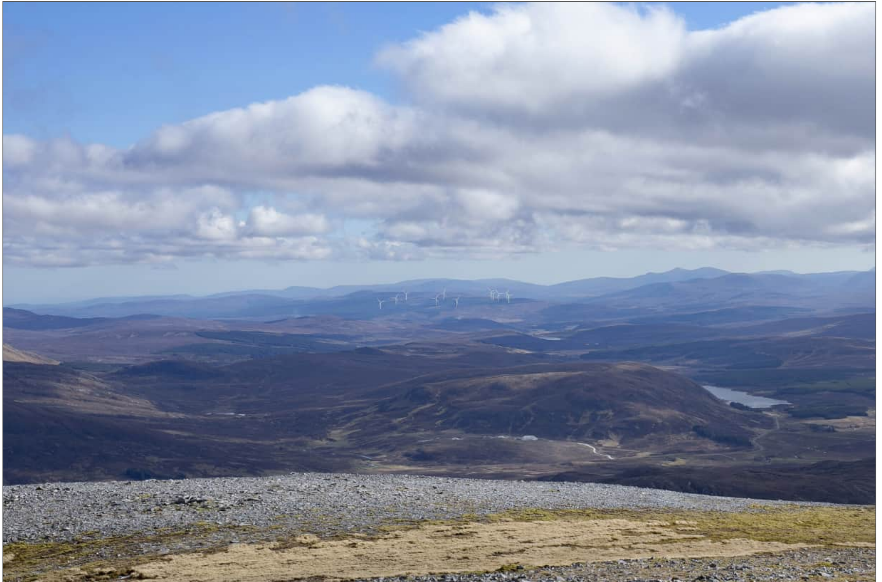
Viewpoint 2 (Figure 4.14k) Canisp Summit

This image should be viewed at a comfortable arms length (approx. 500mm)