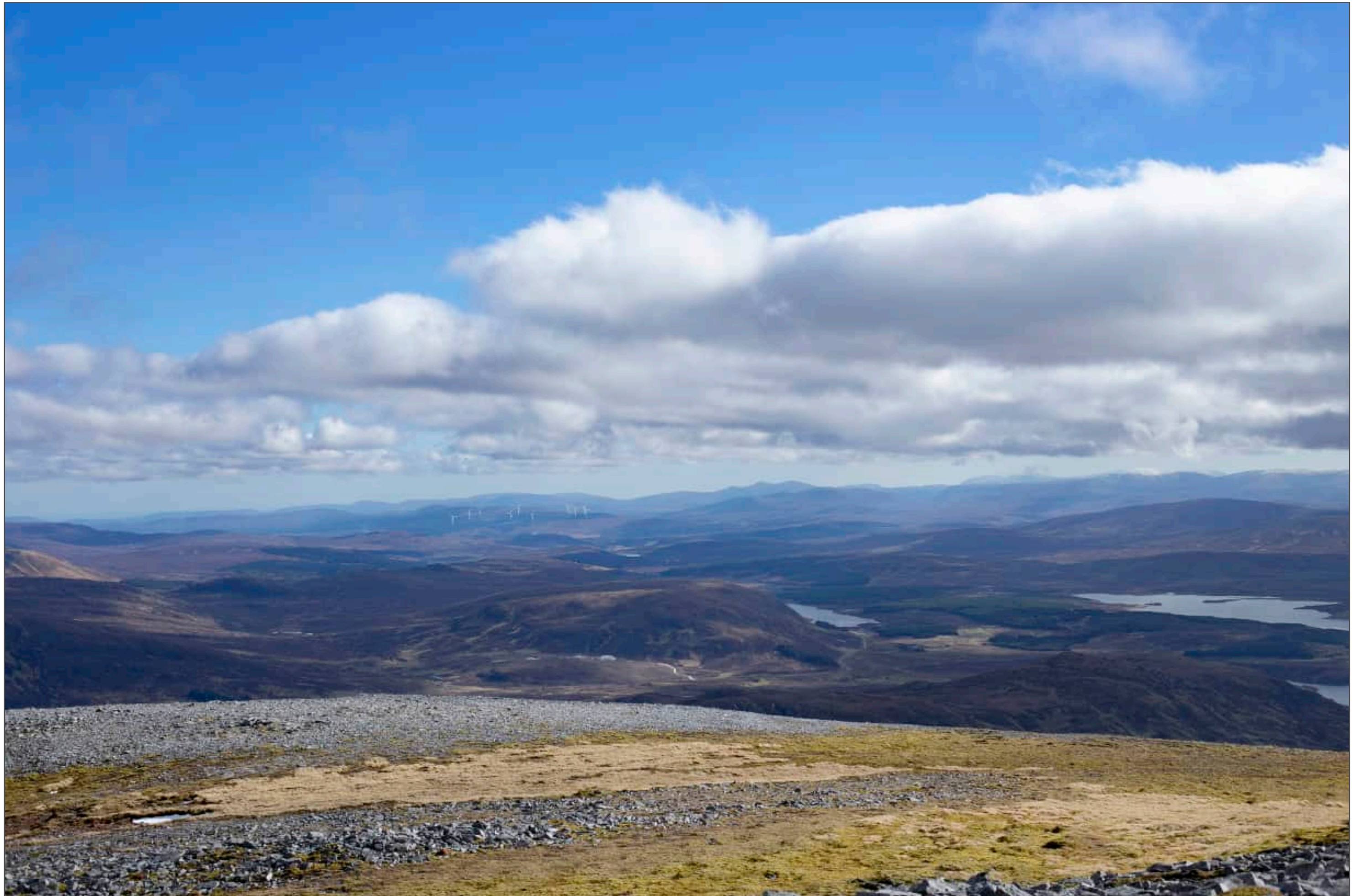
Viewpoint 2 (Figure 4.14j) Canisp Summit

This image should be viewed at a comfortable arms length (approx. 500mm)