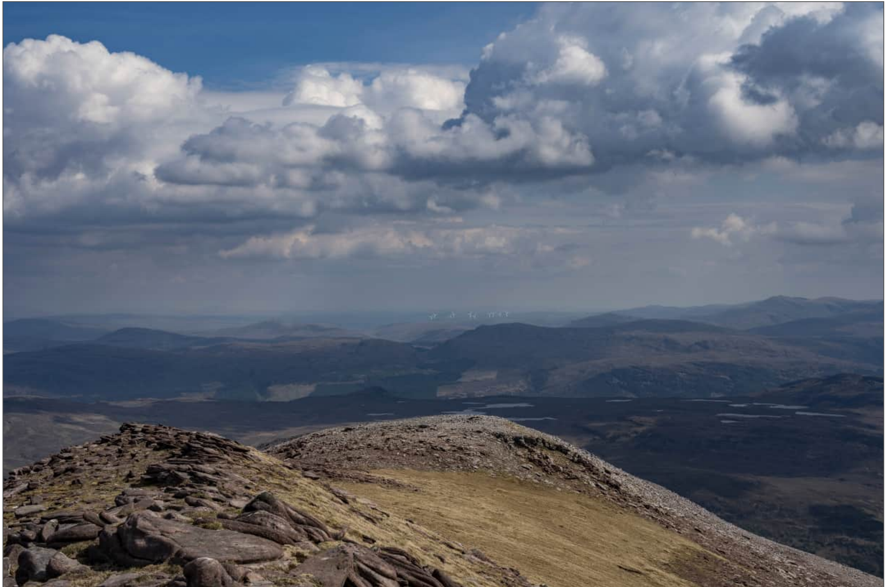
Viewpoint 4 (Figure 4.16j) Glas Mheall Mor Summit

Distance to nearest turbine: 34.48km Camera: Nikon Z6