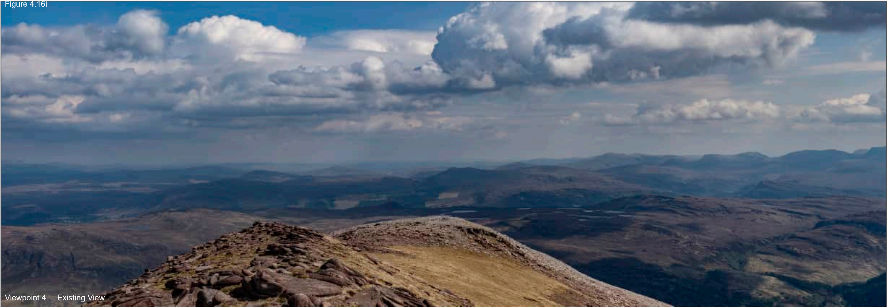
Viewpoint 4 Existing View