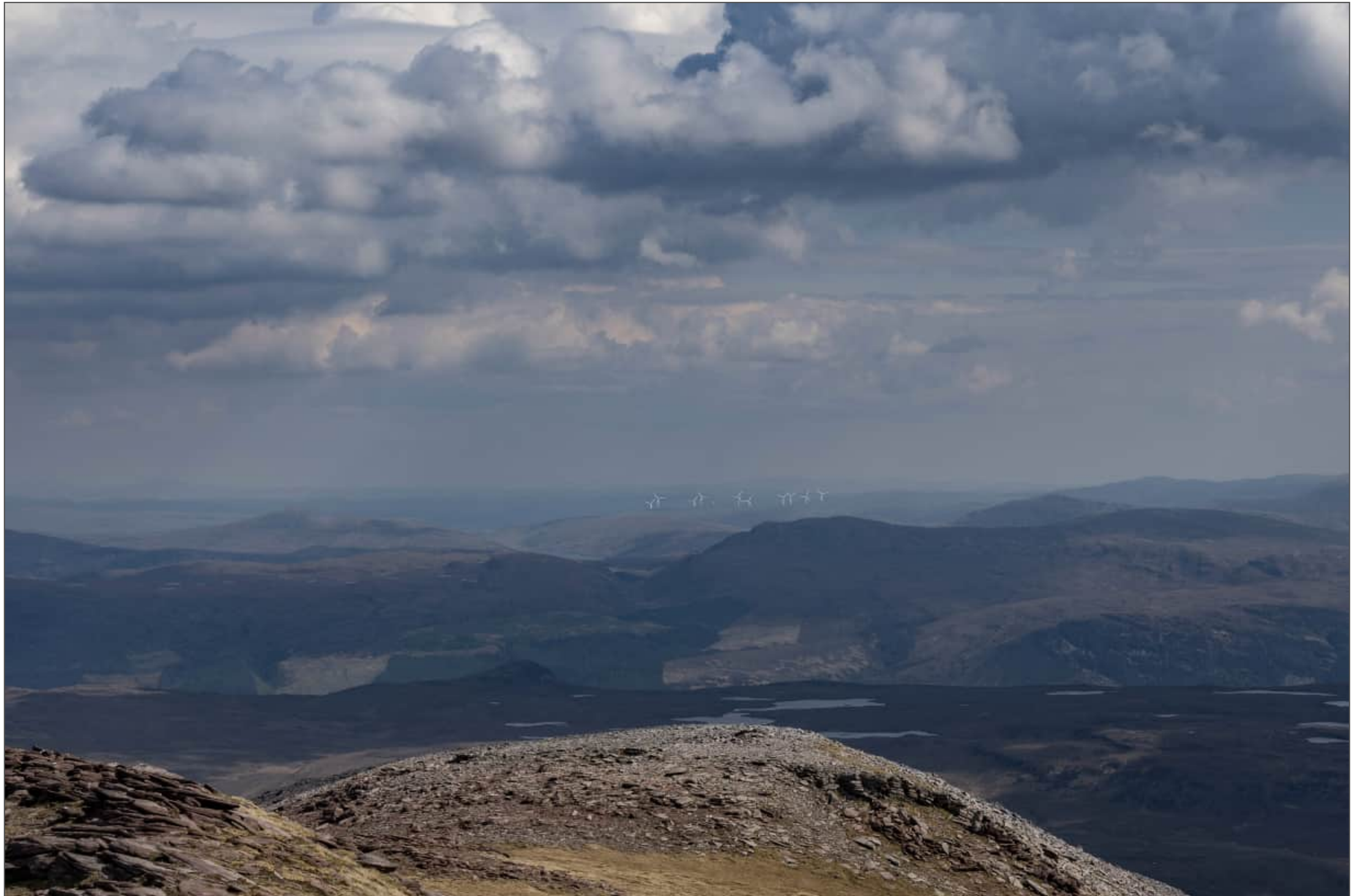
Viewpoint 4 (Figure 4.16k) Glas Mheall Mor Summit