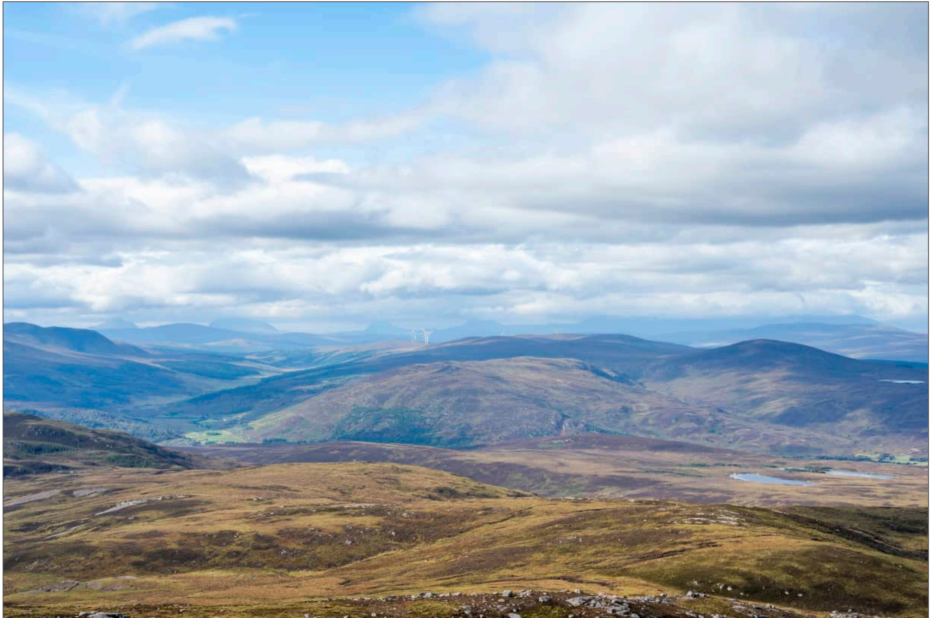
Viewpoint 6 (Figure 4.18j) Carn Salachaidh Summit

Distance to nearest turbine: 13.54km Camera: Nikon Z6