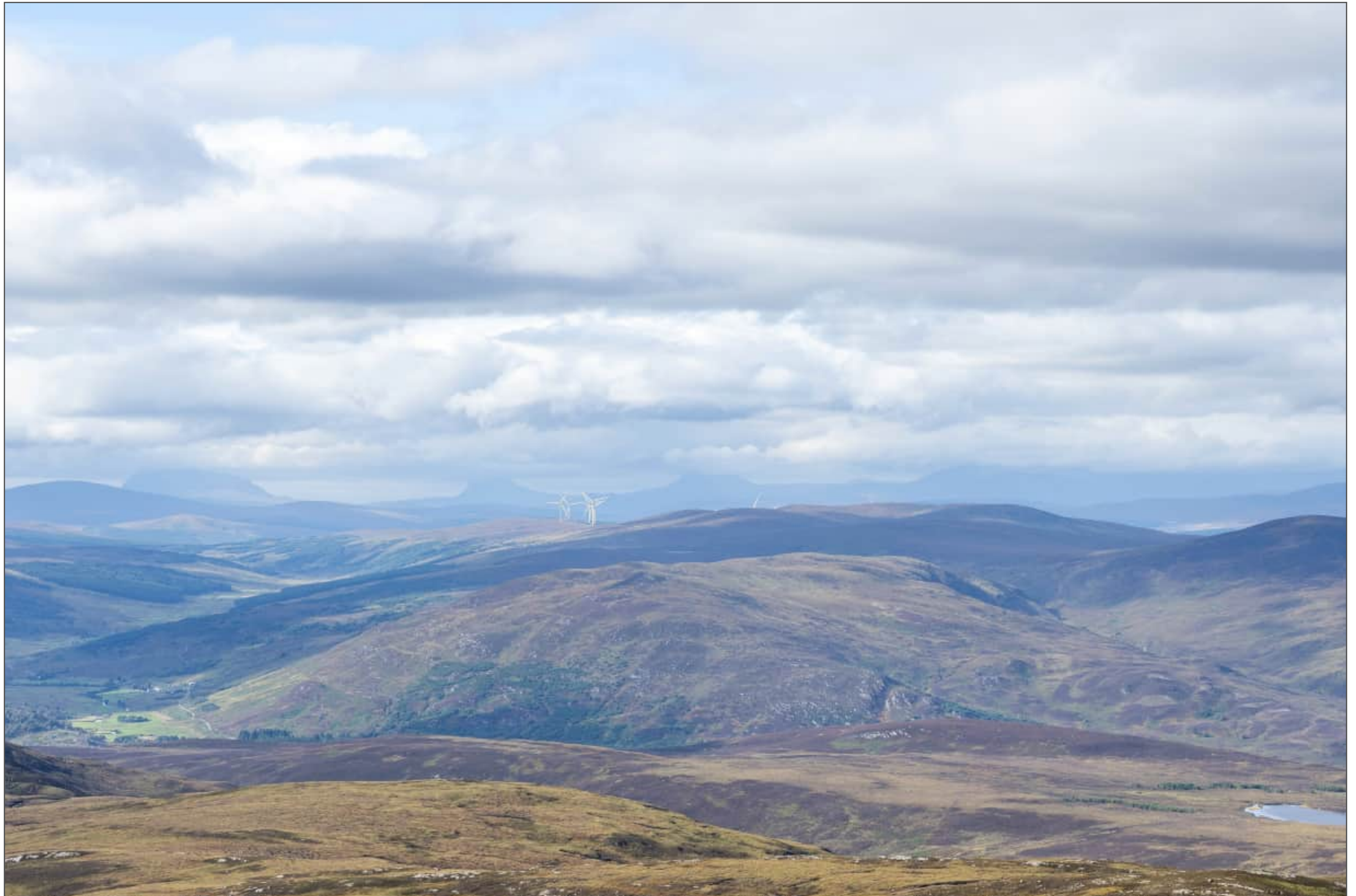
Viewpoint 6 (Figure 4.18k) Carn Salachaidh Summit