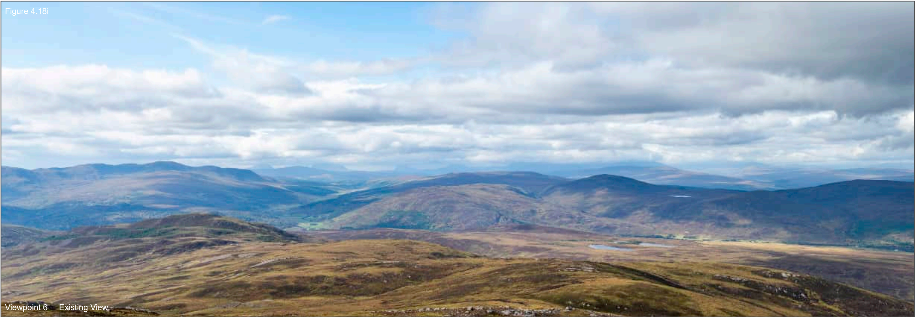
Viewpoint 6 Existing View