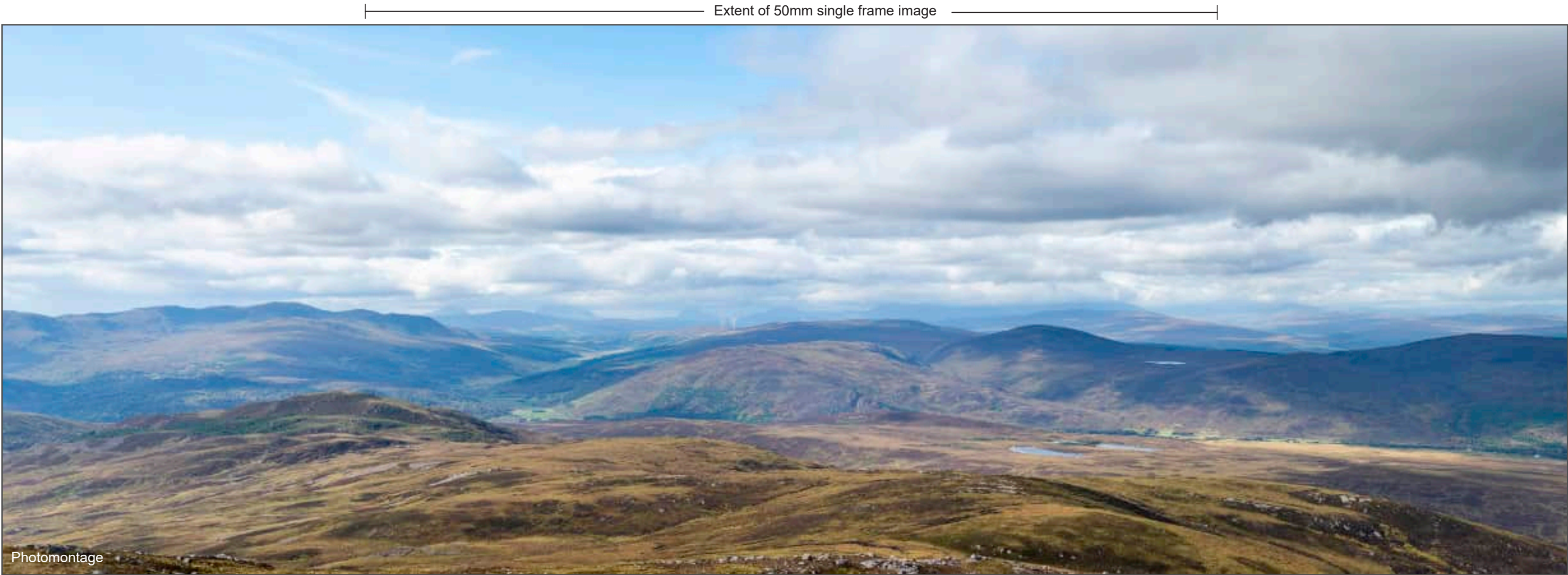
Figure 4.18h Viewpoint 6 Carn Salachaidh Summit

Distance to nearest turbine: 13.54km Camera: Nikon Z6 Focal Length: 50mm vertical (27°) x 28mm horizontal (65.5°) Camera height: 1.5m Date: 17/09/2024 14:26