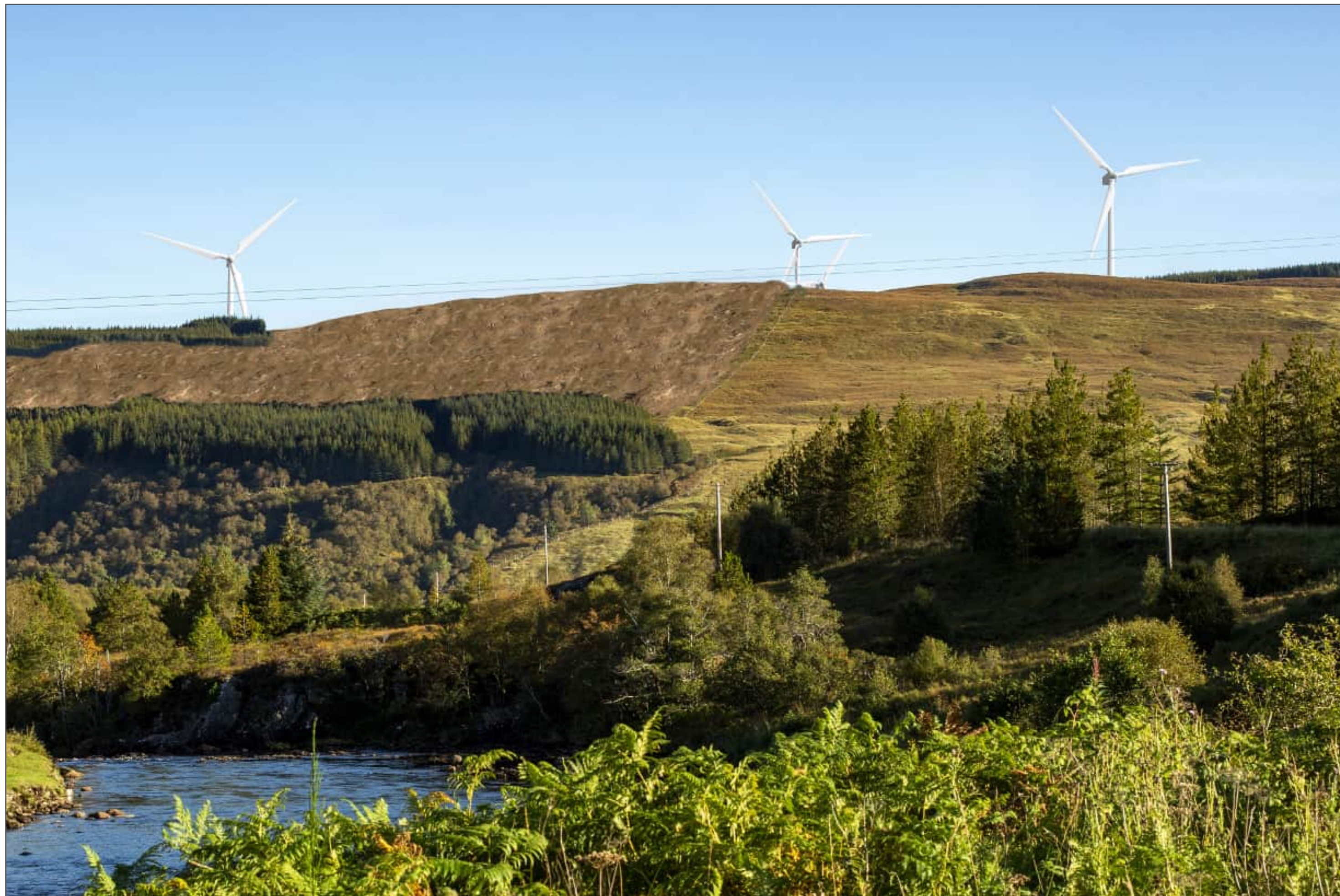
Viewpoint 7 (Figure 4.19n) Oykel Bridge

This image should be viewed at a comfortable arms length (approx. 500mm)