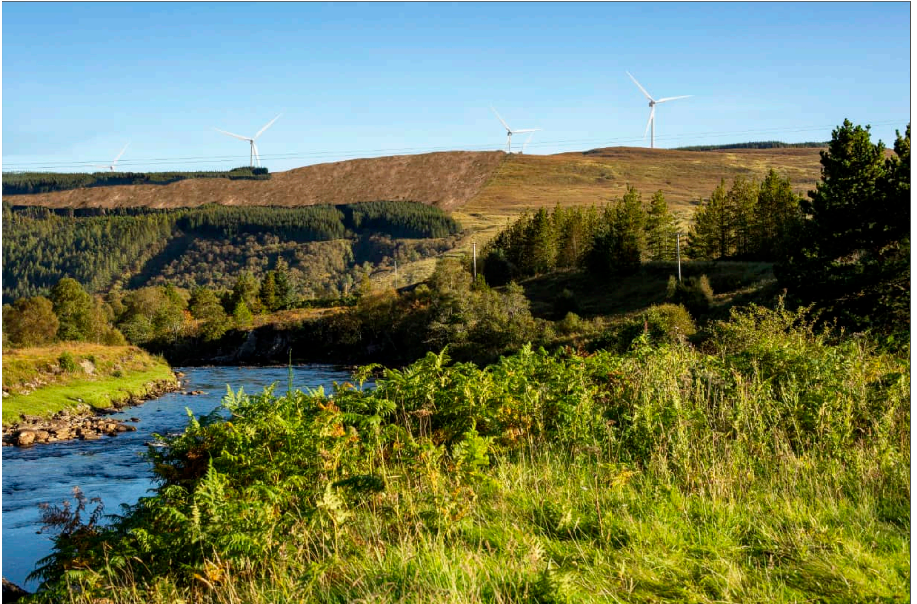
Viewpoint 7 (Figure 4.19m) Oykel Bridge