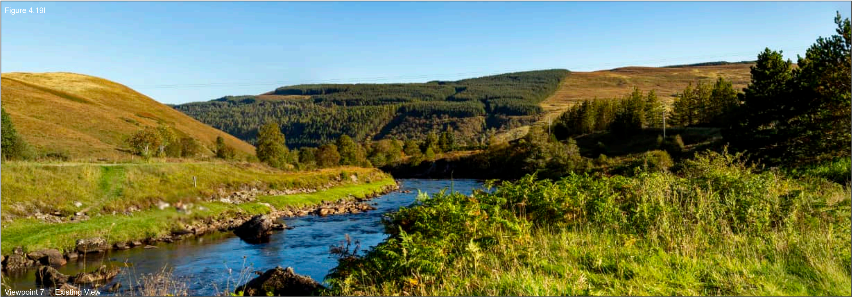
Viewpoint 7 Existing View