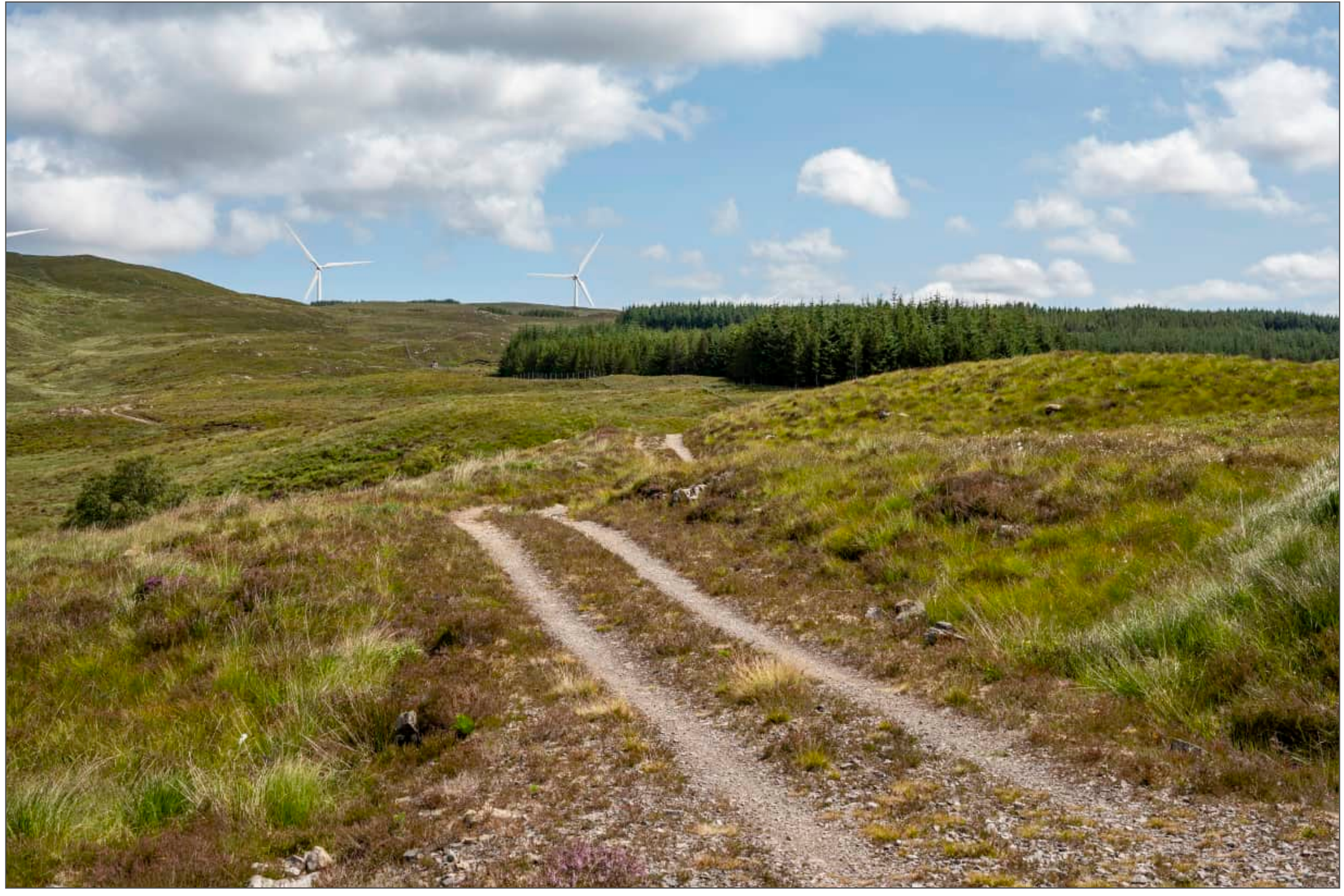
Viewpoint 15 (Figure 4.27j) Track west of Strath Cuilennach