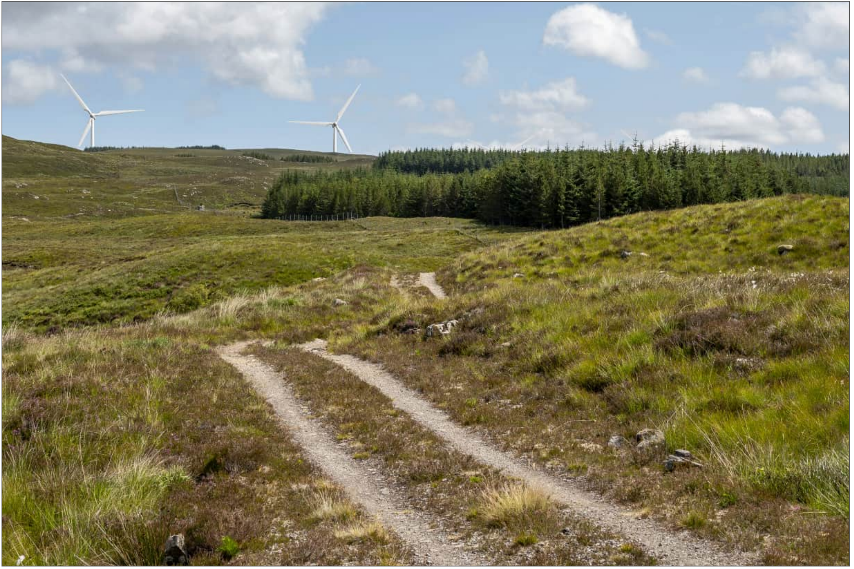
Viewpoint 15 (Figure 4.27k) Track west of Strath Cuilennach