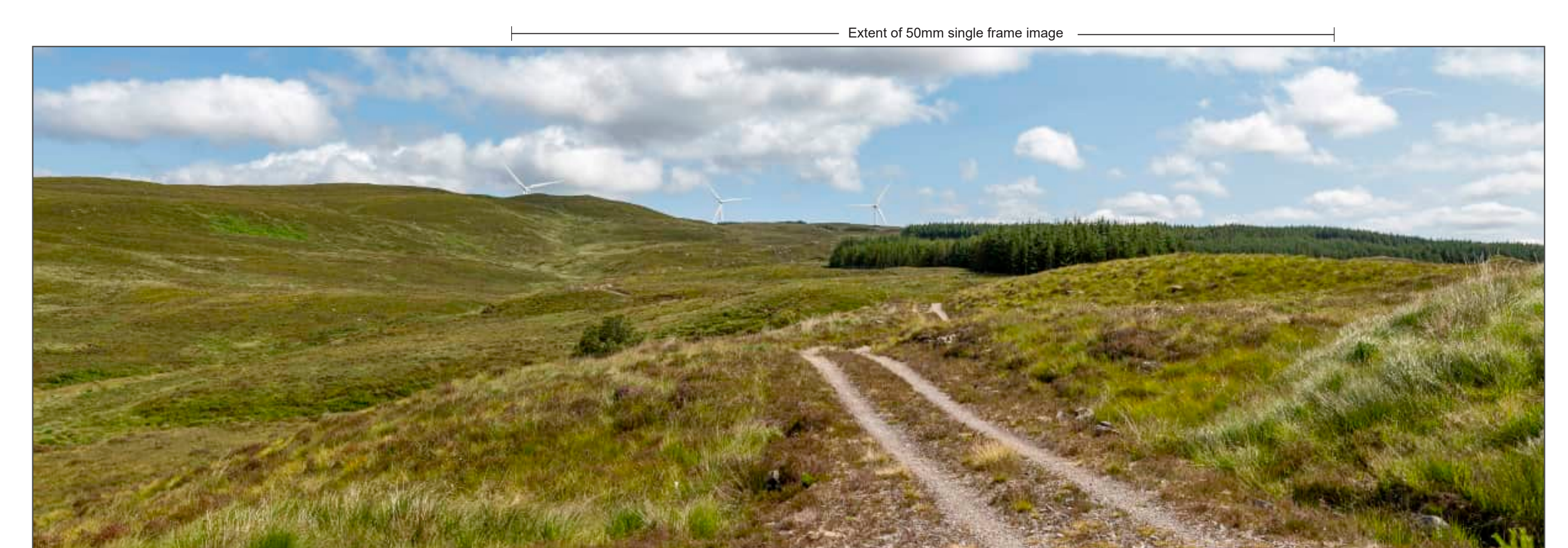
Figure 4.27h Viewpoint 15 Track west of Strath Cuilennach