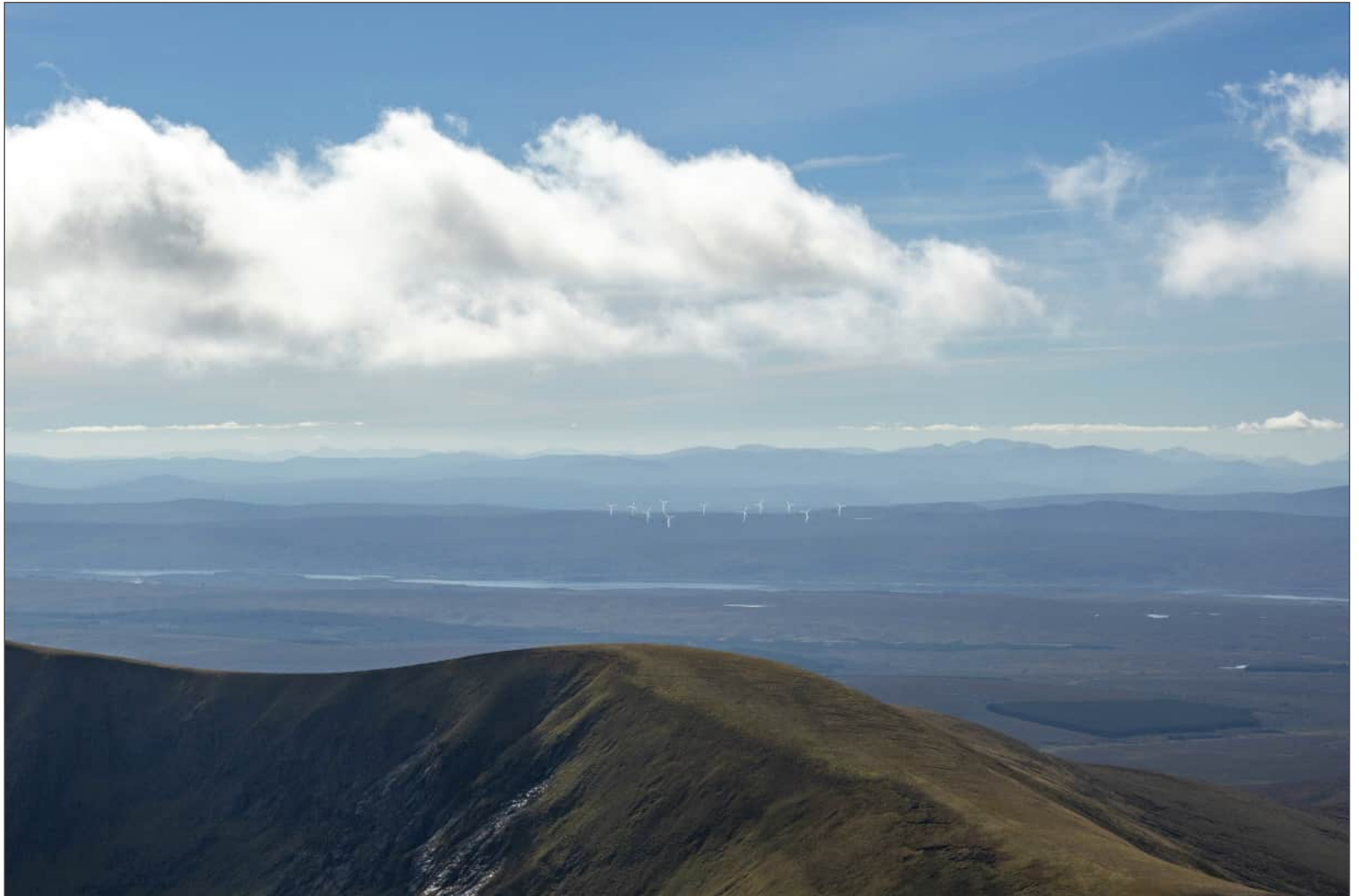
Viewpoint 18 (Figure 4.30k) Ben Kilbreck Summit

Distance to nearest turbine: 34.53km Camera: Canon EOS 5D Mk3 Focal Length: 75mm Camera height: 1.5m Date: 18/09/2024 12:24