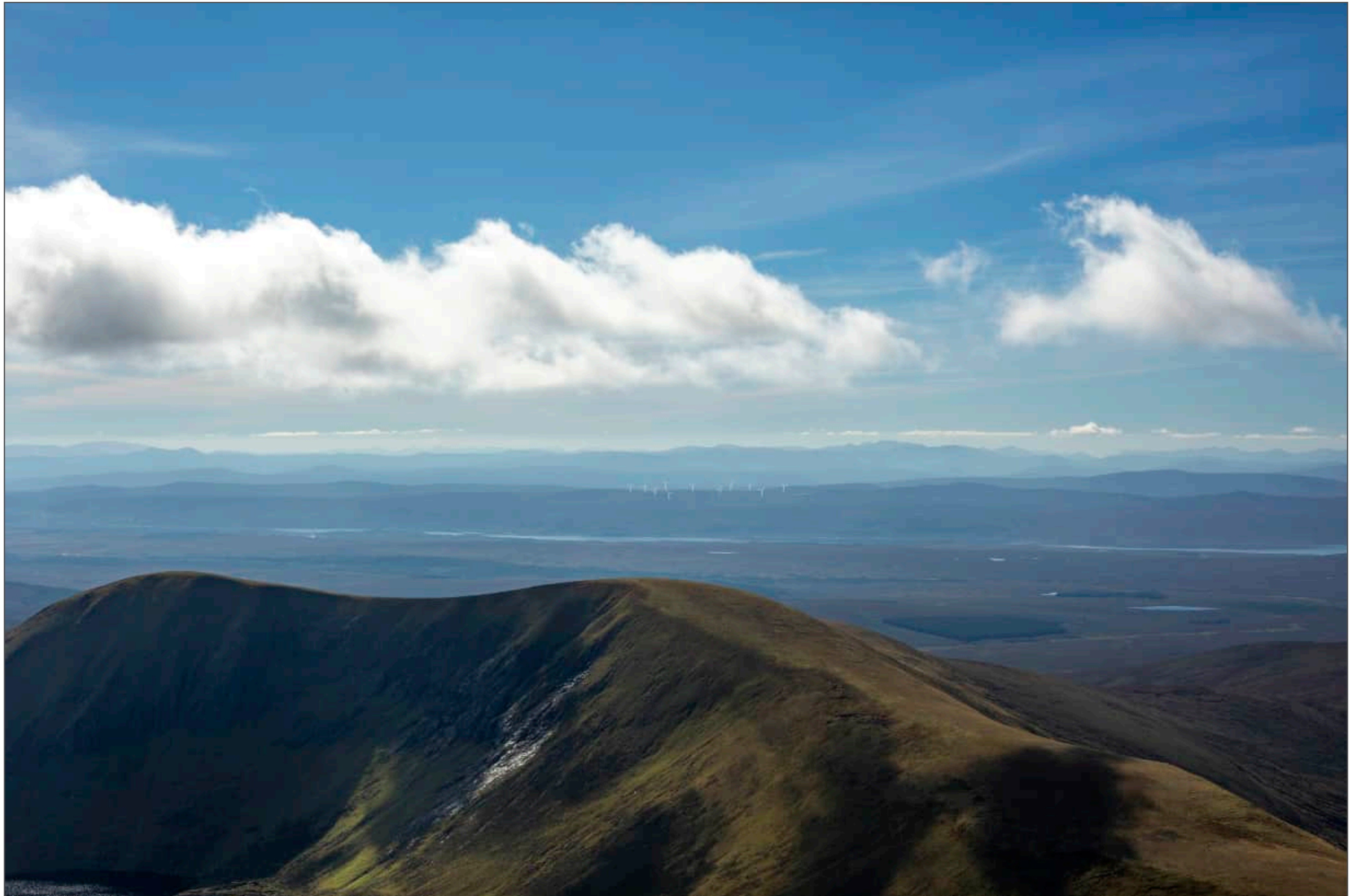
Viewpoint 18 (Figure 4.30j) Ben Kilbreck Summit

Distance to nearest turbine: 34.53km Camera: Canon EOS 5D Mk3 Focal Length: 50mm Camera height: 1.5m Date: 18/09/2024 12:24