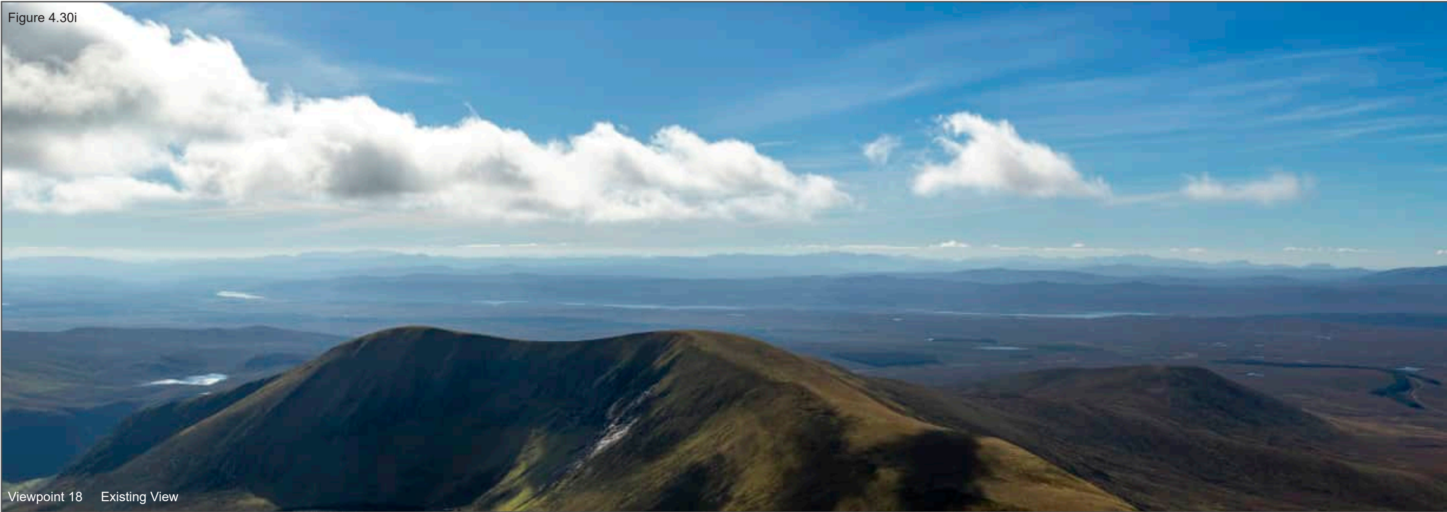
Viewpoint 18 Existing View