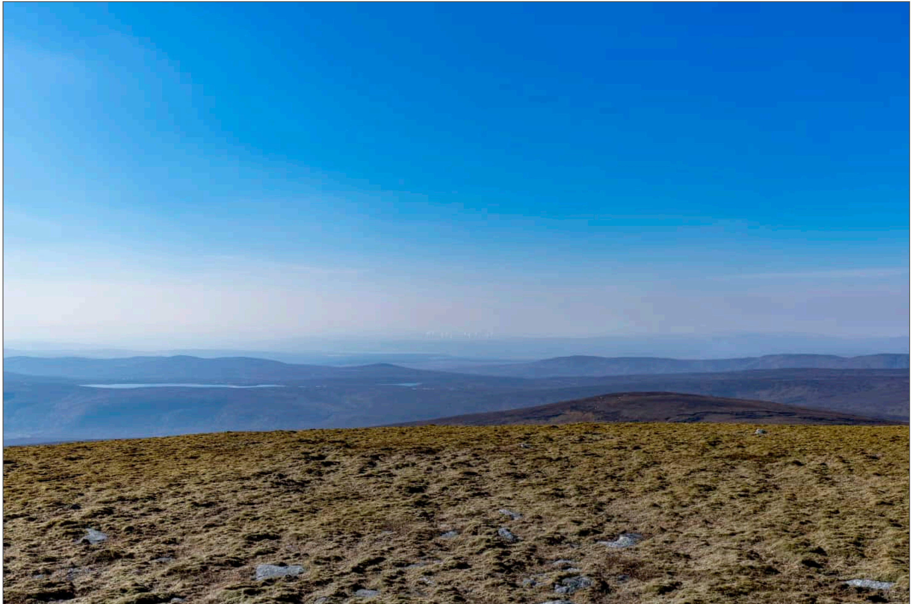
Viewpoint 19 (Figure 4.31j) Creag Mhor Summit

Distance to nearest turbine: 36.80km Camera: Nikon D5