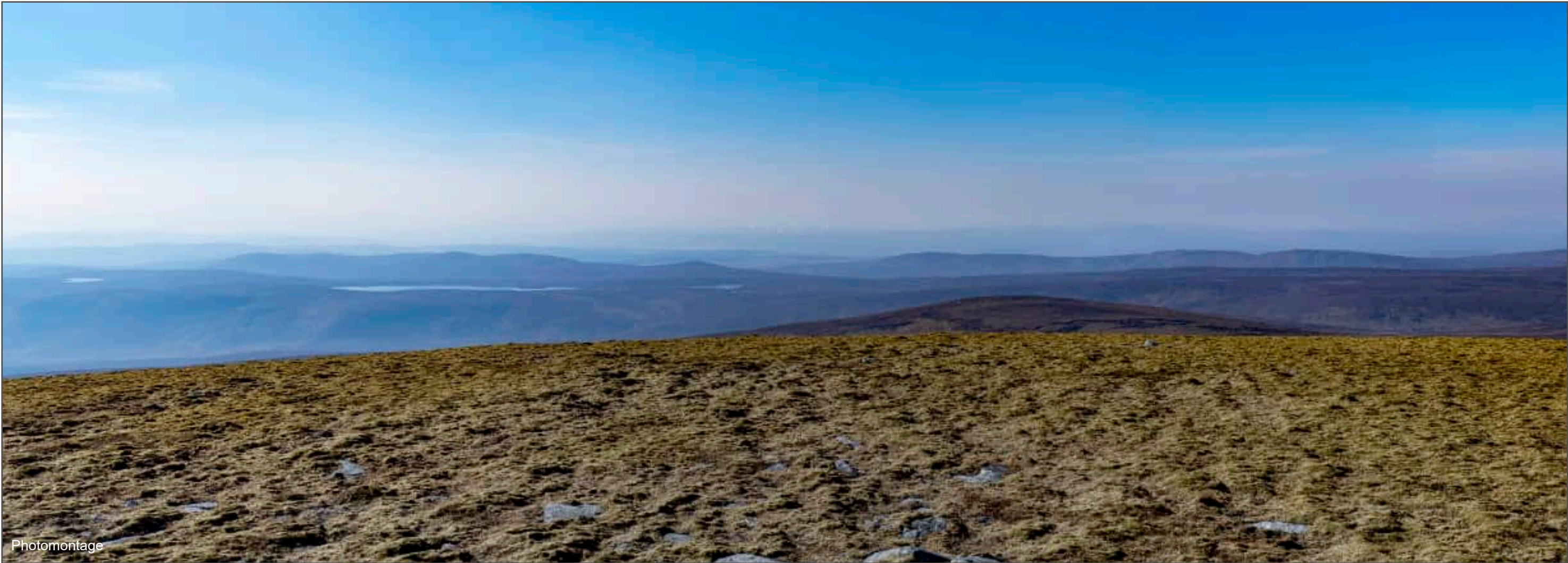
Figure 4.31h Viewpoint 19 Creag Mhor Summit

Distance to nearest turbine: 36.80km Camera: Nikon D5 Focal Length: 50mm vertical (27°) x 28mm horizontal (65.5°) Camera height: 1.5m Date: 19/03/2025 11:33