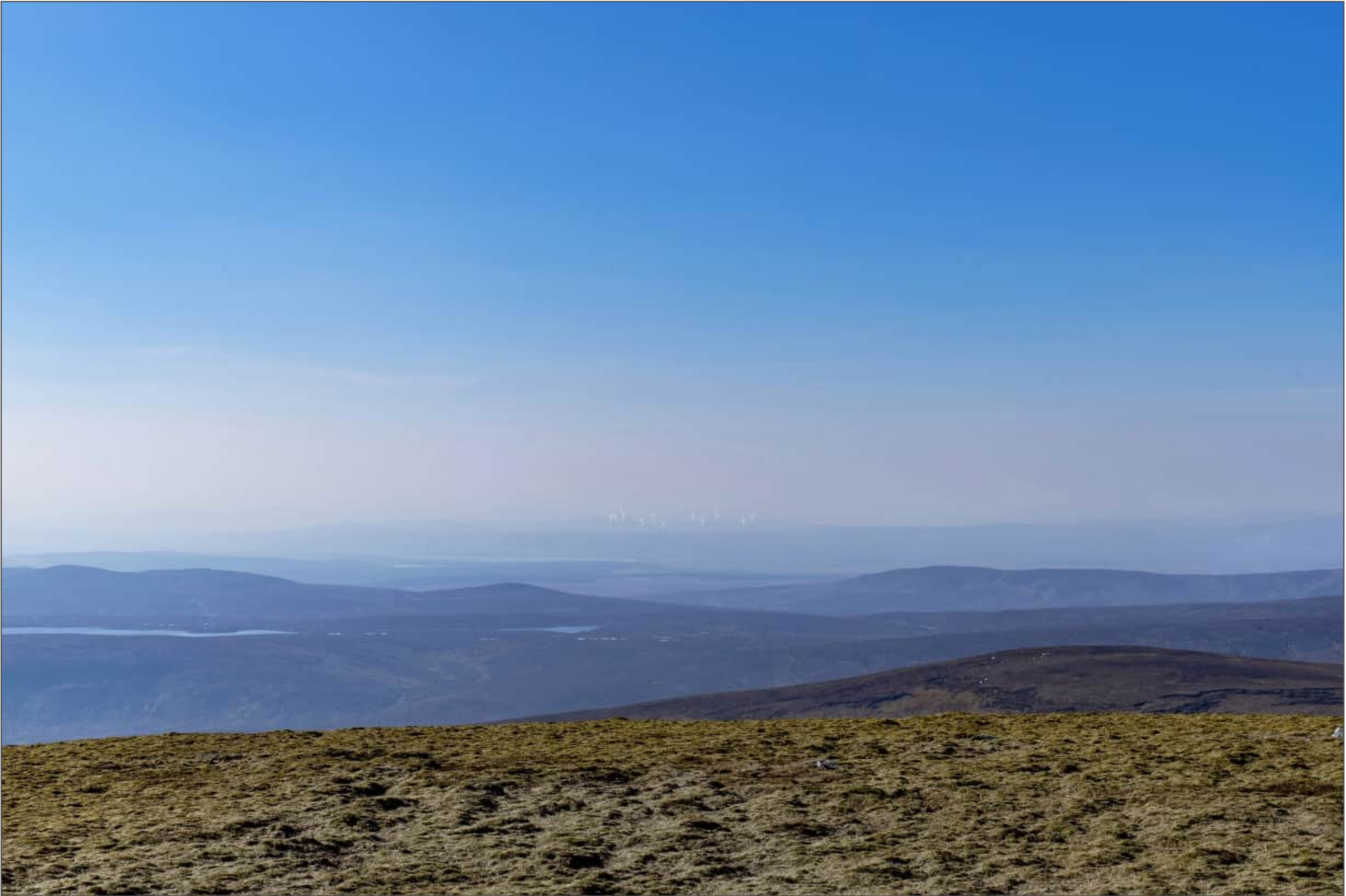
Viewpoint 19 (Figure 4.31k) Creag Mhor Summit Distance to nearest turbine: 36.80km Camera: Nikon D5 Focal Length: 75mm Camera height: 1.5m Date: 19/03/2025 11:33 This image should be viewed at a comfortable arms length (approx. 500mm)