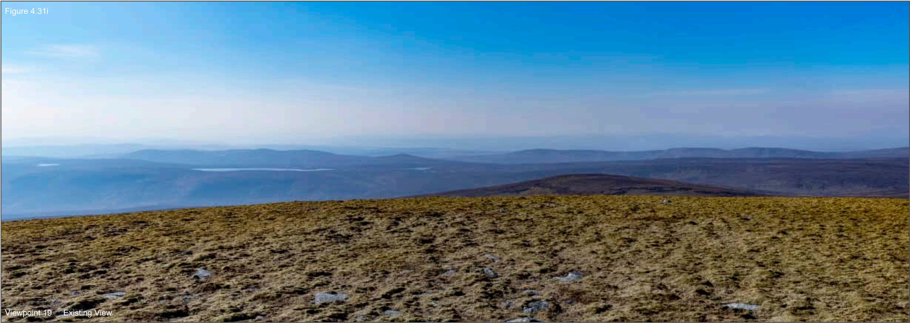
Viewpoint 19 Existing View