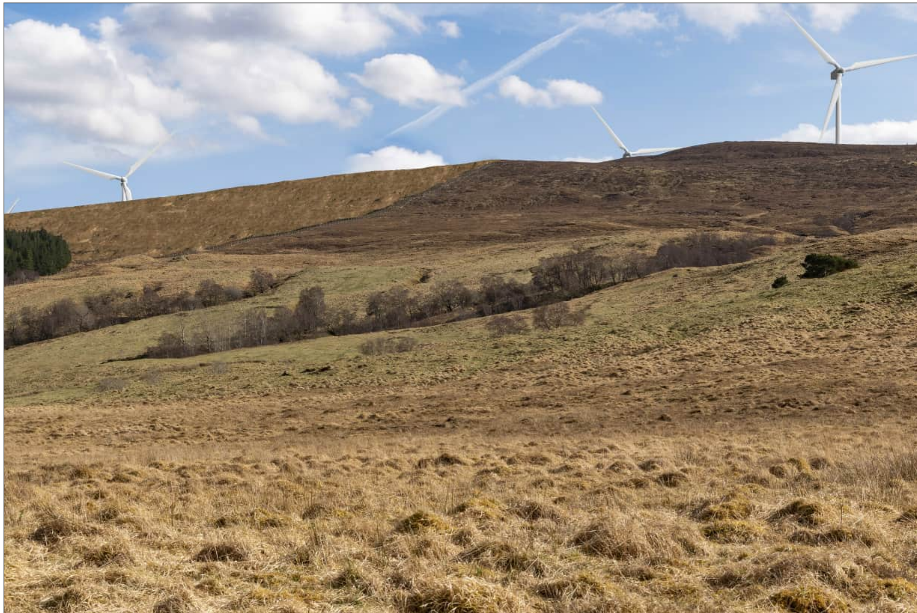
Viewpoint 20 (Figure 4.32k) Oykel Bridge to Glen Einig Footpath

This image should be viewed at a comfortable arms length (approx. 500mm)