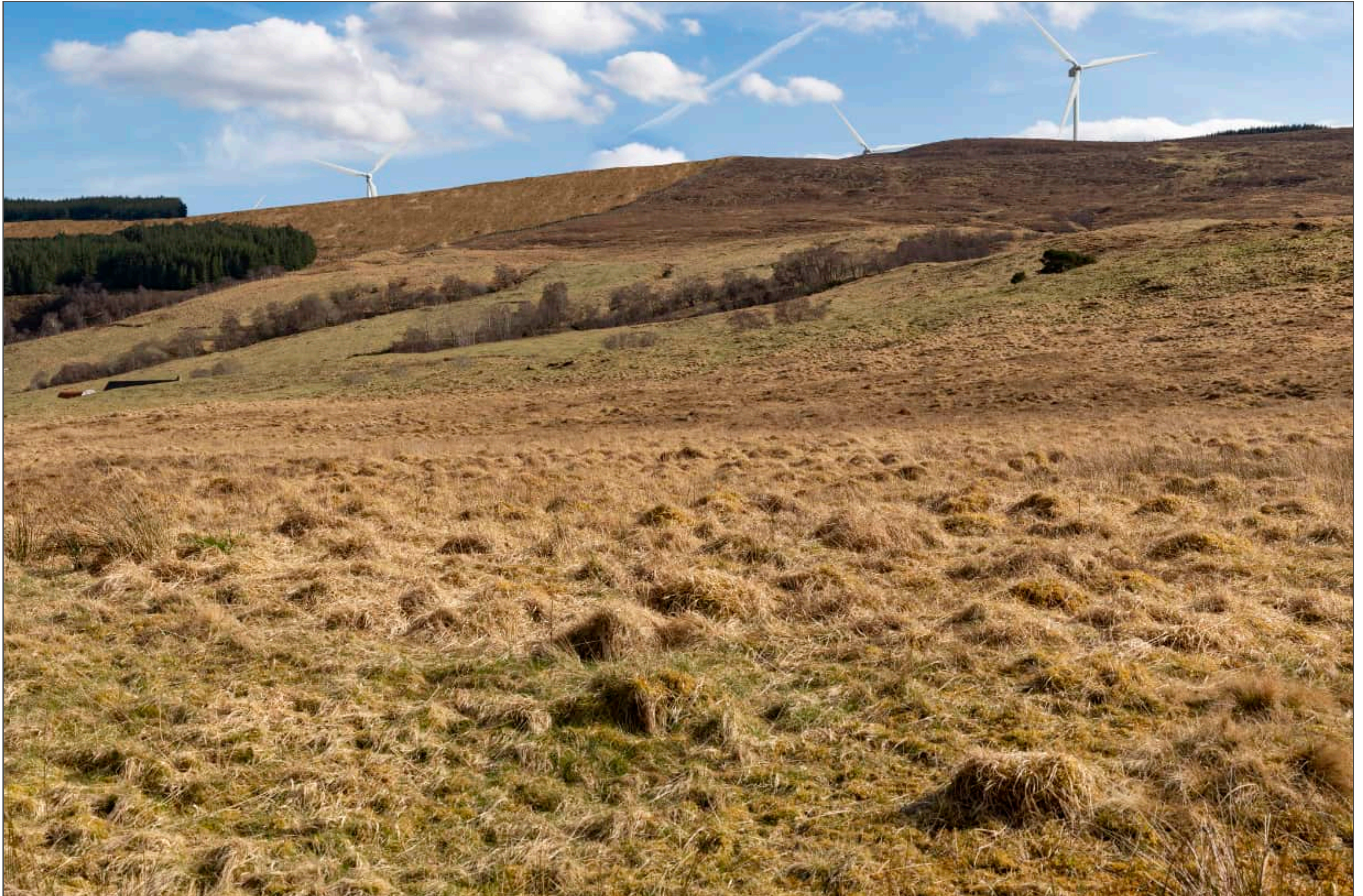
Viewpoint 20 (Figure 4.32j) Oykel Bridge to Glen Einig Footpath

This image should be viewed at a comfortable arms length (approx. 500mm)