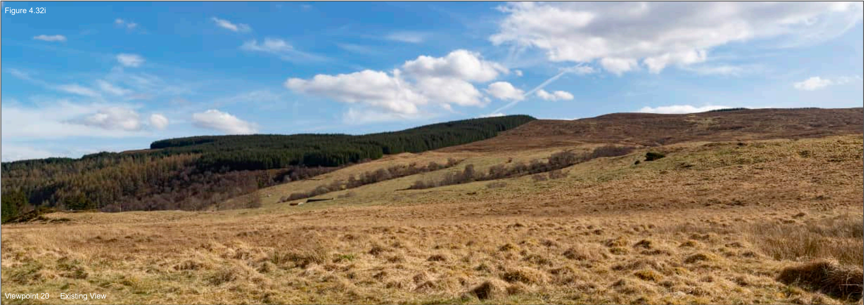
Viewpoint 20 Existing View