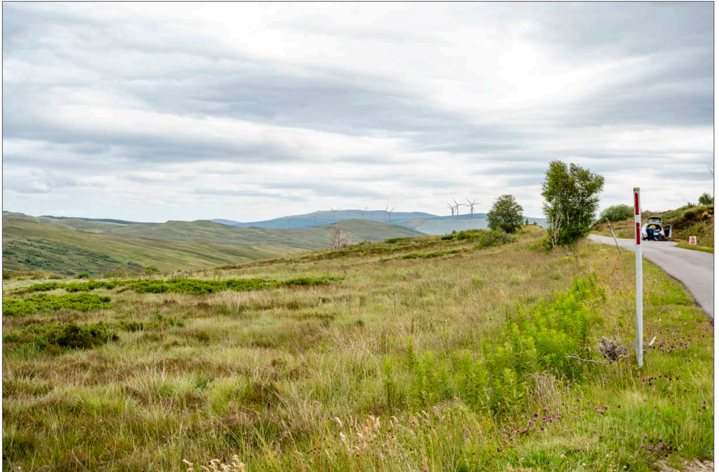
Viewpoint 21 (Figure 4.33j) A837, Loch Craggie