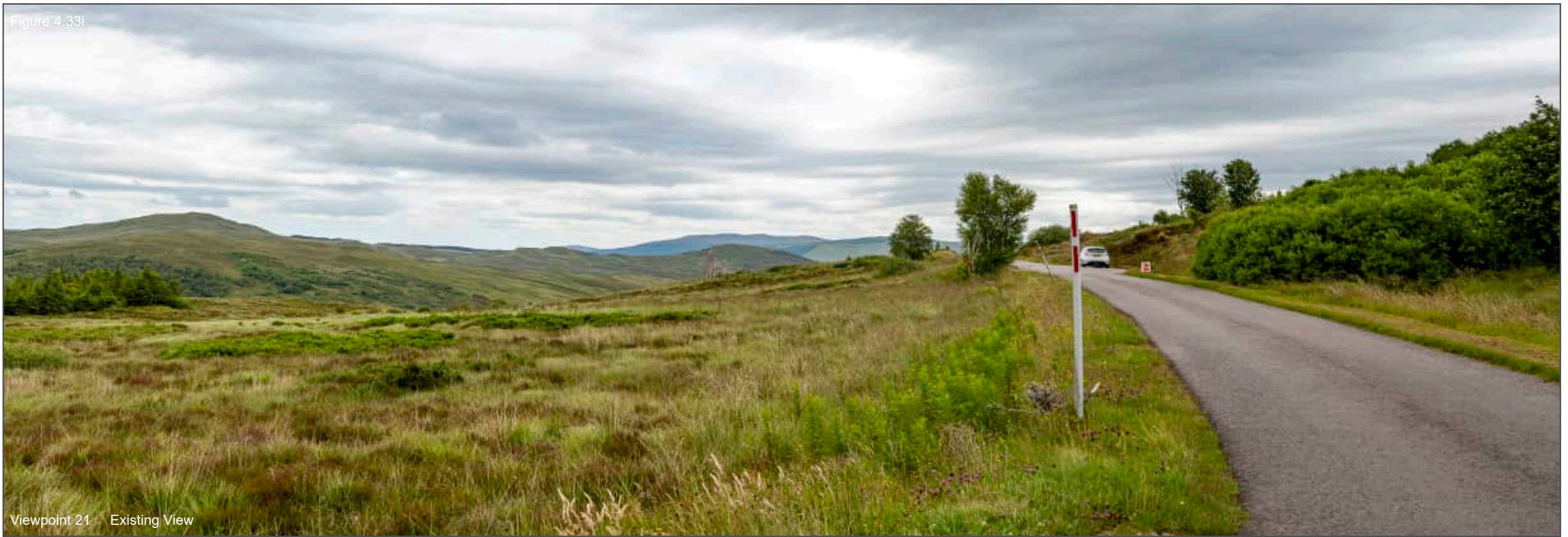
Viewpoint 21 Existing View