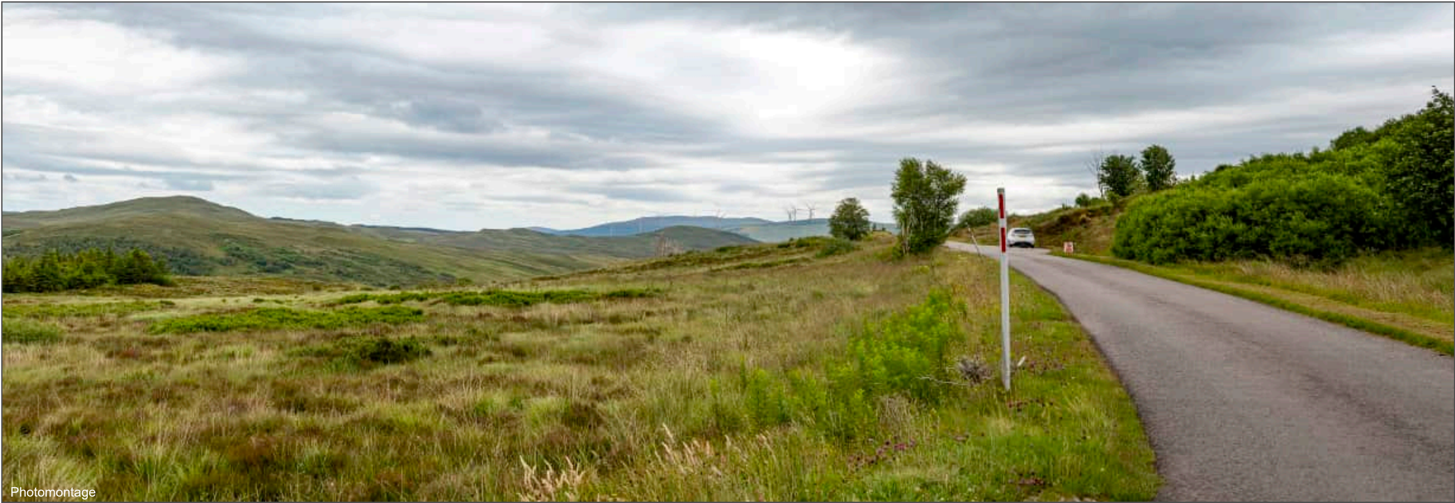
Figure 4.33h Viewpoint 21 A837, Loch Craggie

Distance to nearest turbine: 2.11km Camera: Nikon Z6 Focal Length: 50mm vertical (27°) x 28mm horizontal (65.5°) Camera height: 1.5m Date: 17/07/2024 13:12