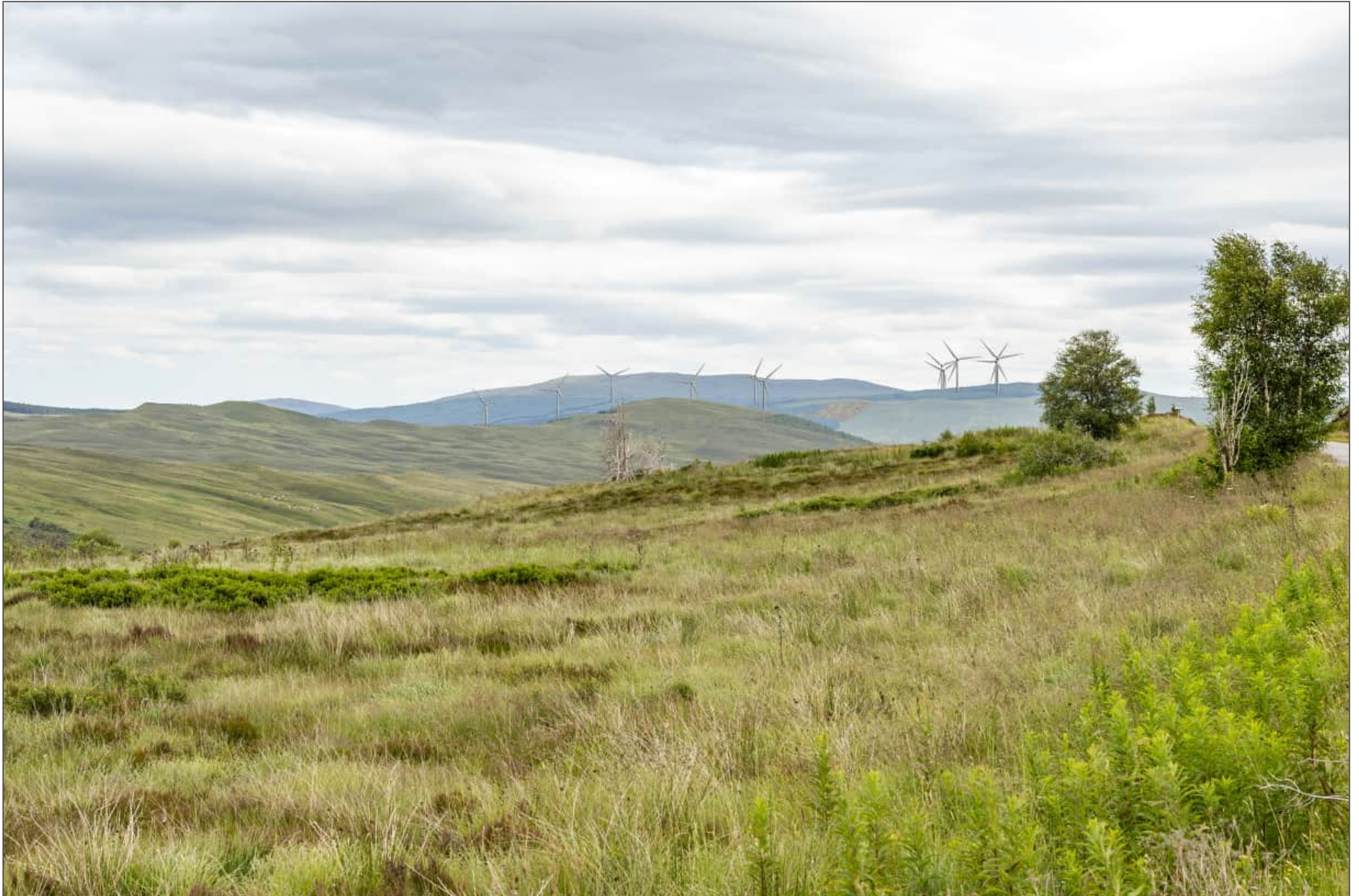
Viewpoint 21 (Figure 4.33k) A837, Loch Craggie