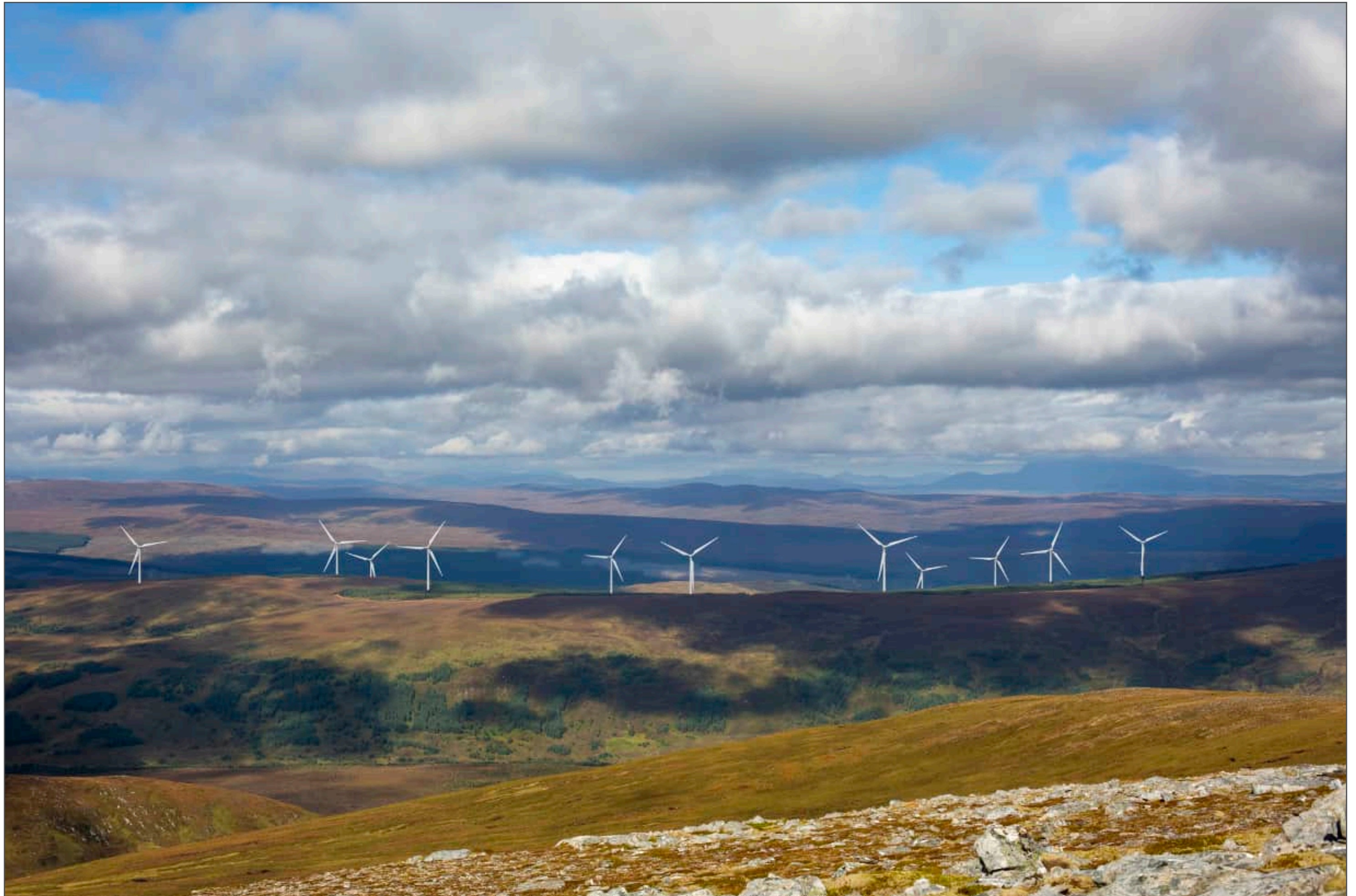
Viewpoint 23 (Figure 4.35j) Carn a Choin Deirg Below Summit

This image should be viewed at a comfortable arms length (approx. 500mm)