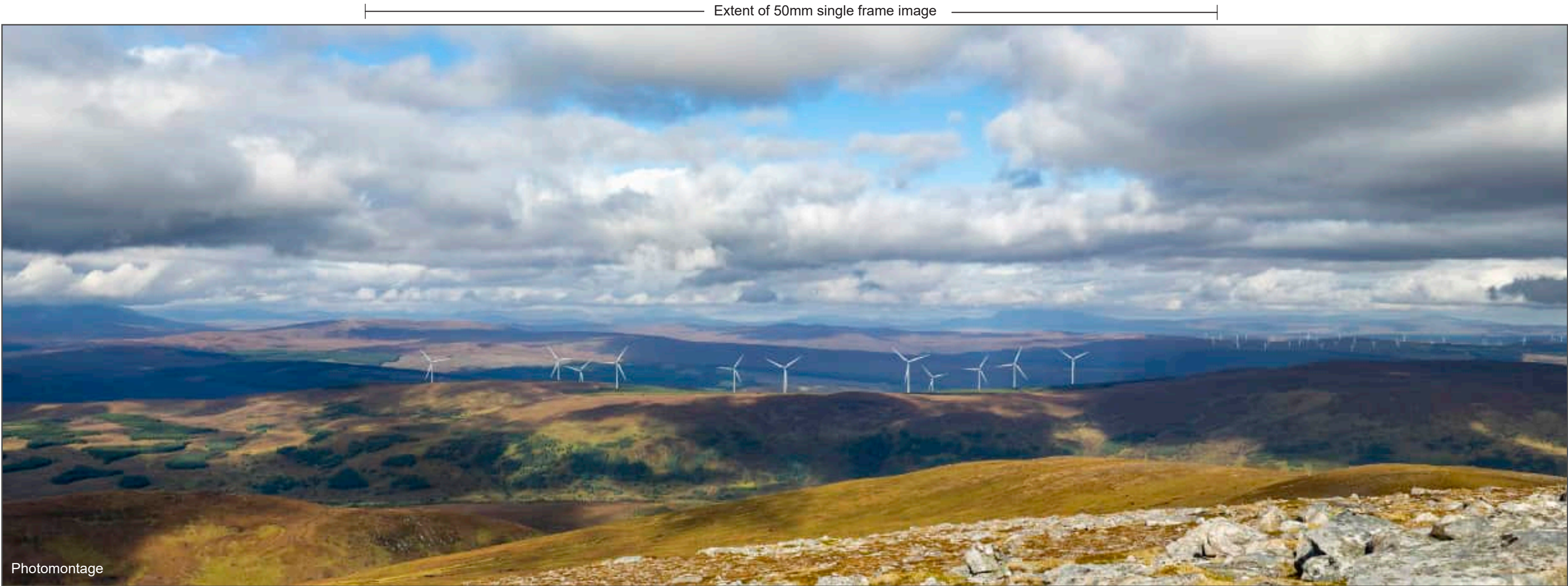
Figure 4.35h Viewpoint 23 Carn a Choin Deirg Below Summit

Distance to nearest turbine: 4.95km Camera: Canon EOS 5D Mk3 Focal Length: 50mm vertical (27°) x 28mm horizontal (65.5°) Camera height: 1.5m Date: 17/07/2024 13:03