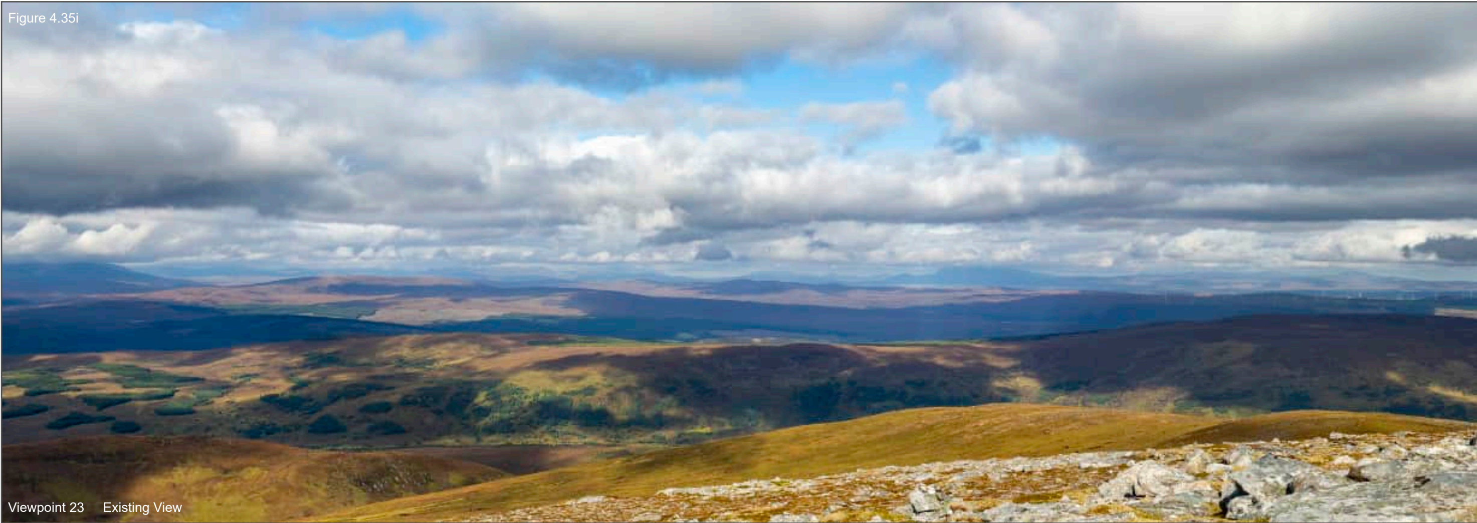
Viewpoint 23 Existing View