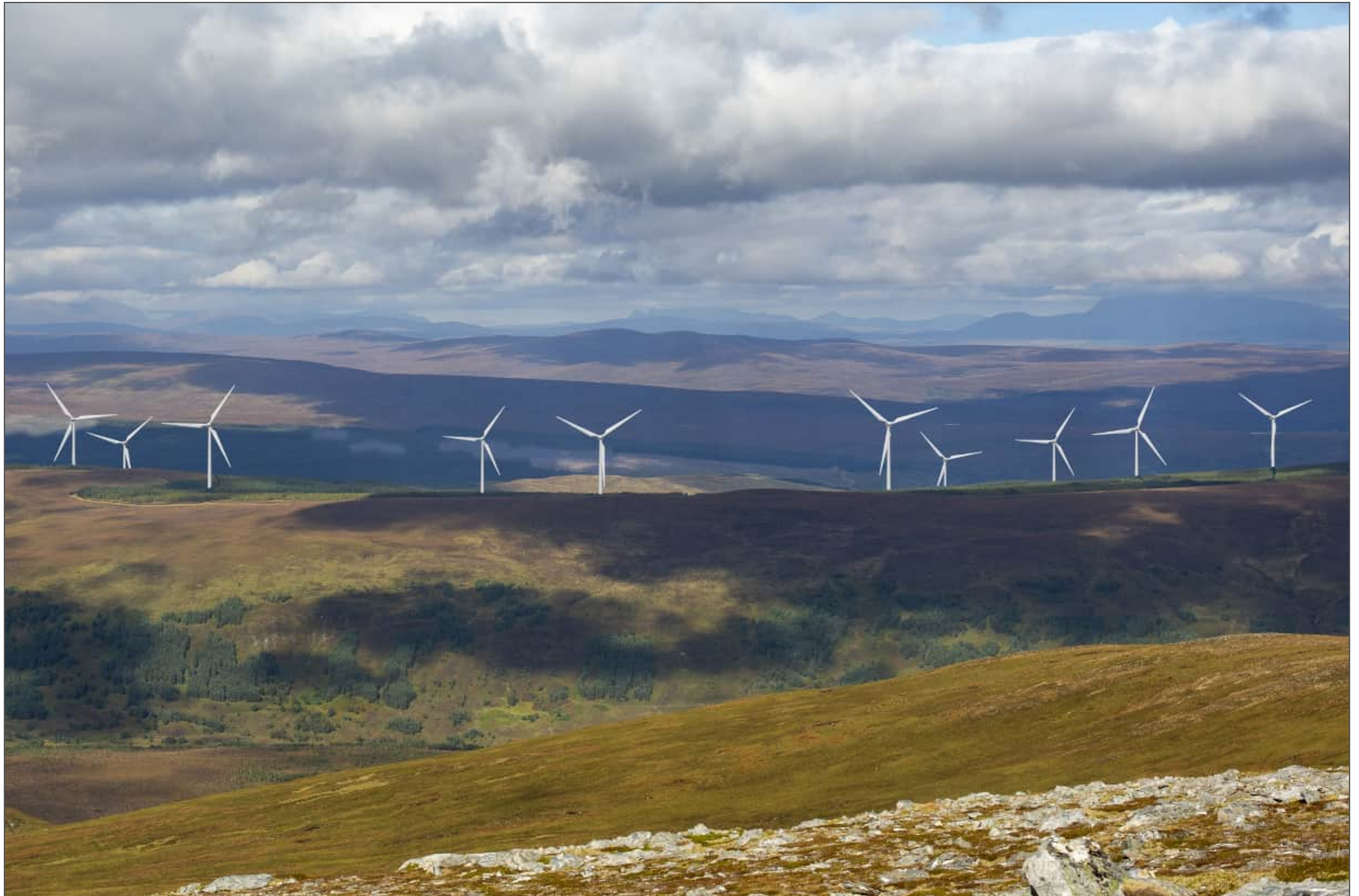
Viewpoint 23 (Figure 4.35k) Carn a Choin Deirg Below Summit

This image should be viewed at a comfortable arms length (approx. 500mm)