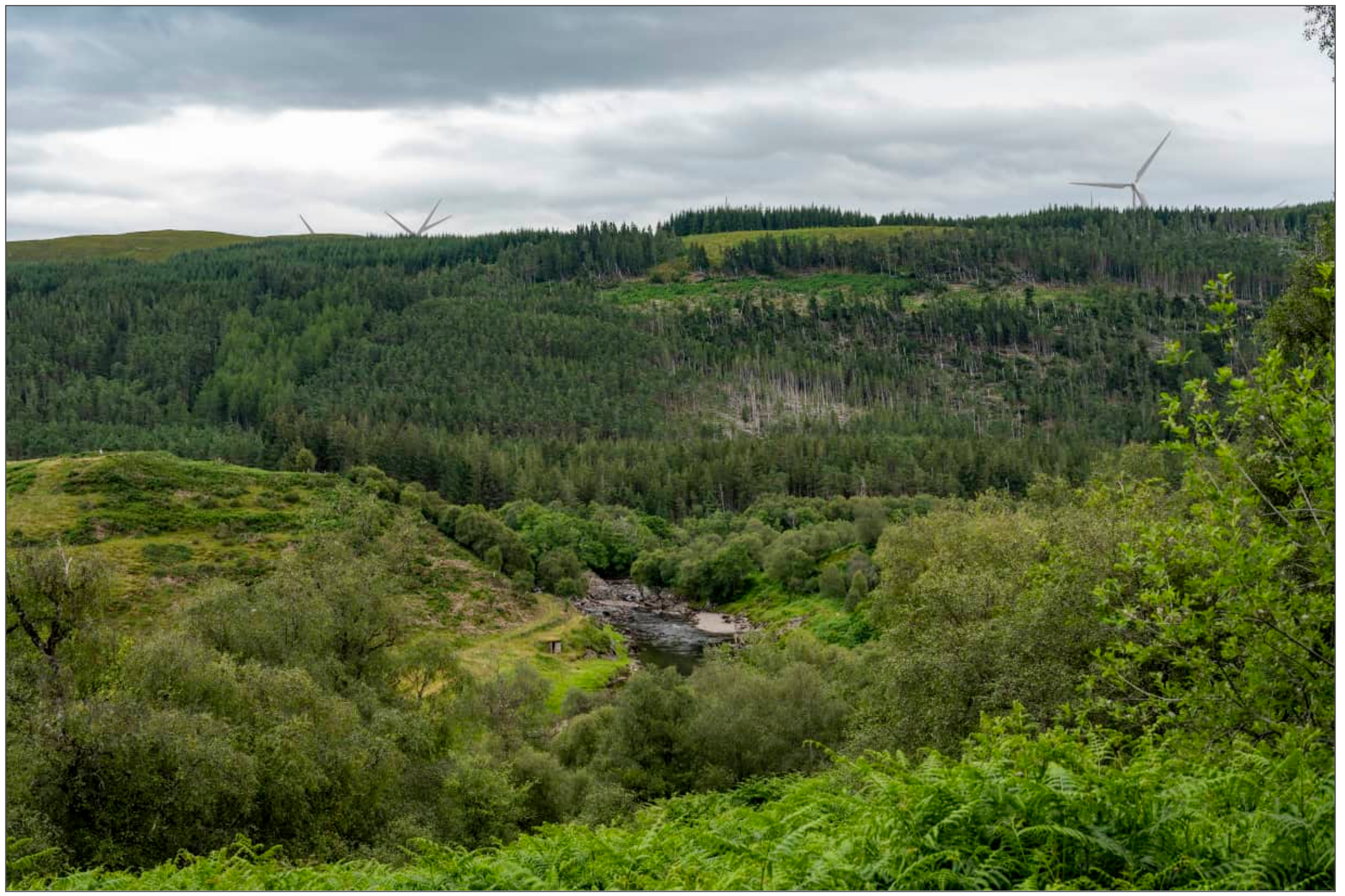
CH Viewpoint 1a (Figure 5.9j) A837. Overlooking Langwell Dun Scheduled Monument SM5302