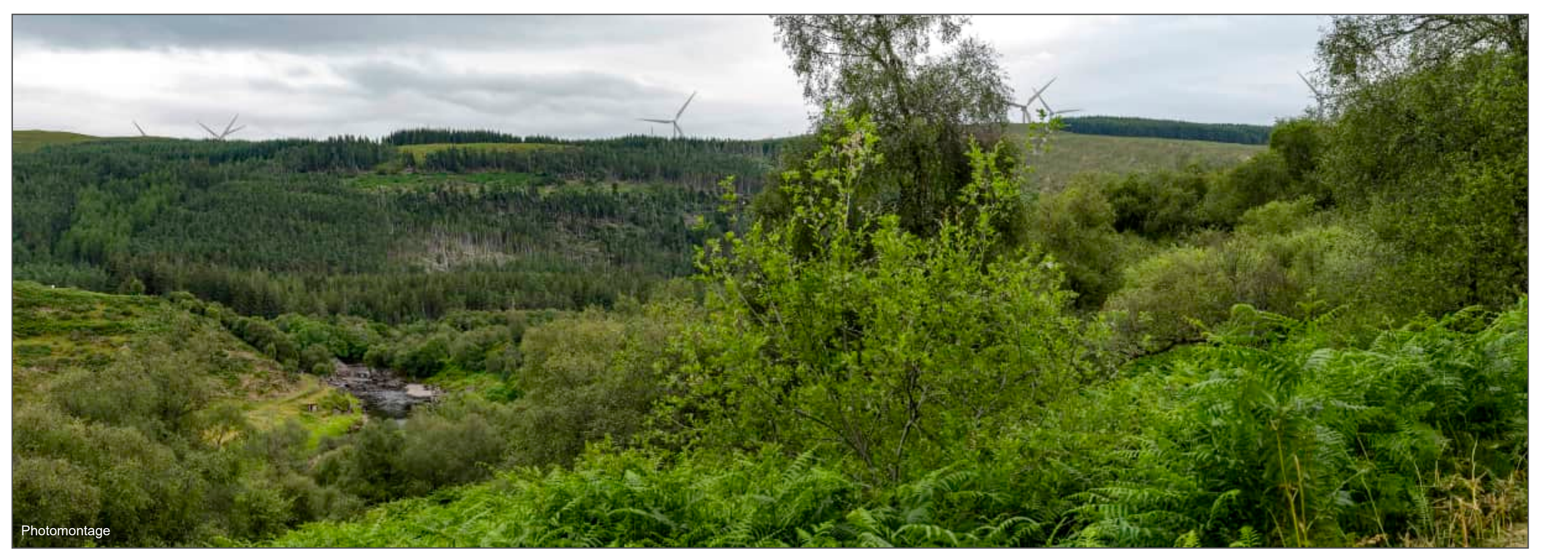
Figure 5.9h CH Viewpoint 1a A837. Overlooking Langwell Dun Scheduled Monument SM5302

Distance to nearest turbine: 2.25km Camera: Nikon Z6