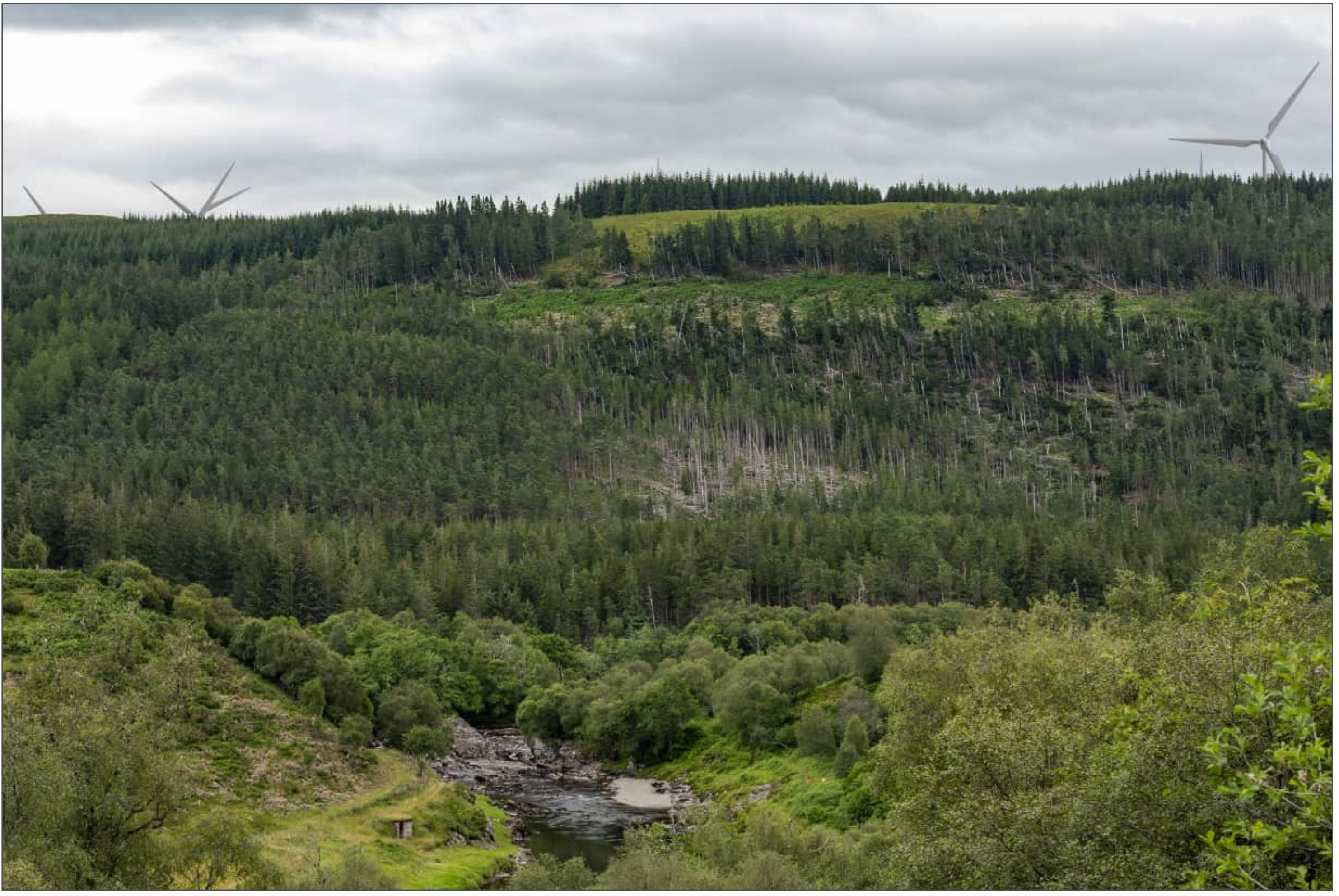
CH Viewpoint 1a (Figure 5.9k) A837. Overlooking Langwell Dun Scheduled Monument SM5302 This image should be viewed at a comfortable arms length (approx. 500mm)