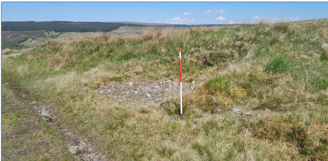
Plate 16: View over borrow pit (Asset 51) adjacent to track (Asset 49), facing north