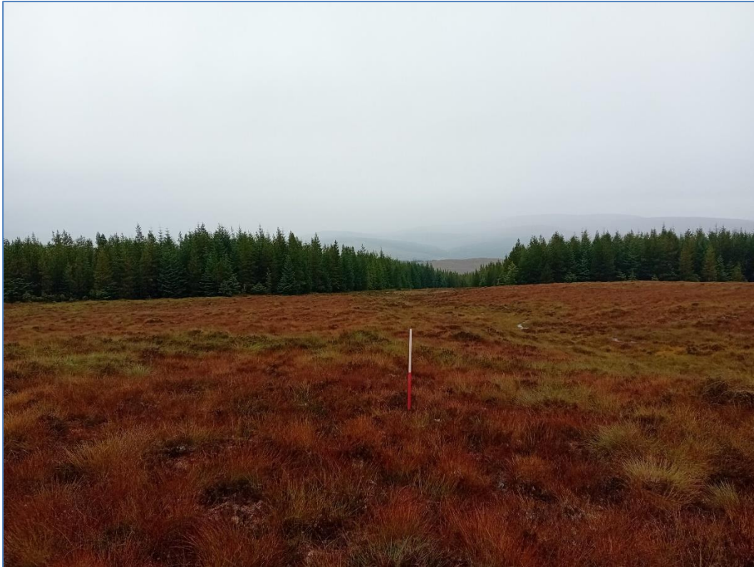
Plate 1: View north northeast over the open and undisturbed moorland along the southeast edge of Site