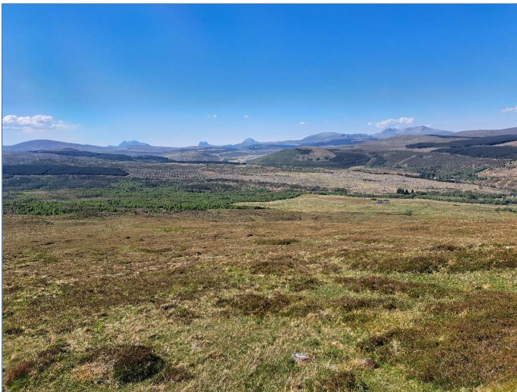
Plate 10: View along the proposed western access to Site, facing northwest