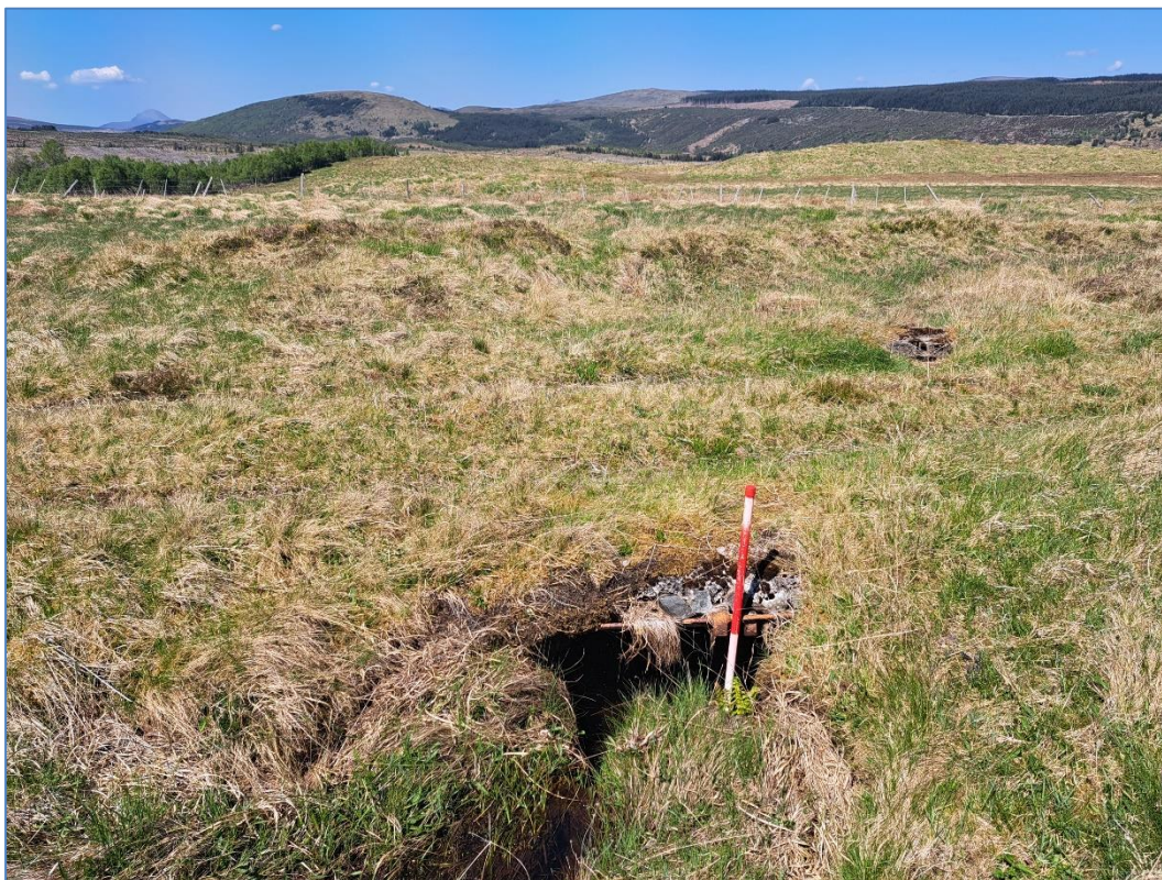
Plate 17: View over culvert (Asset 52) underlying track (Asset 49), facing north