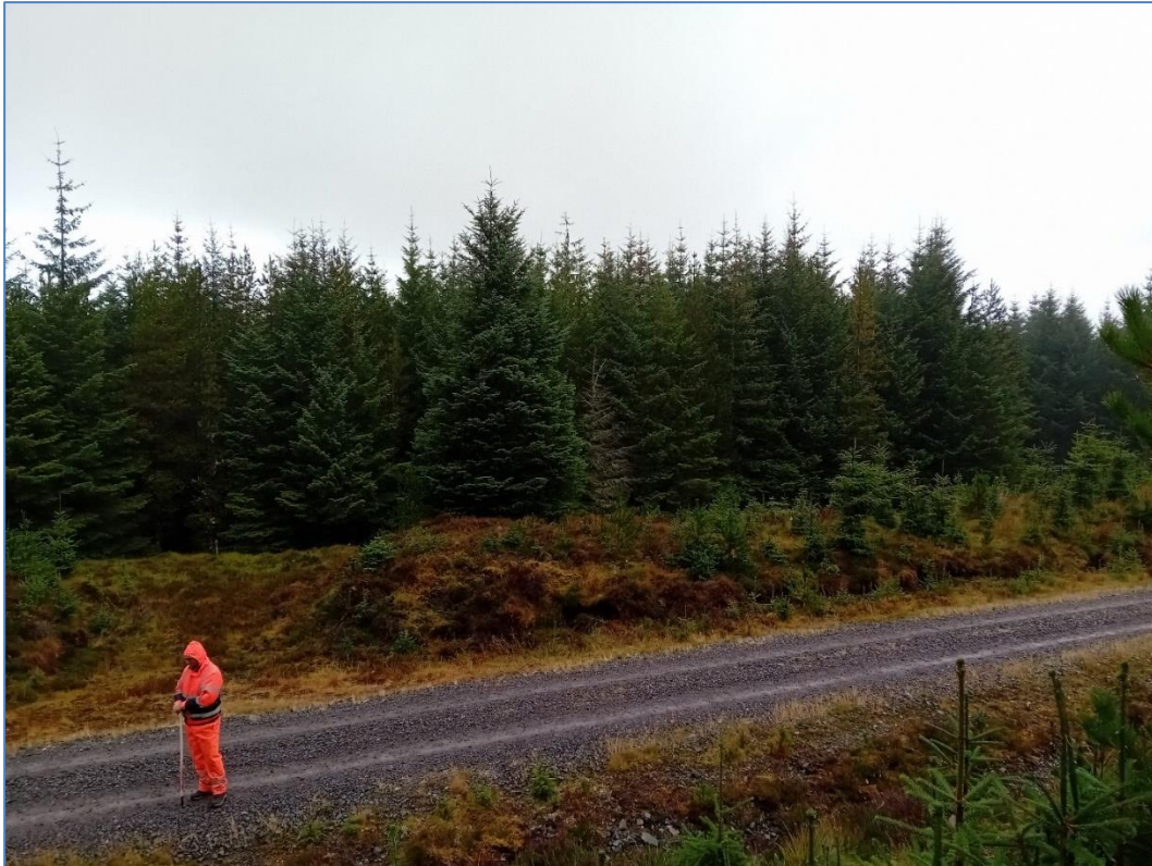
Plate 3: View over in-use forestry track that extends through the Site, facing southwest