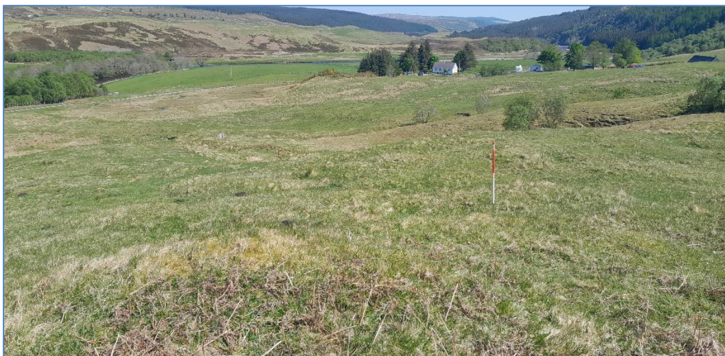
Plate 12: View over northeast east end of the east shieling settlement (Asset 47), facing northeast