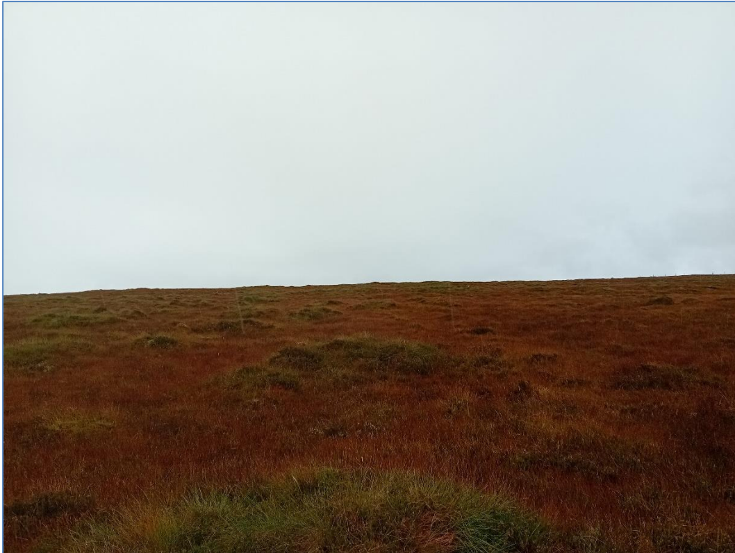
Plate 7: View towards T7 location, facing south