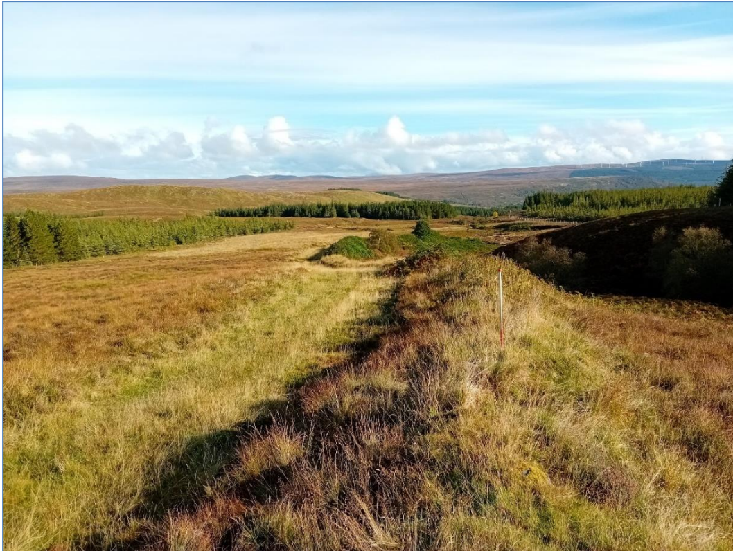
Plate 9: View along dis-used track and associated earthwork bank (Asset 35), facing northeast