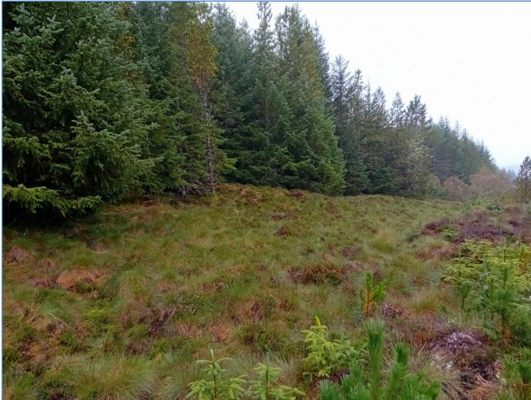
Plate 5: View over the east proposed substation and temporary construction compound areas (within forestry), facing southwest