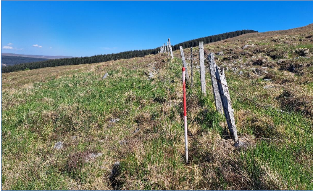
Plate 19: View over field boundary remnants (Asset 54), facing east