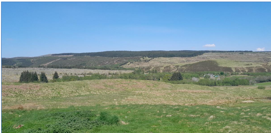
Plate 11: View towards shieling settlement (Asset 47), visible on middle ridgeline under bracken, facing north