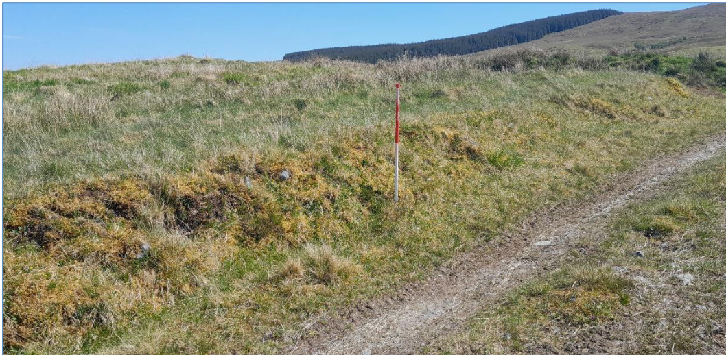
Plate 15: View over revetted wall (Asset 50) adjacent to track (Asset 49), facing southeast