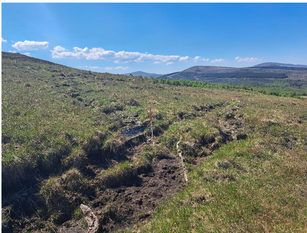
Plate 18: View over earth-cut drains (peat grips) forming part of wider drainage network (Asset 53) and showing potentially ancient prehistoric forestry remains being uncovered, facing west northwest