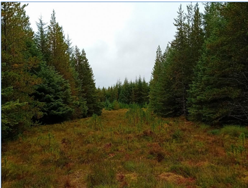
Plate 4: View along firebreak and route of proposed access track to the west substation and temporary construction compounds, facing west southwest