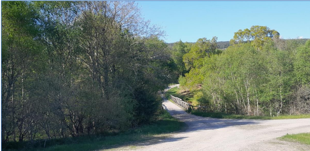
Plate 21: View over bridge (Asset 59) crossing the River Einer, facing north