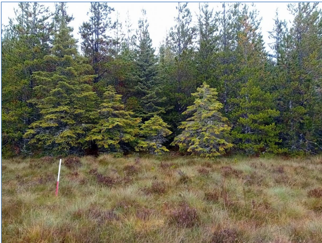
Plate 6: View towards T5 location, partly within forestry, facing north