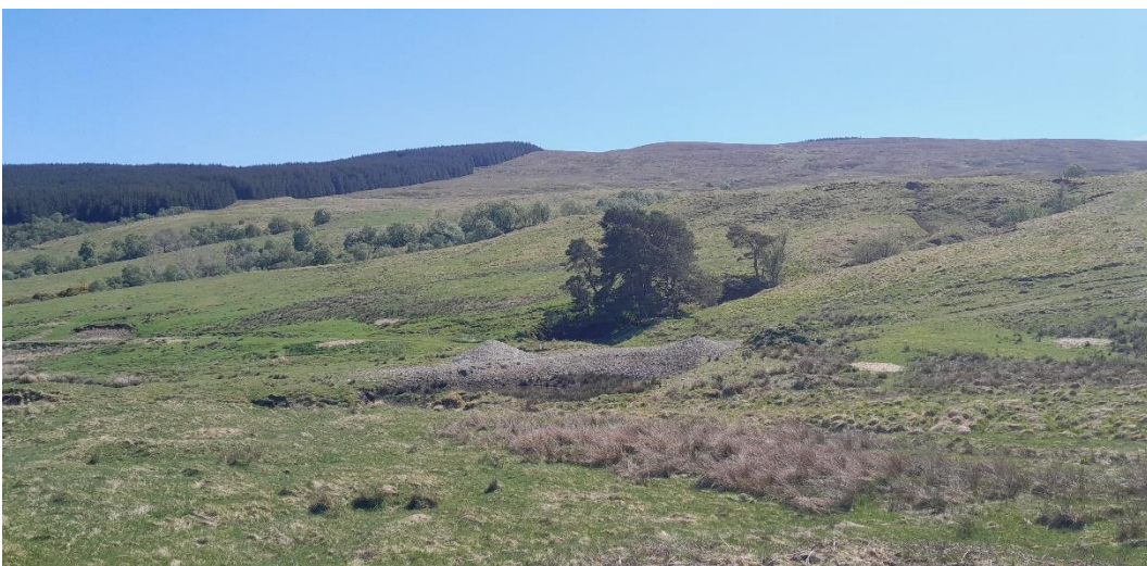
Plate 13: View over modern pond and gravel bunds (Asset 48) with track (asset 49) immediately beyond, facing southeast