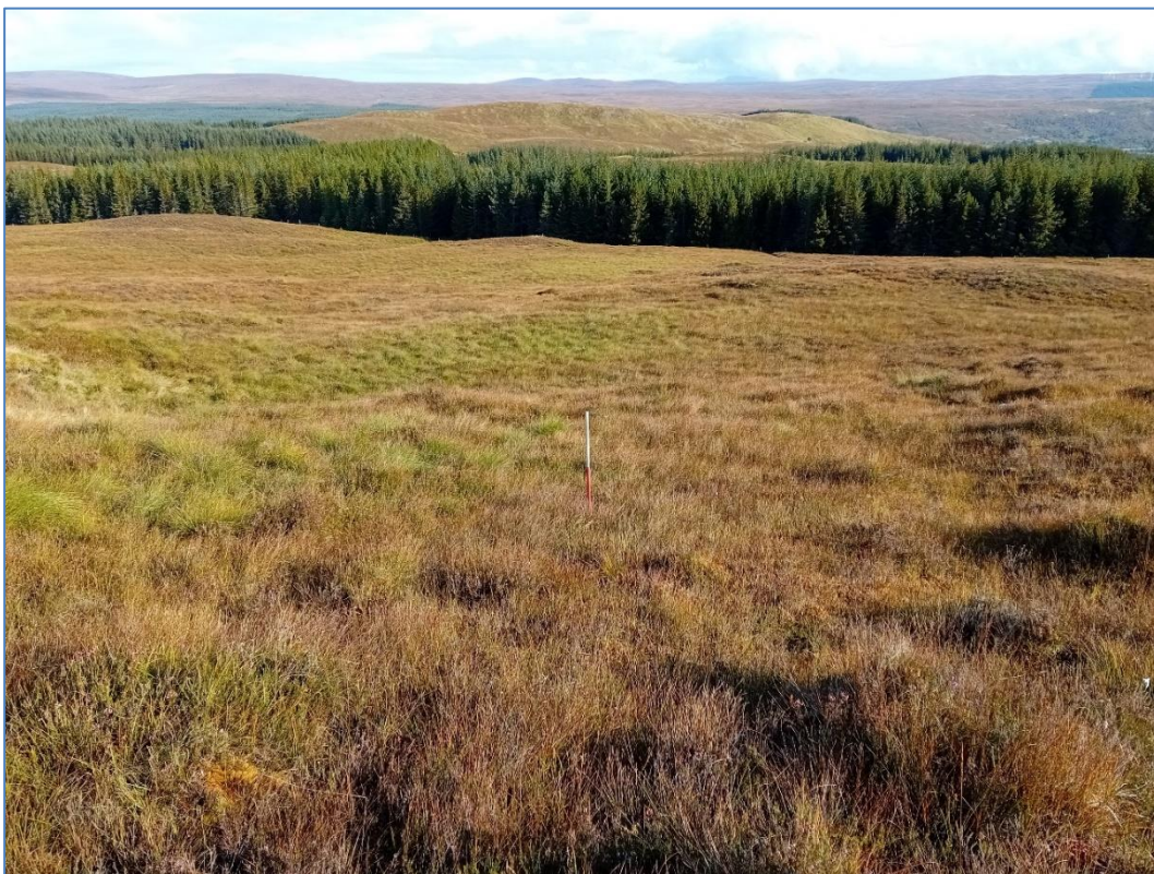
Plate 2: View over open, undisturbed moorland in north portion of Site, facing north