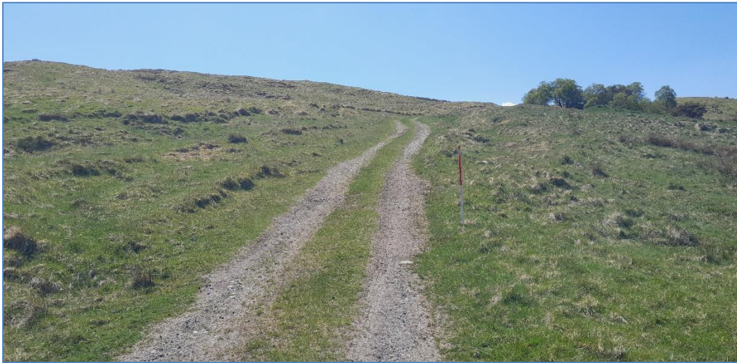
Plate 14: View along historic track (Asset 49), facing southwest