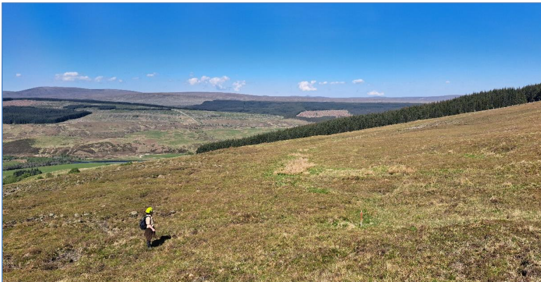
Plate 20: View over track (Asset 55; centre frame), visible as the course of greener vegetation, facing northeast