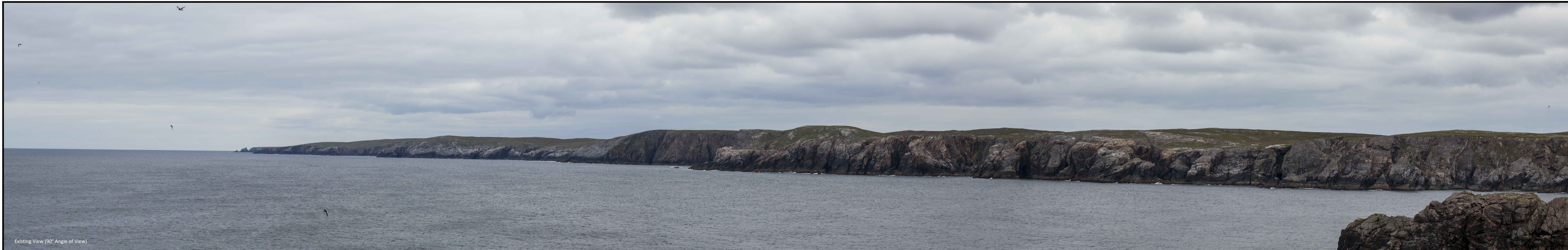
Existing View (90° Angle of View)