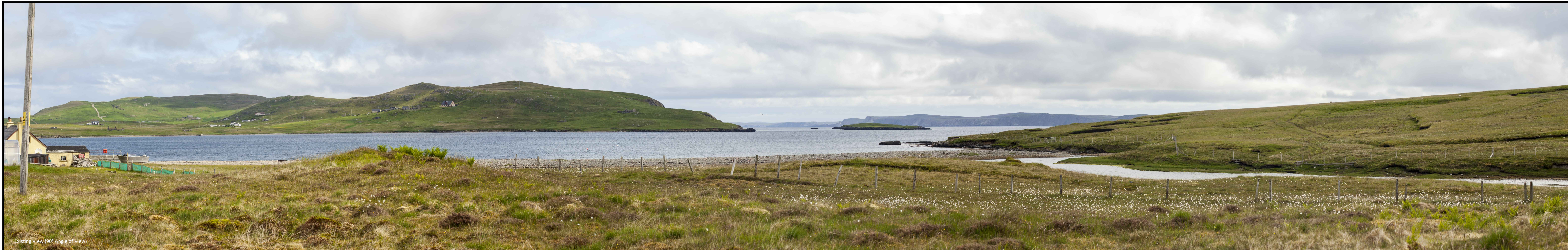
Existing View (90° Angle of View)