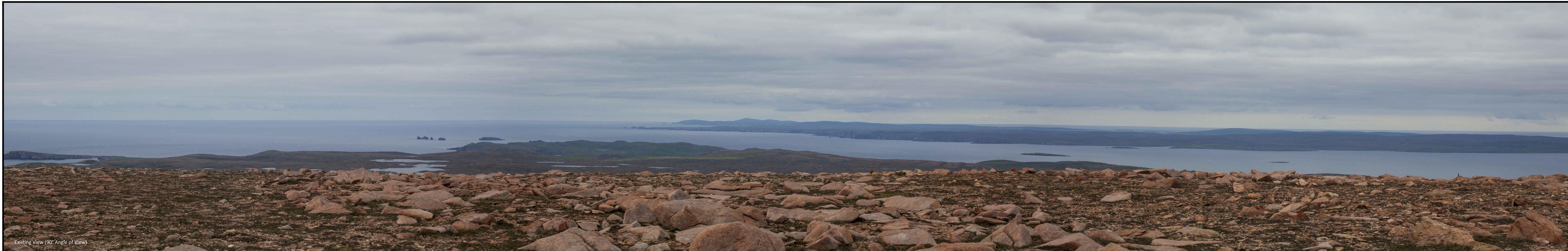
Existing View (90° Angle of View)