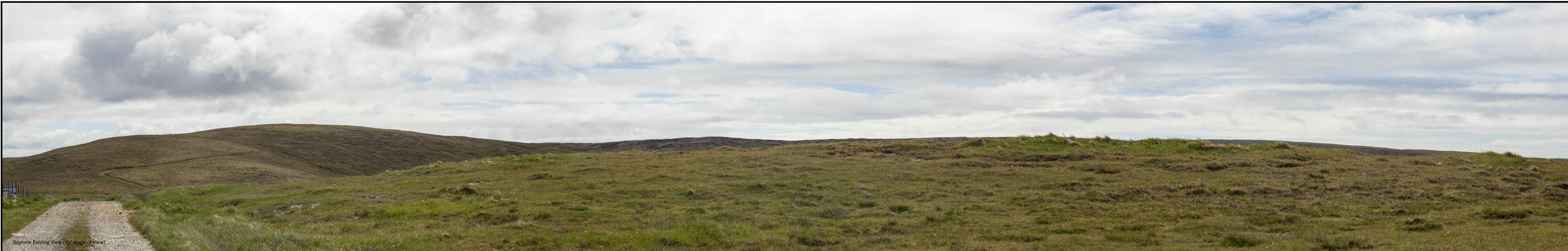
Daytime Existing View (90° Angle of View)