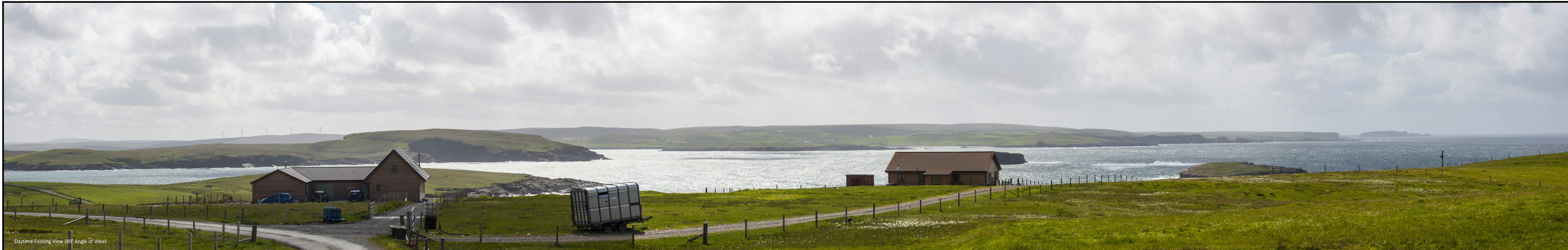
Daytime Existing View (90° Angle of View)